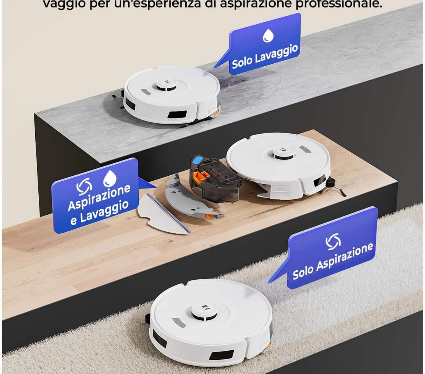
Image 4.1: The Redkey R11 can operate in vacuum-only, mop-only, or combined vacuum and mop modes, adapting to different cleaning needs.

Consiglio per la pulizia dei tappeti: Rimuovi il modulo di lavaggio per un'esperienza di aspirazione professionale.