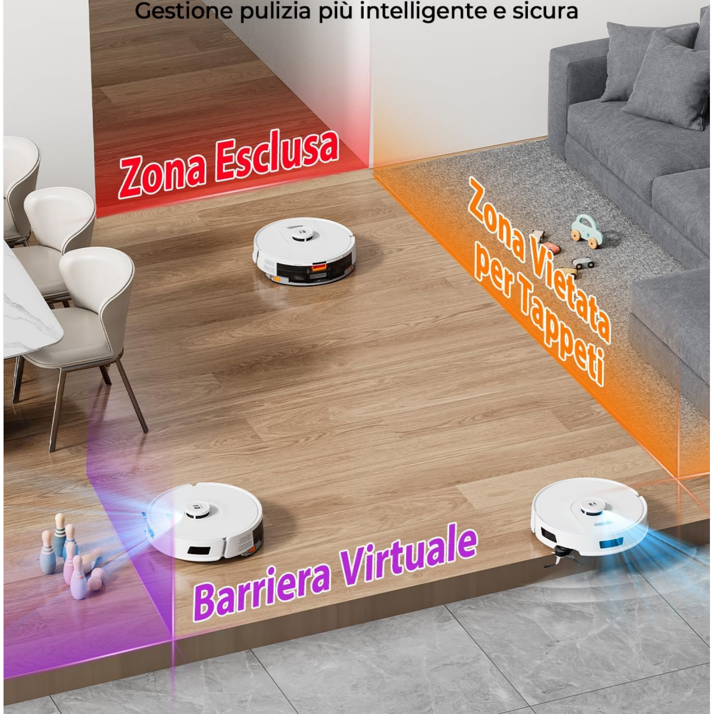
Image 4.5: Users can set virtual barriers and no-go zones via the app for intelligent and secure cleaning management.

Gestione pulizia più intelligente e sicura