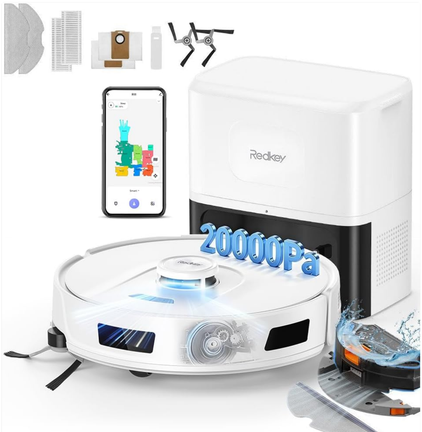
Image 1.1: Redkey R11 Robot Vacuum and Mop with its auto-empty station and included accessories, showcasing its comprehensive cleaning system.