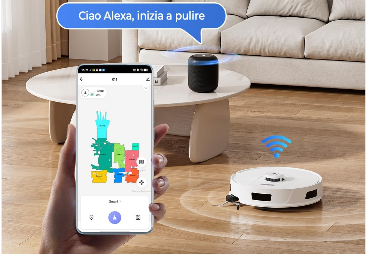
Image 4.6: Control your Redkey R11 conveniently using voice commands through Amazon Alexa or Google Home.