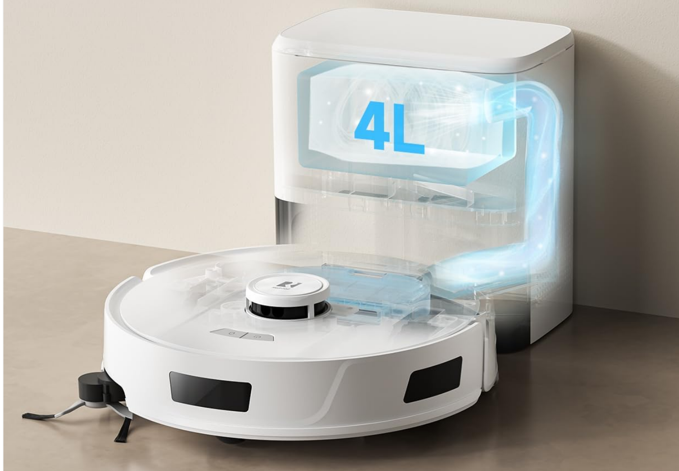
Image 5.1: The auto-empty station with a 4L dust bag allows for up to 90 days of hands-free dust disposal.