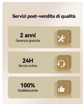
Image 8.1: Redkey's commitment to quality after-sales service, including warranty and support.

For technical assistance, warranty claims, or any other inquiries, please contact Redkey customer support through the official website or the Redkey Smart app.