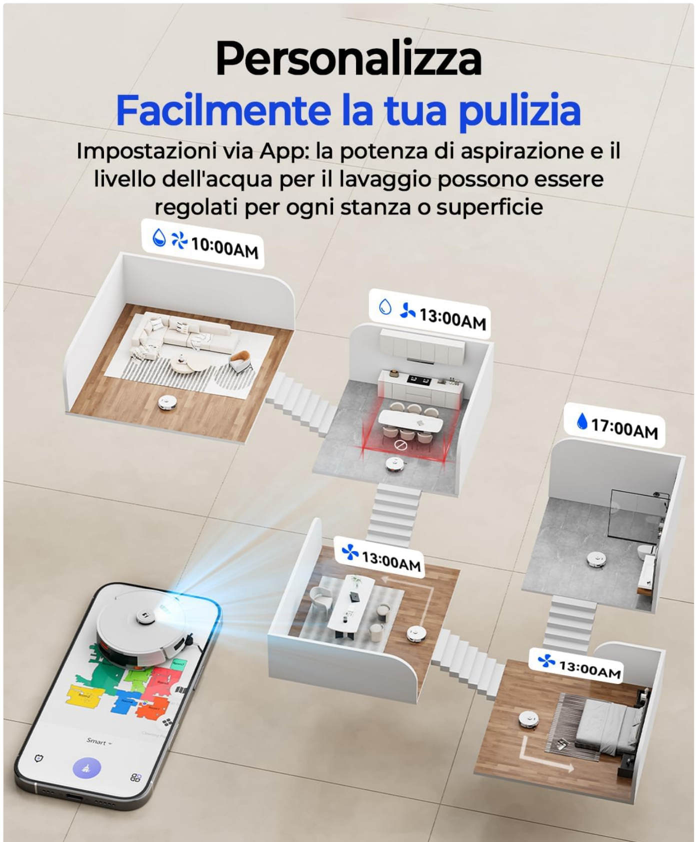
Image 4.4: The app allows for easy customization of cleaning tasks, including scheduling and adjusting settings per room.