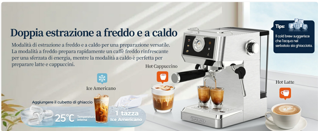
Figure 12: Double cold and hot extraction modes for versatile coffee preparation.

Your browser does not support the video tag.