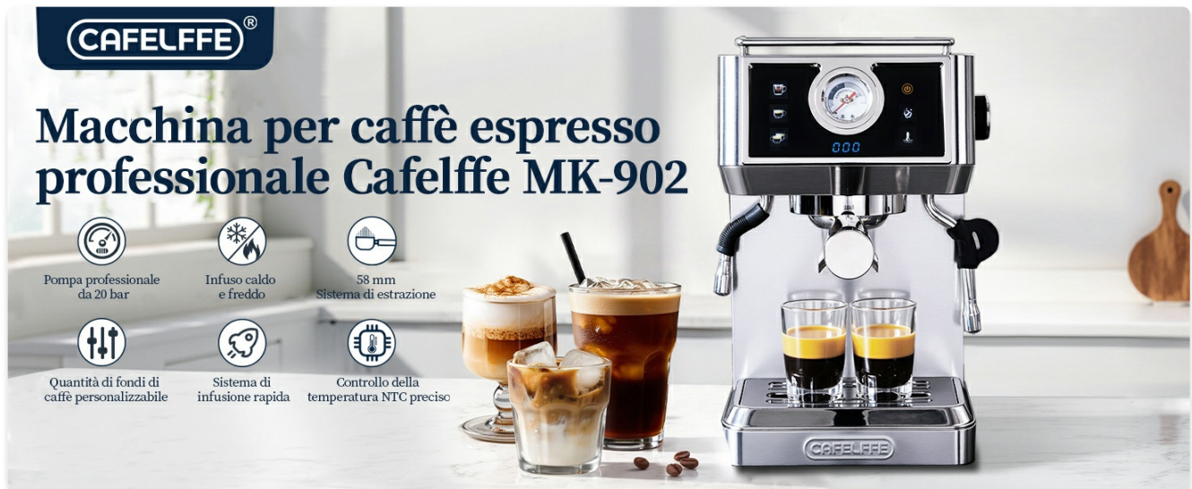
Figure 2: Professional Espresso Machine CAFELFFE MK-902 with various brewing capabilities.