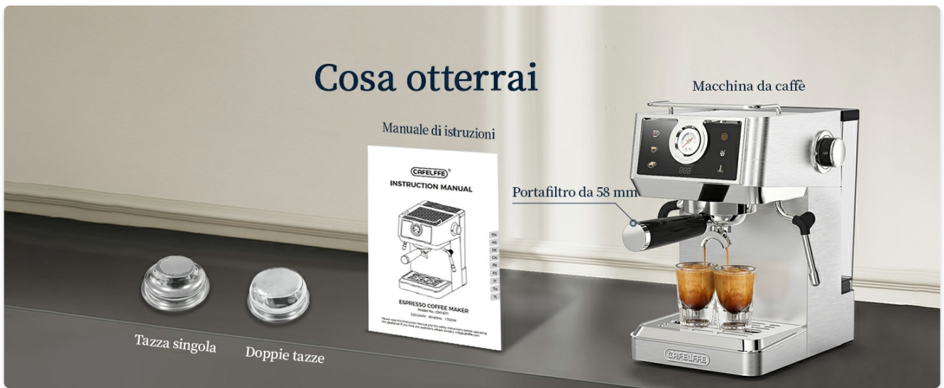
Figure 3: What you will receive with your CAFELFFE MK-902.