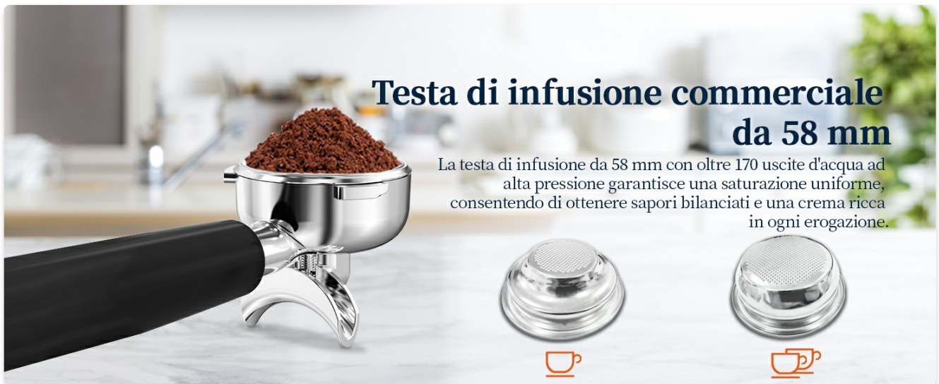
Figure 6: The 58mm commercial infusion head ensures uniform saturation for balanced flavors.