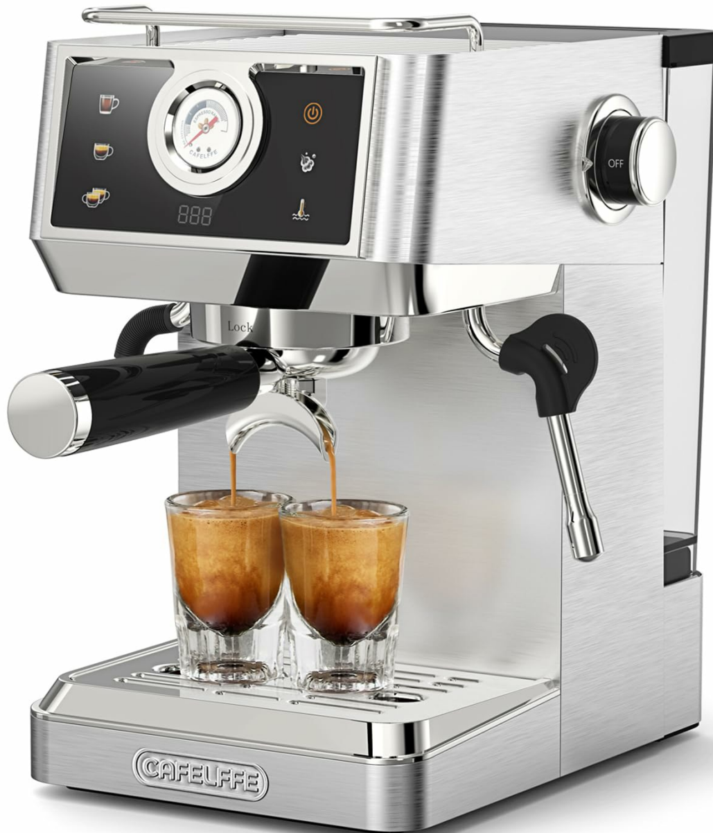
Figure 1: CAFELFFE MK-902 Semi-Automatic Espresso Machine