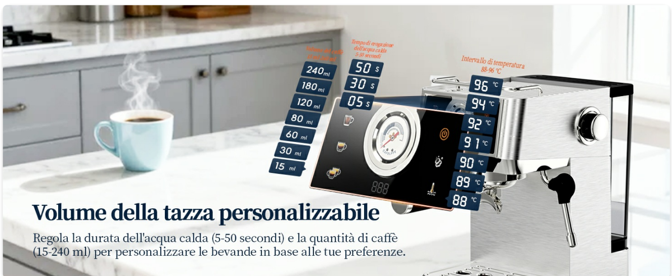
Figure 7: The visual manometer allows real-time monitoring of extraction pressure.