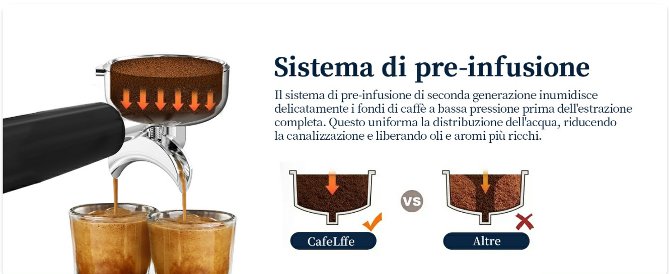
Figure 8: The second-generation pre-infusion system gently moistens coffee grounds at low pressure before full extraction.