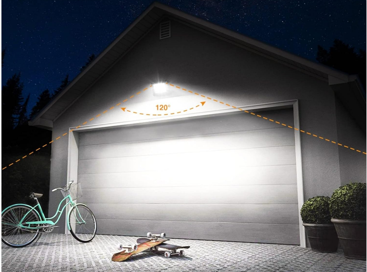
Figure 2: Illustration of the floodlight's 120-degree wide beam angle, providing extensive illumination for areas like a garage entrance.

120-degree wide beam angle, providing a wide range of illumination.