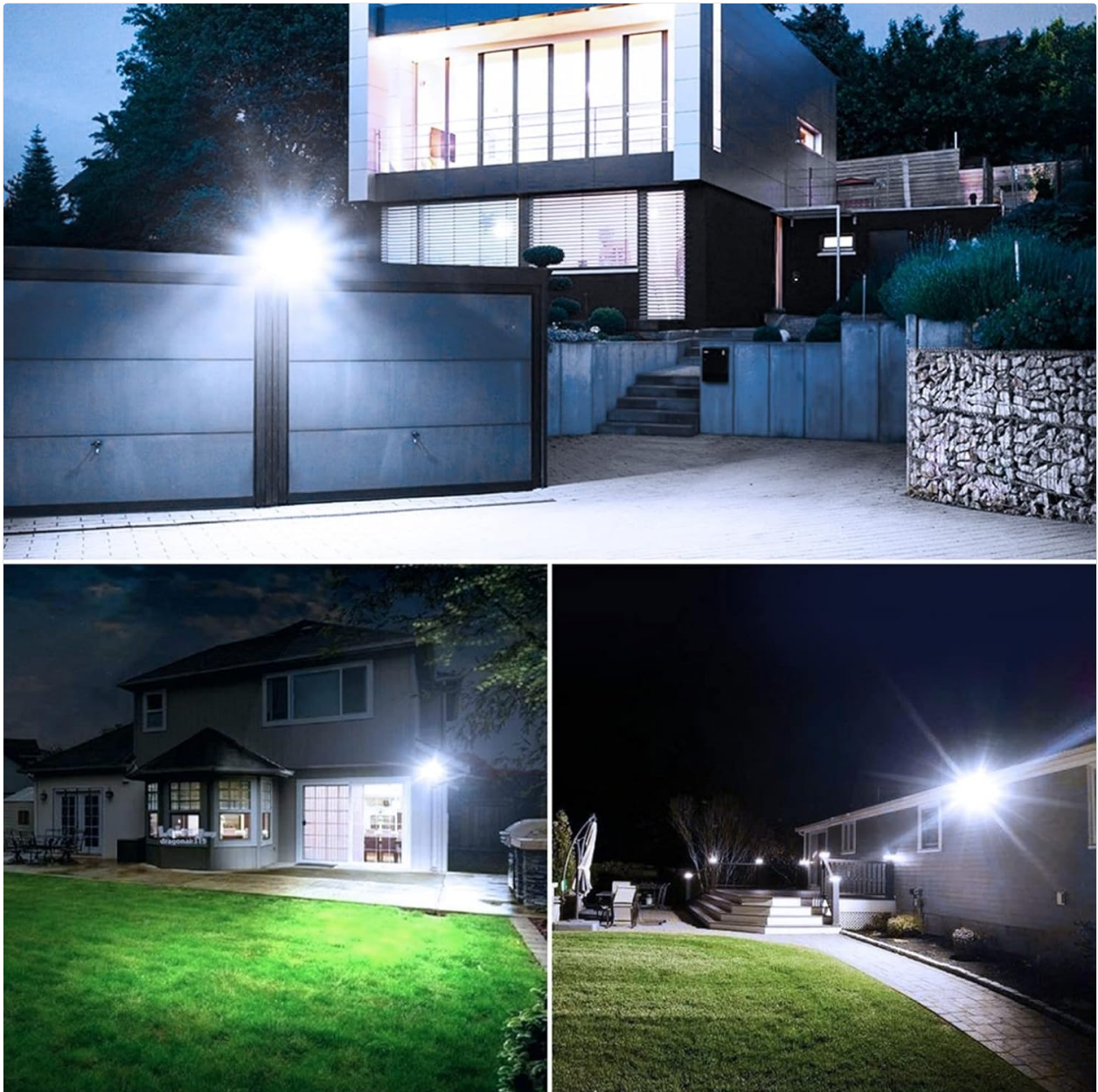
Figure 6: Examples of the floodlight in use, providing bright illumination for various outdoor settings such as driveways, gardens, and pathways.