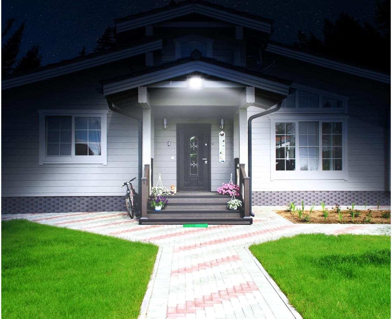
Figure 3: The floodlight illuminating a house entrance, highlighting its super bright output of 700 lumens and cool white color temperature.

Super Bright: 1000Lm Color Temperature: 6000-6500K