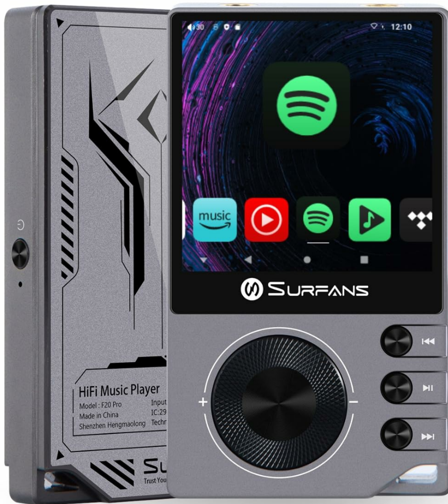
The Surfans F20 Pro Hi-Res Music Player, showcasing its compact design and touchscreen interface.