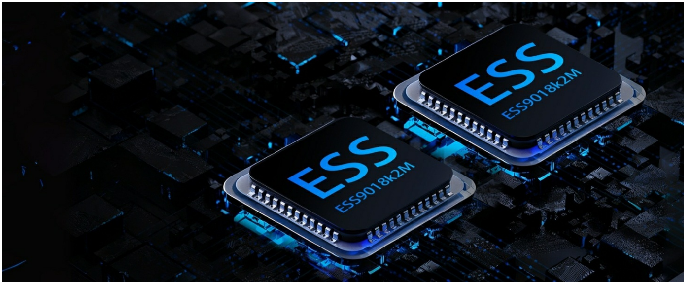
An illustration of the dual ESS9018K2M DAC chips, central to the F20 Pro's high-resolution audio capabilities.