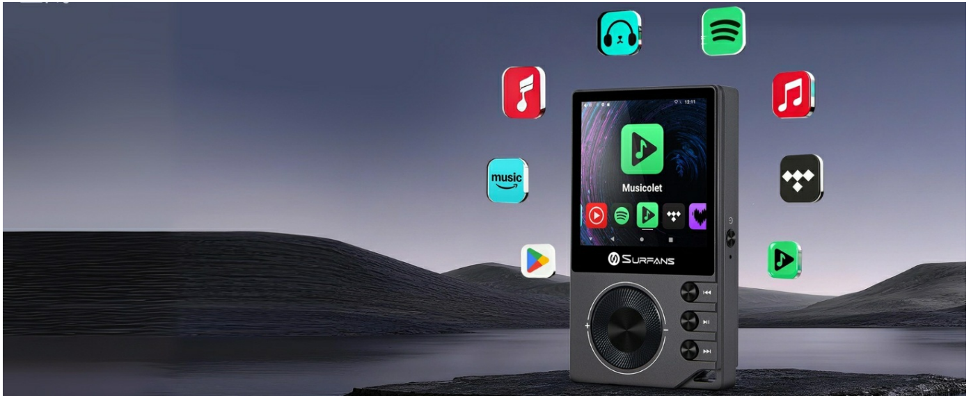
The Surfans F20 Pro's screen showing various streaming application icons, demonstrating its Android capabilities.

The Android 12 operating system allows installation of streaming apps like Spotify, Apple Music, Tidal, or YouTube. Connect to Wi-Fi and download apps from the Google Play Store or other compatible sources.