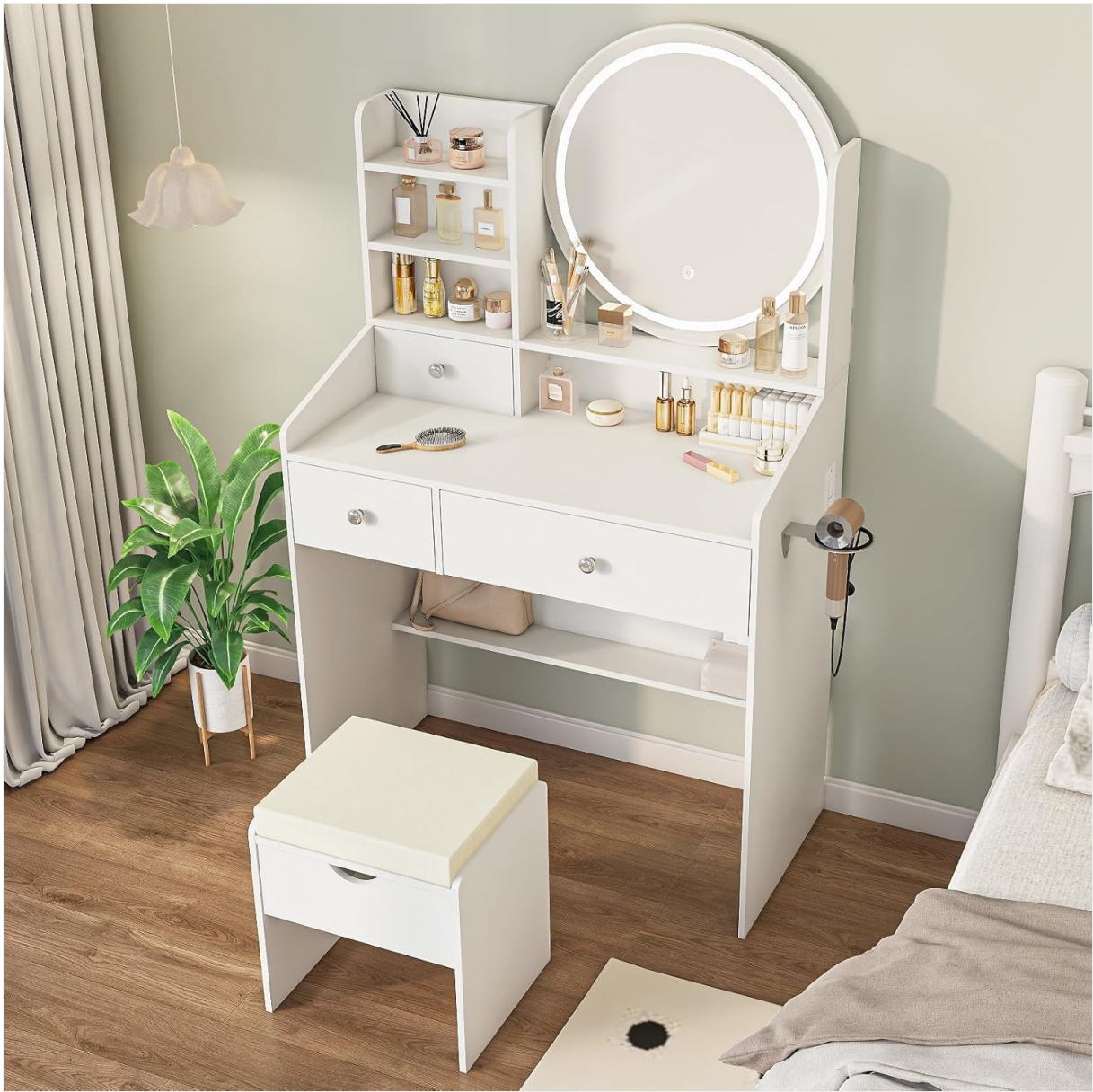
Image: Overview of the vanity desk highlighting its various storage compartments (open shelves, drawers) and the round LED mirror.