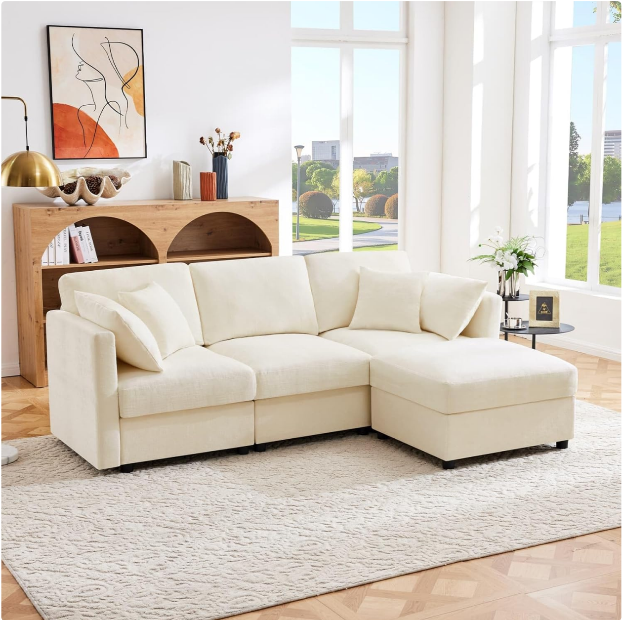
Image 3.1: Details of reinforced seating, soft chenille fabric, and four included cushions.