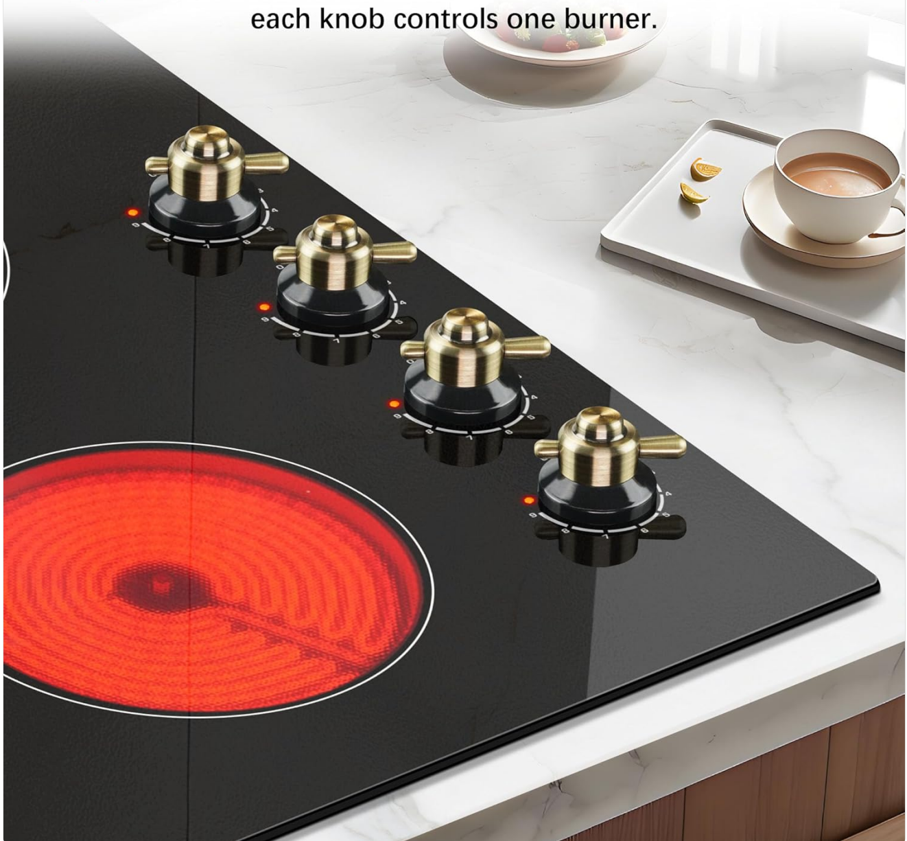
Image: A close-up view of the cooktop's control panel, highlighting the four gold-colored knobs for individual burner control.