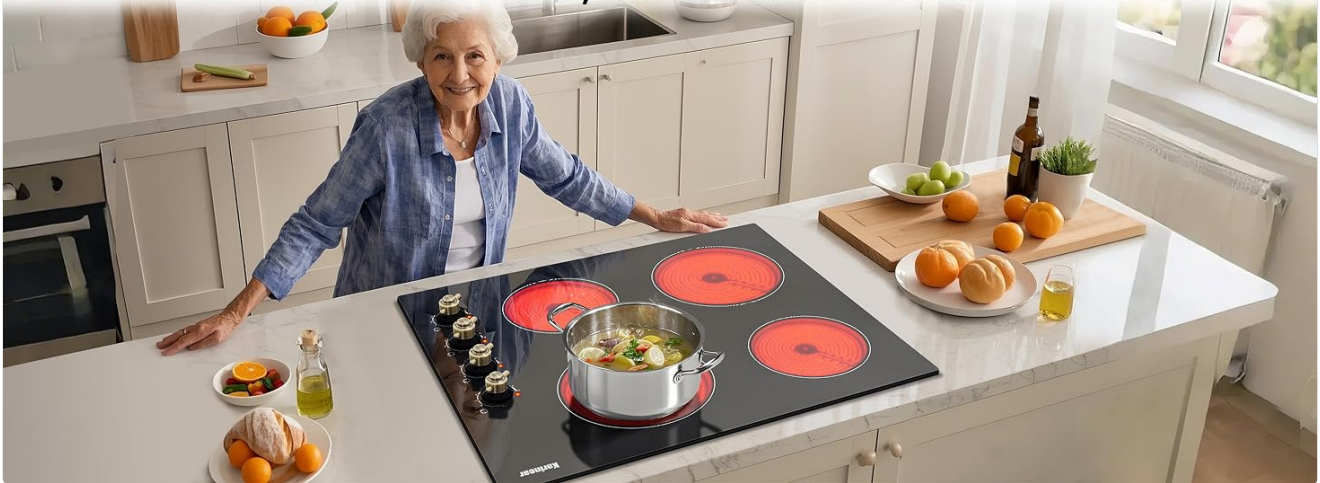
Image: The cooktop in use, demonstrating different power levels for various cooking tasks, from simmering to boiling.