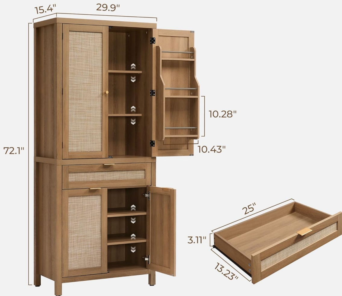
Image 1: Overall dimensions of the SICOTAS 72 inch Tall Pantry Cabinet, showing a depth of 15.4 inches, width of 29.9 inches, and height of 72.1 inches. The image also details the dimensions of the door shelves and the large drawer.