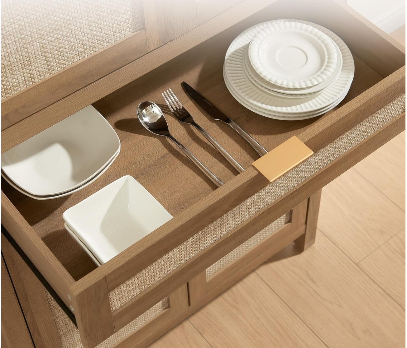
Image 4: The large storage drawer pulled open, displaying plates and cutlery, demonstrating its capacity for various storage needs.