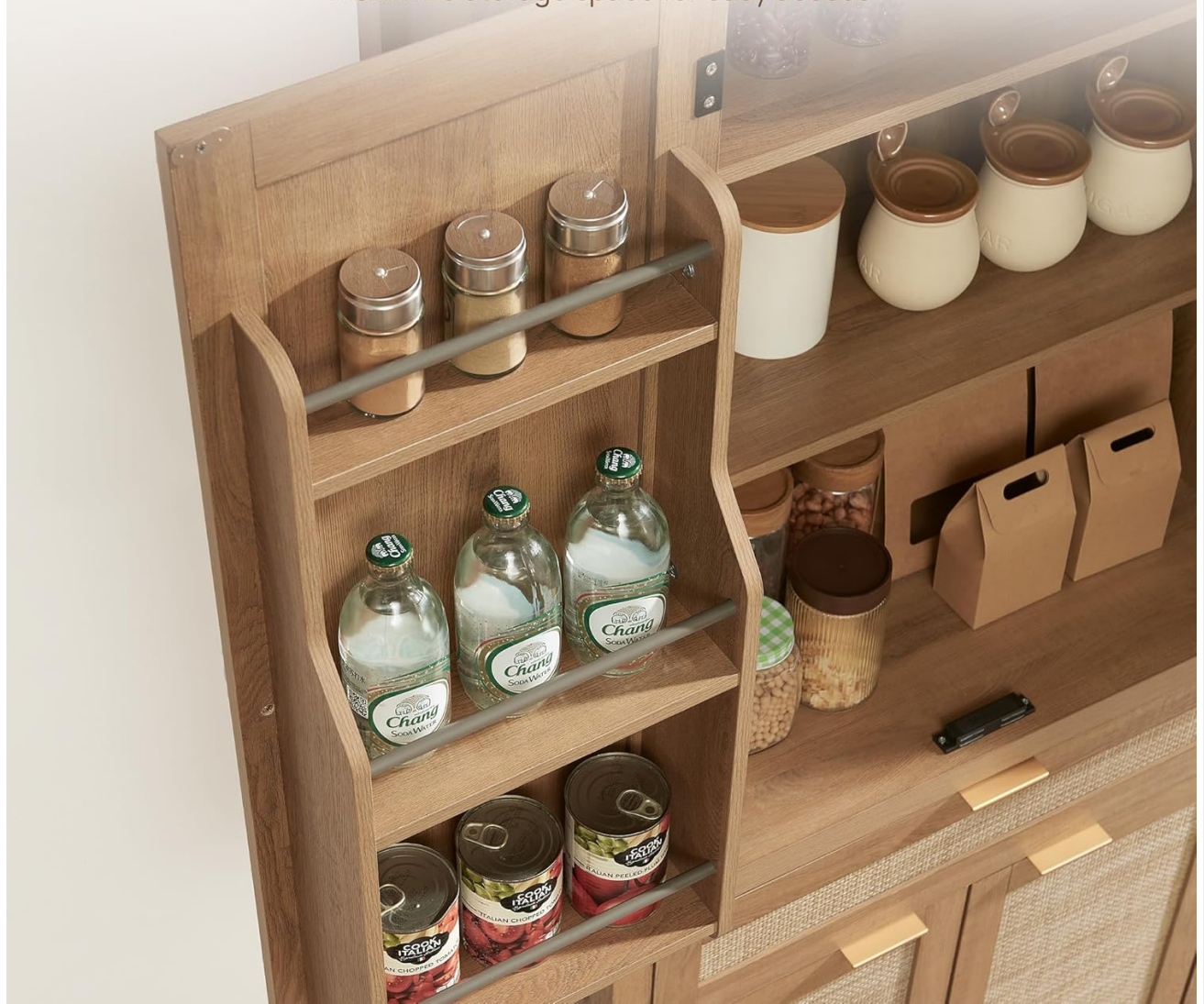
Image 3: An interior view of the upper cabinet, highlighting the six door shelves designed to maximize storage space for small items like spices and condiments.