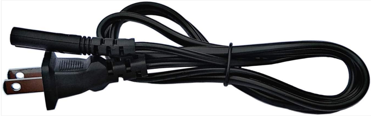
Image: The eeTao AC power cord neatly coiled and secured with a tie, illustrating recommended storage practice.