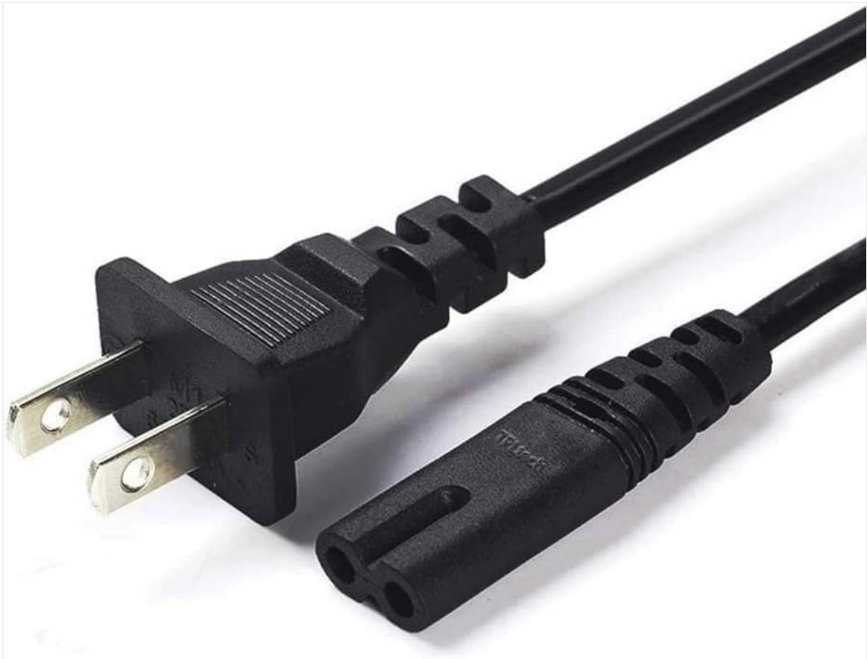
Image: Close-up of the power cord's connectors, illustrating the US 2-prong plug and the C7 connector for proper identification during setup.

Once both ends are securely connected, your projector should receive power and be ready for operation or charging.