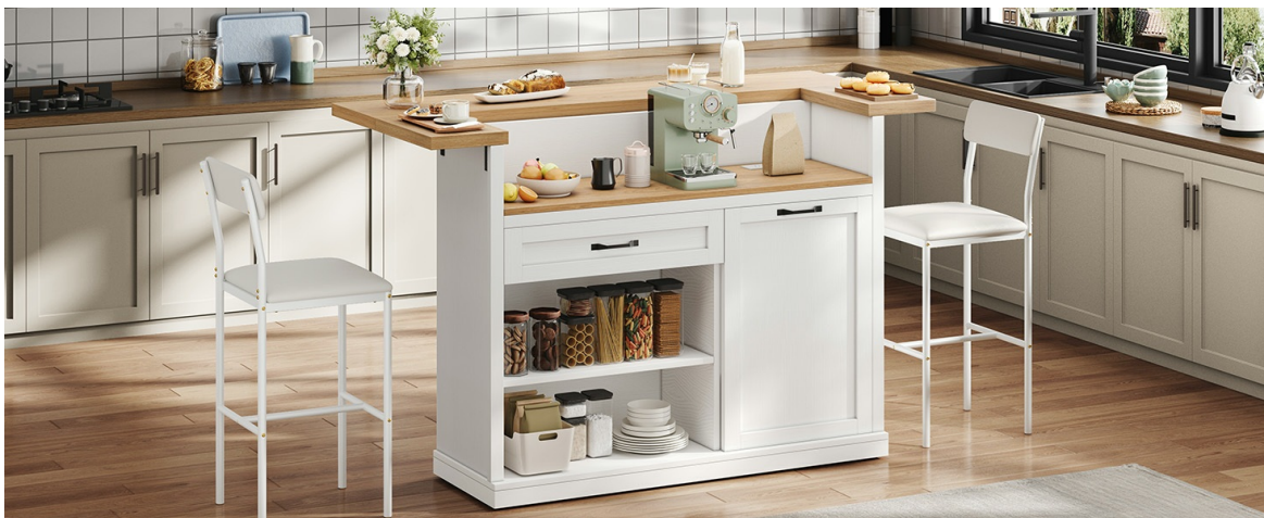
Image 5.4: The multi-layer storage cabinet with its doors open, demonstrating its capacity for various kitchen items.