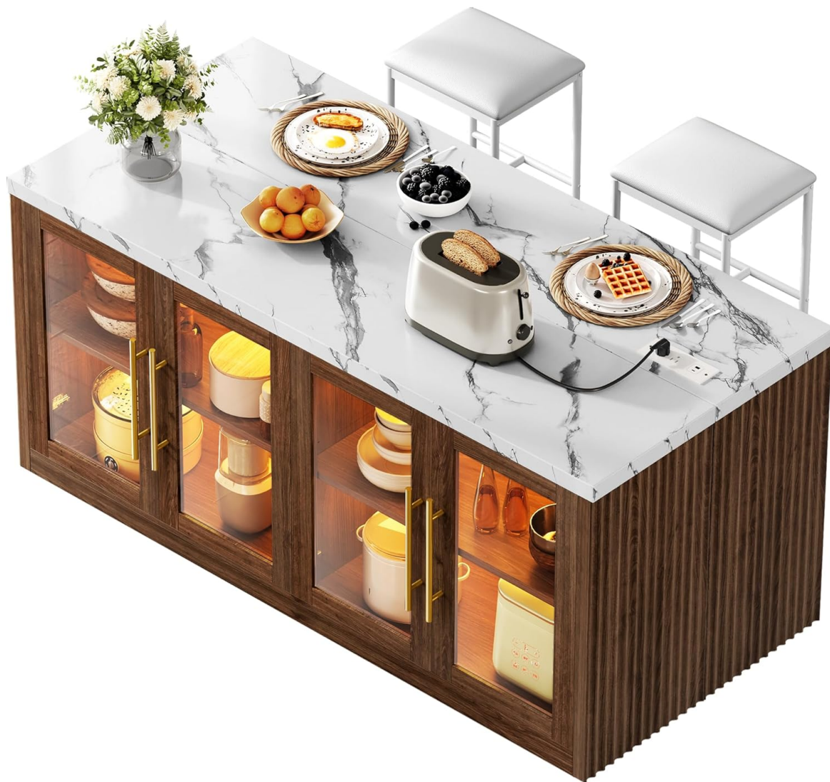
Image 1.1: The Homiflex Kitchen Island with Storage and LED Light, showcasing its design and functionality in a kitchen environment.