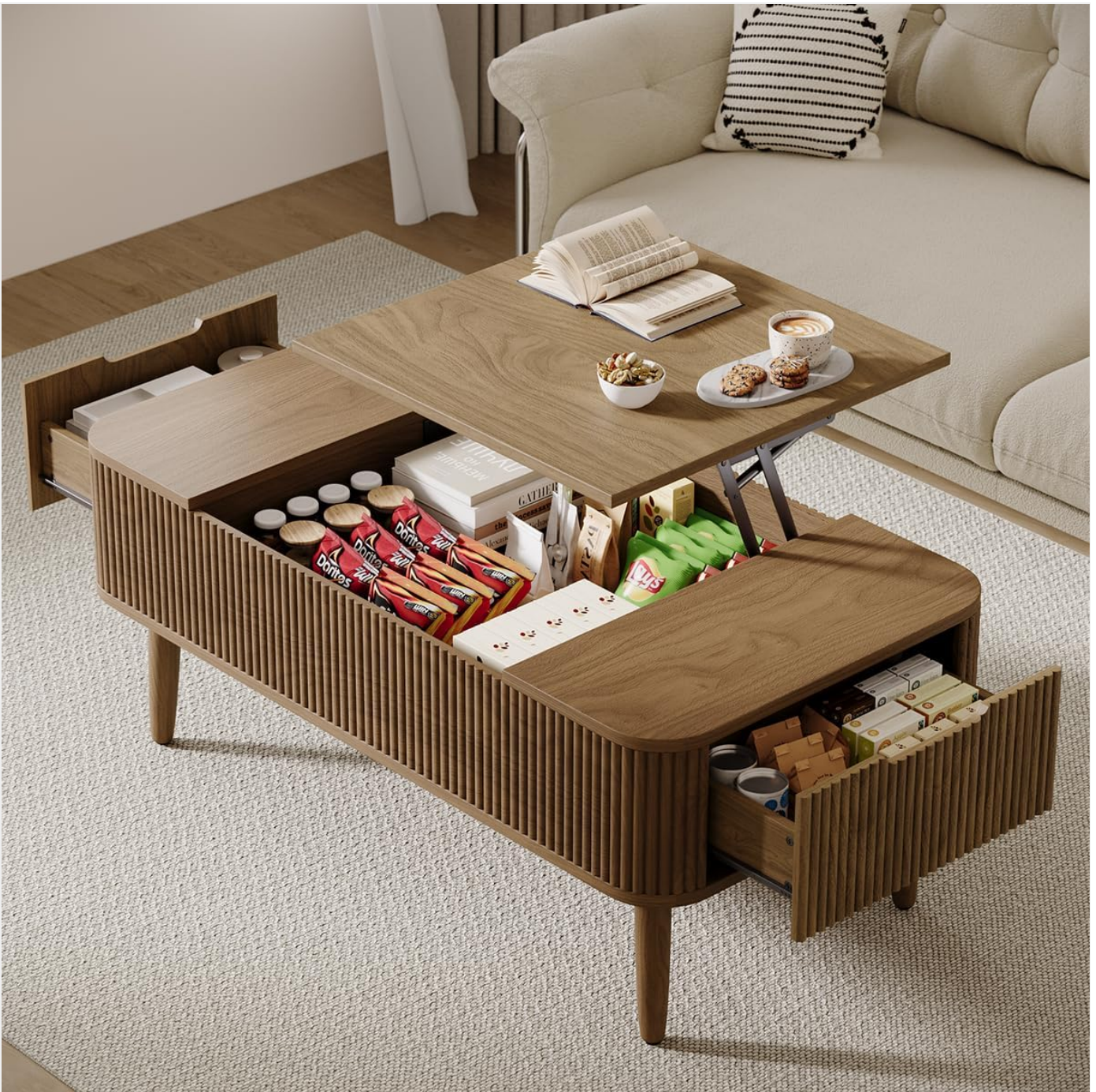
Image: The coffee table with its lift-top raised, showcasing the hidden storage compartment and the extended surface for use.

obstructing the mechanism during movement.