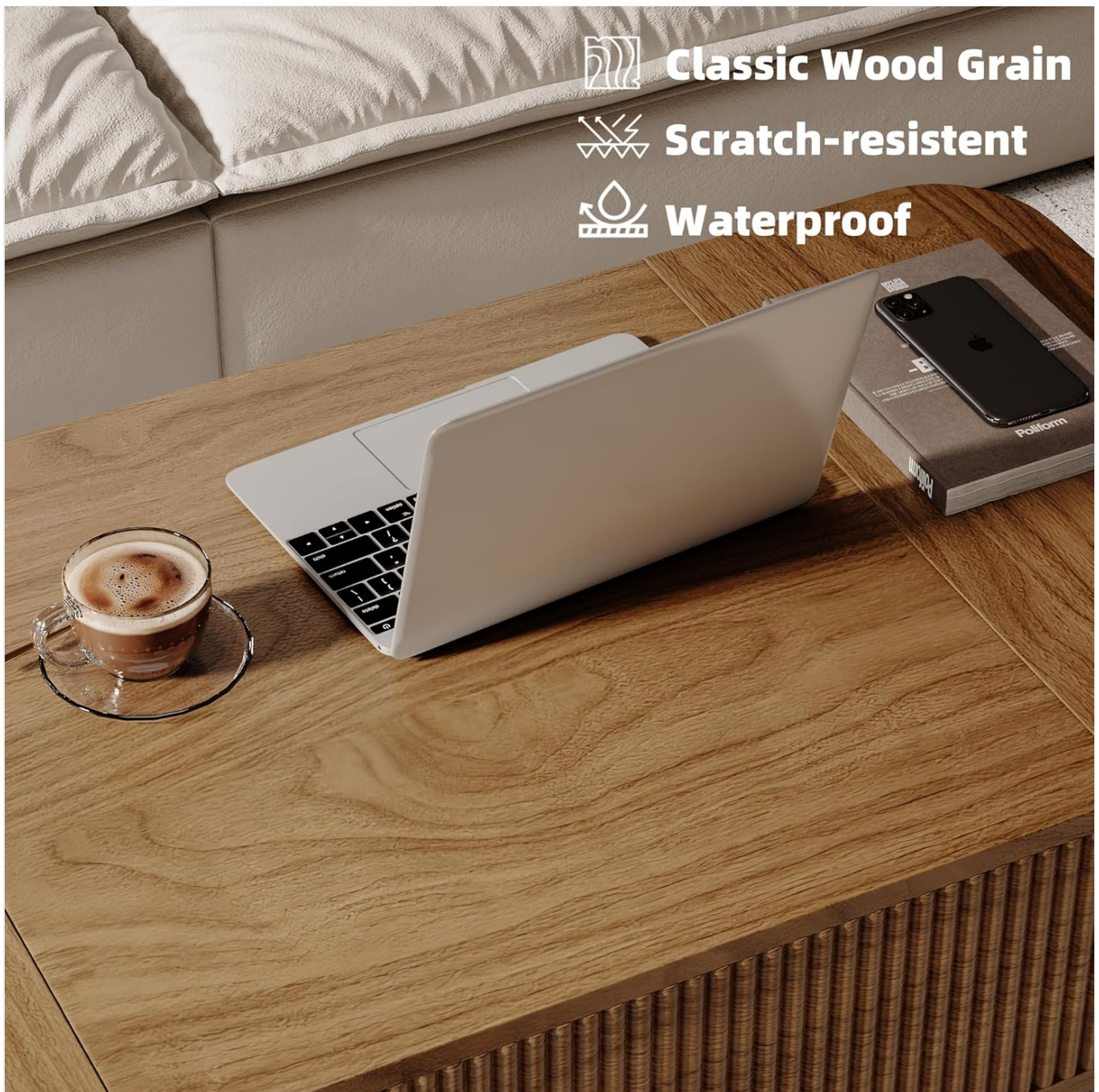
Image: The TOKSOM 47.2-inch Walnut Lift-Top Coffee Table, showcasing its modern design and fluted details.