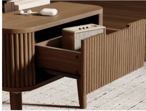
Image: A close-up of one of the side storage drawers, showing its capacity and smooth gliding mechanism.

The table includes two side storage drawers and a large hidden compartment beneath the lift-top. These areas are designed to store various items such as blankets, books, laptops, and remote controls, helping to keep your living space organized.