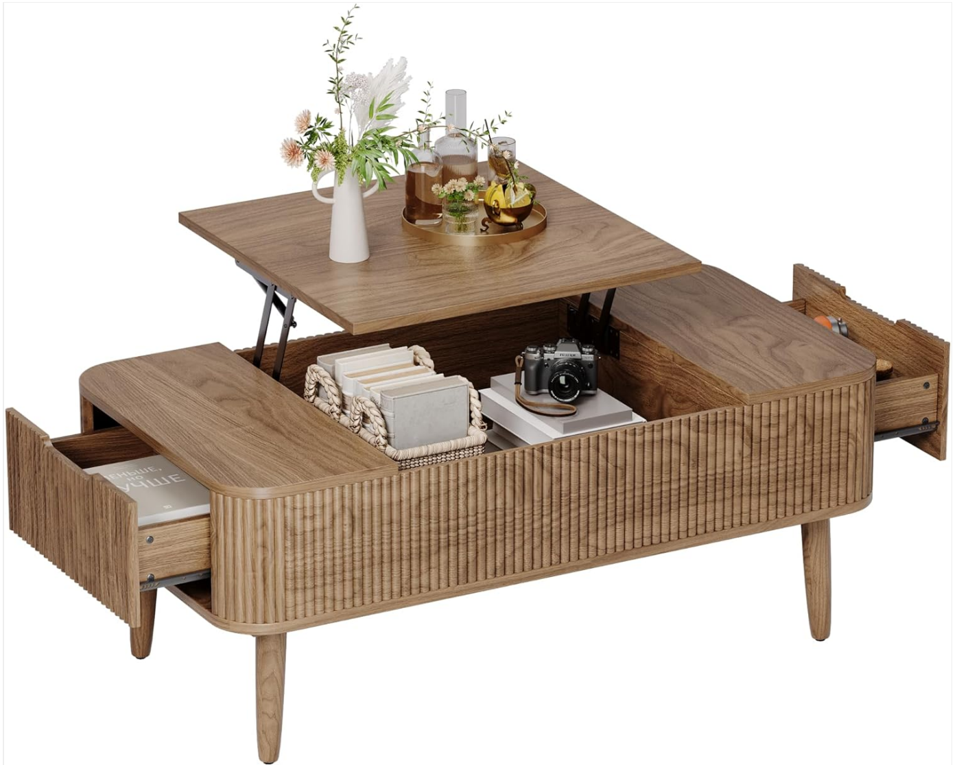
Image: The TOKSOM coffee table in a living room setting, illustrating its assembled form. This image represents the final product after successful assembly.

Follow the step-by-step instructions provided in the separate assembly guide included with your product. Pay close attention to the orientation of each piece and the type of hardware used for each connection.