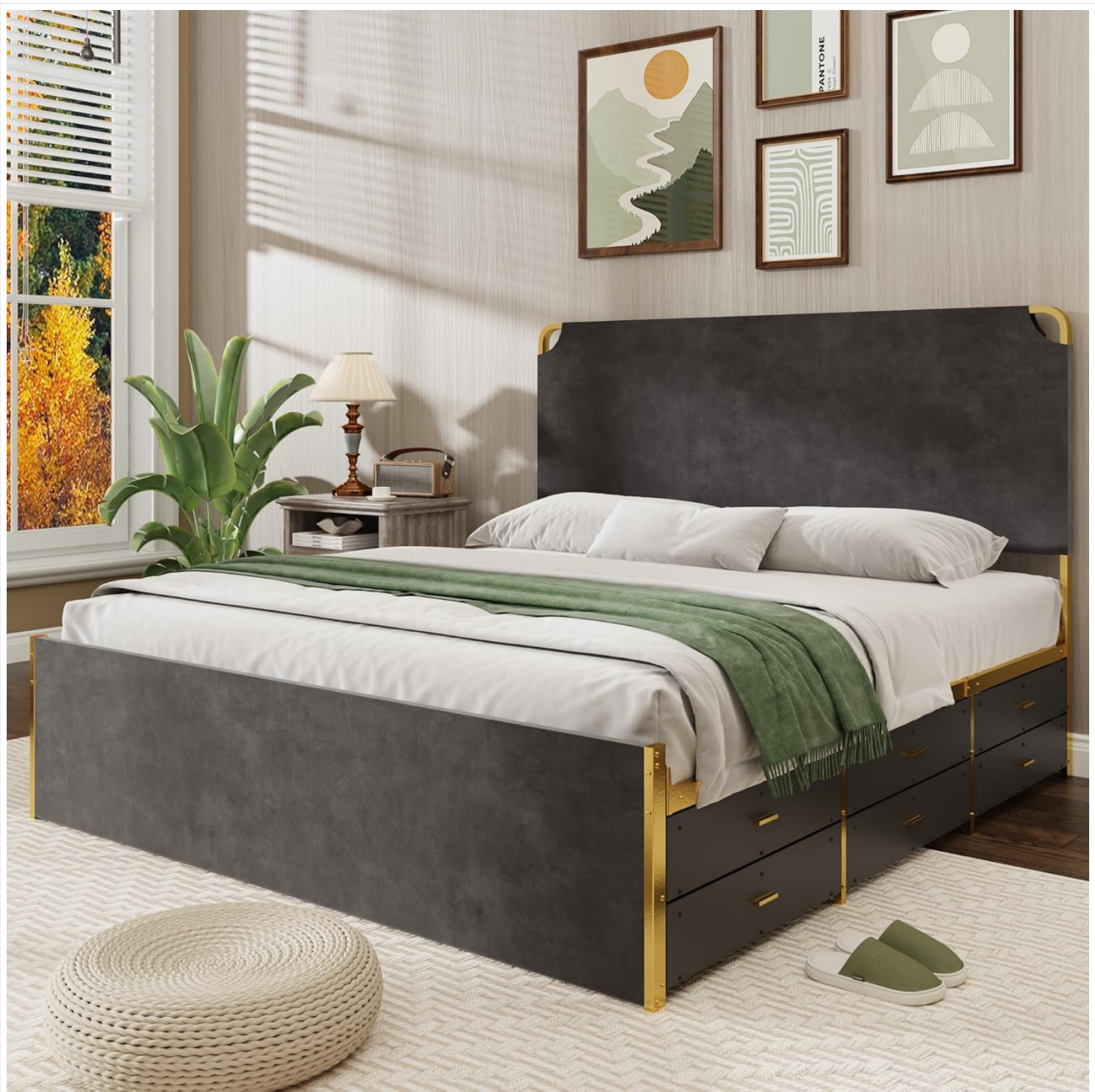
Image 1.1: The SAMTRA King Bed Frame with 12 Fabric Drawers, showcasing its design and storage.