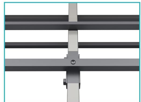
Sturdy central structure