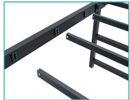
Easy to install