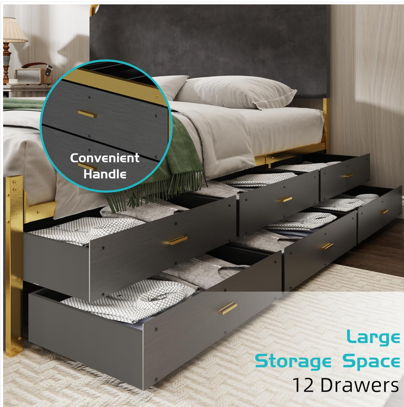
Image 4.2: The 12 fabric drawers with convenient handles for ample storage.