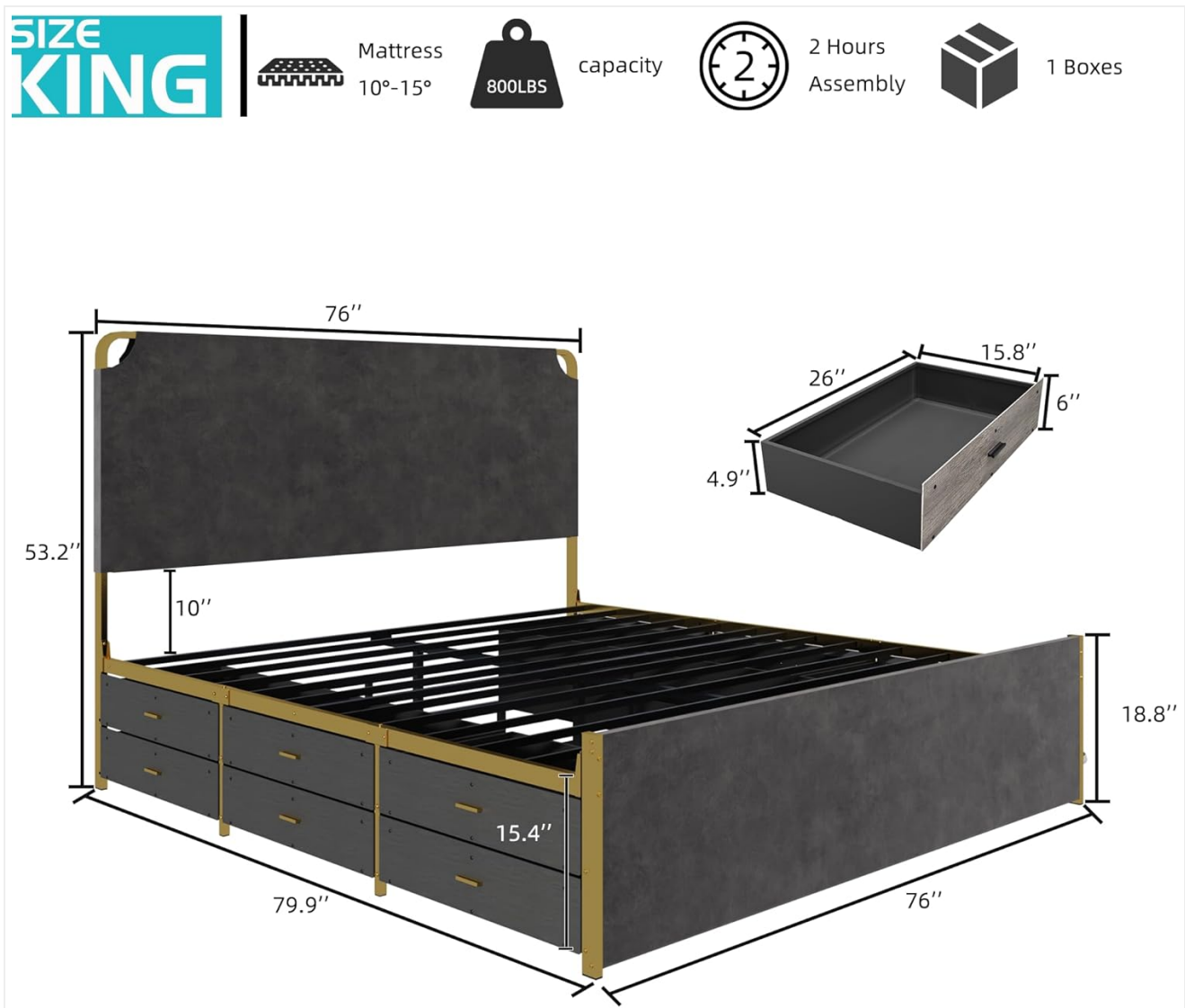
Image 3.1: Product dimensions and key specifications for assembly planning.

Assembly of the SAMTRA King Bed Frame is required. It is recommended that two adults perform the assembly. While an estimated assembly time is 2 hours, actual time may vary.