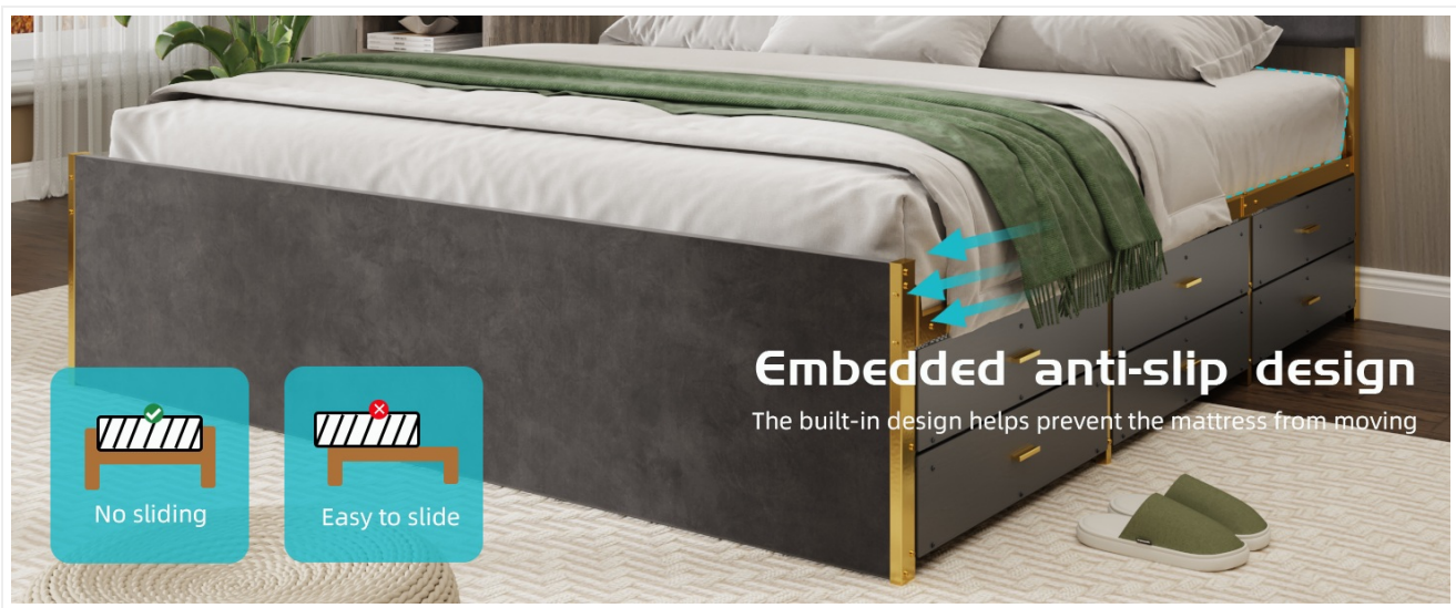
Image 4.1: Illustration of the anti-slip design for mattress stability.