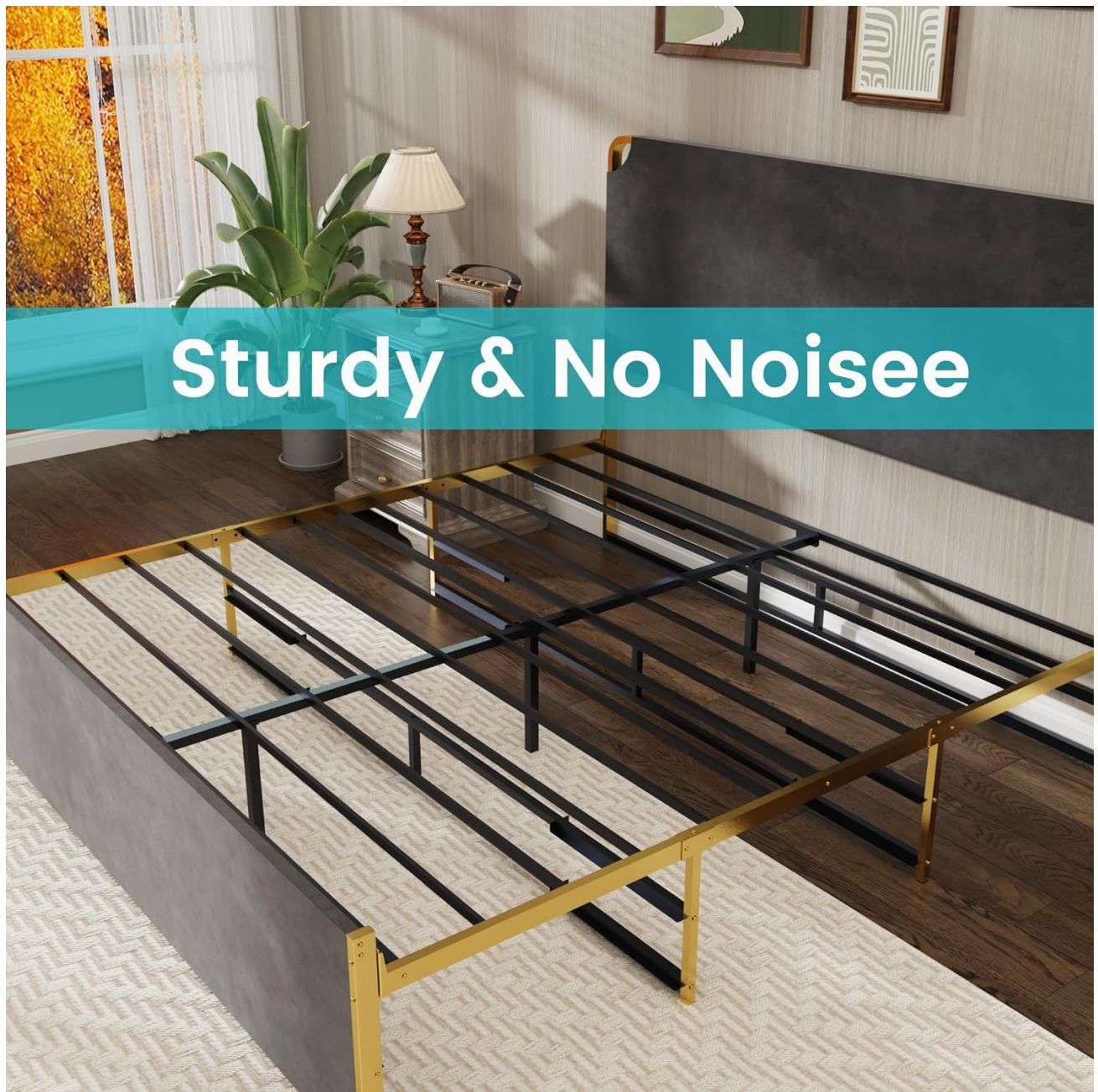
Image 3.3: The robust metal frame designed for stability and silent operation.