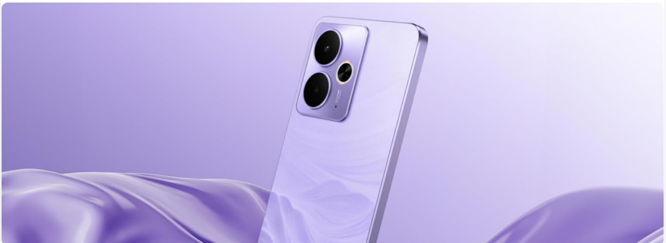
Flagship AI 50MP Imaging

Image: Front and back view of the realme 14T 5G smartphone in Obsidian Black.