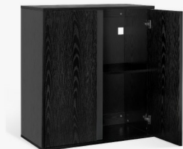
Figure 2: Product dimensions and weight capacities for a single KISLOT Sideboard Buffet Cabinet.

NOTICE There may be slight color difference between different electronic displays