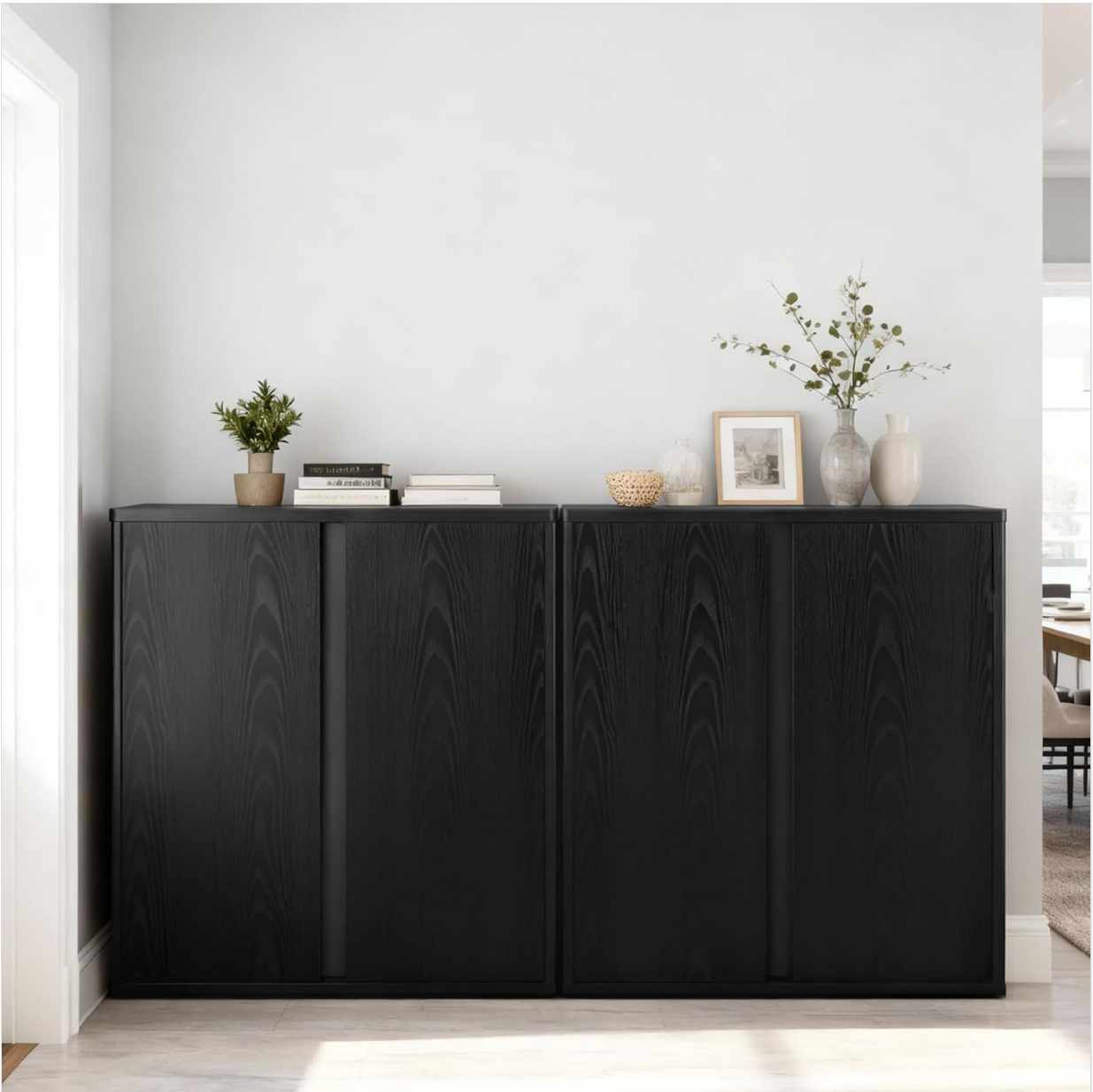
Figure 5: Two KISLOT 31.5-inch units combined to form a 63-inch modular sideboard.