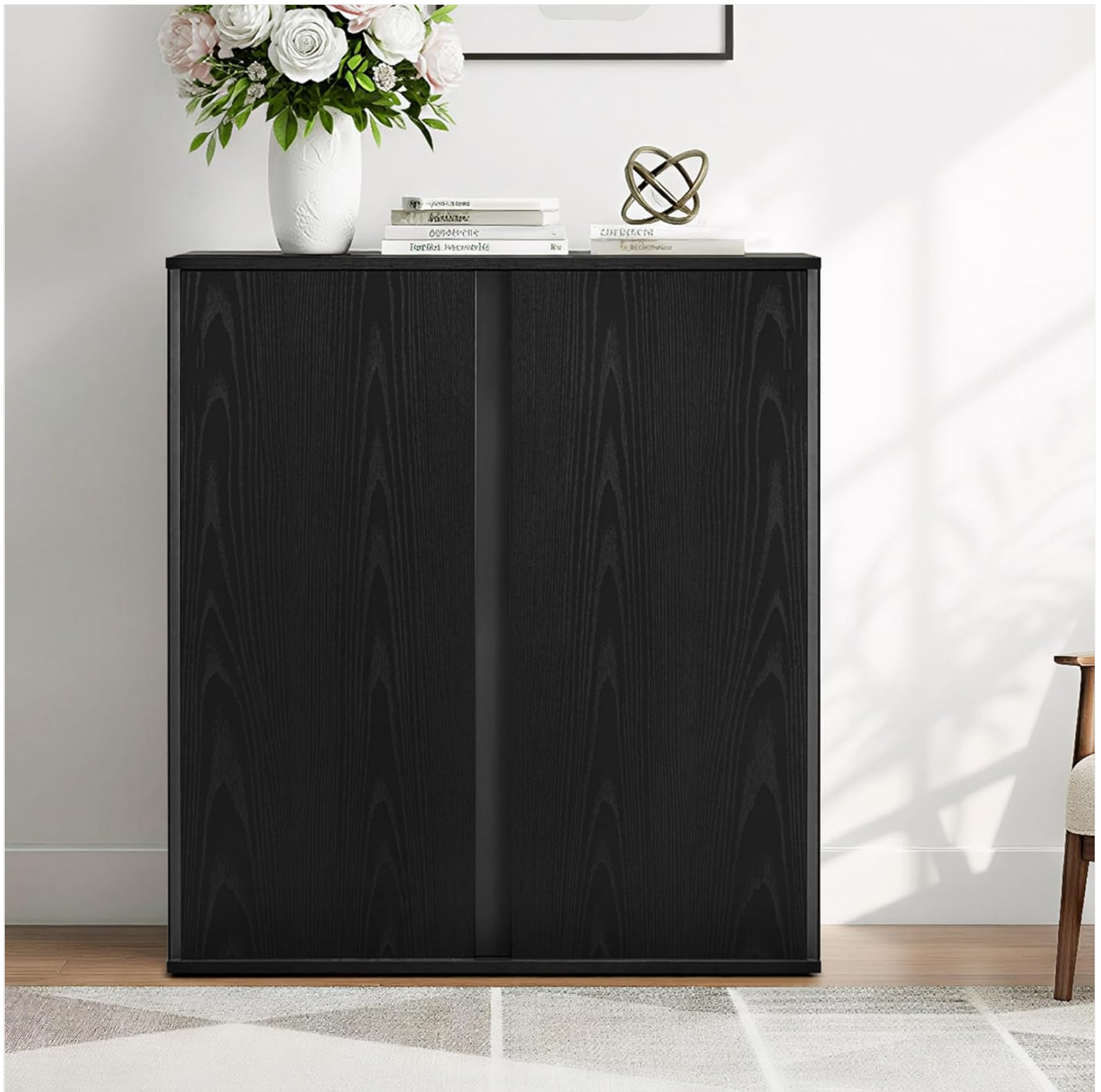
Figure 1: KISLOT 31.5" Sideboard Buffet Cabinet (Black)