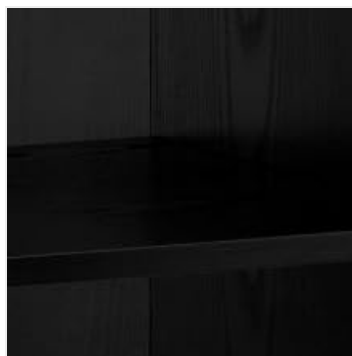
Figure 3: Cable Management Holes