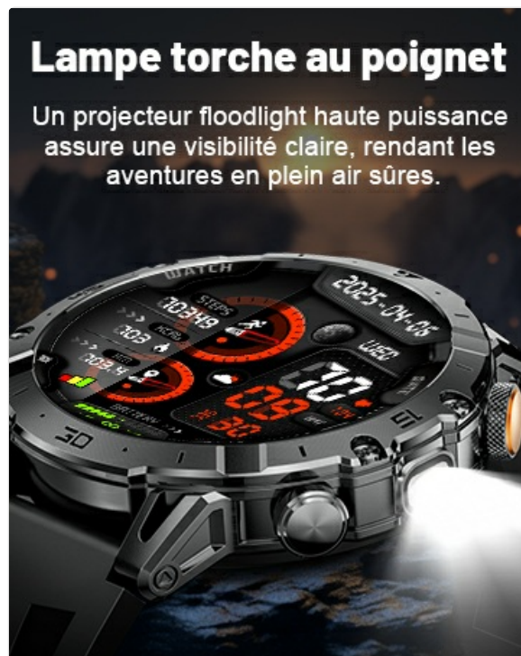
Image: A close-up of the smartwatch with its integrated LED flashlight activated, illuminating the surrounding area.

The smartwatch includes a powerful LED flashlight with three modes: strong light, flashing, and SOS. This feature is useful for outdoor activities or emergencies.