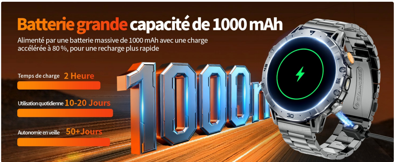
Image: The smartwatch with a prominent "1000mAh" graphic, emphasizing its large battery capacity and showing charging time and usage duration comparisons.

The package includes both a USB and a Type-C charging cable for flexible charging options.