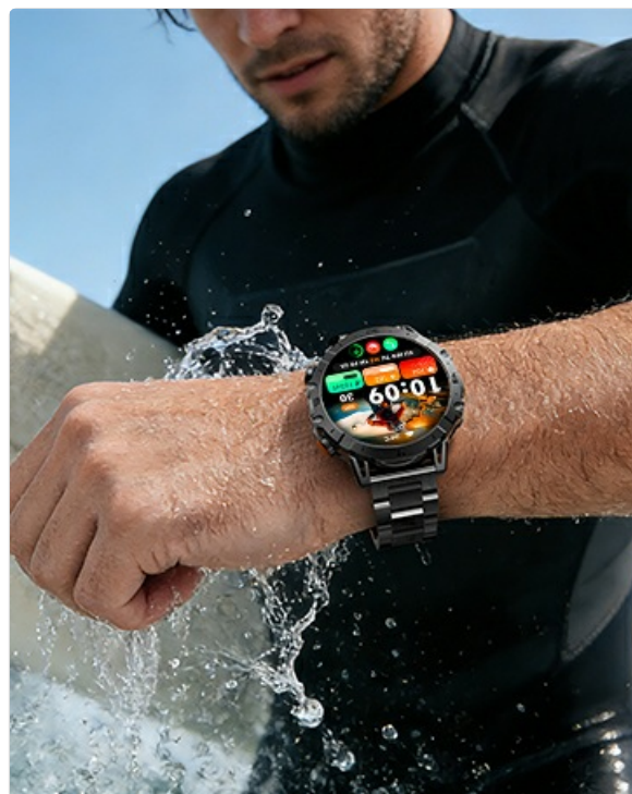
Image: A close-up of the smartwatch on a wrist, being splashed with water, illustrating its water-resistant capability.

The LIGE EF18-A smartwatch has an IP68 water resistance rating, making it suitable for daily use, including washing hands, rain, and swimming in shallow water (up to 1.5 meters). It is not recommended for hot showers, saunas, or diving.