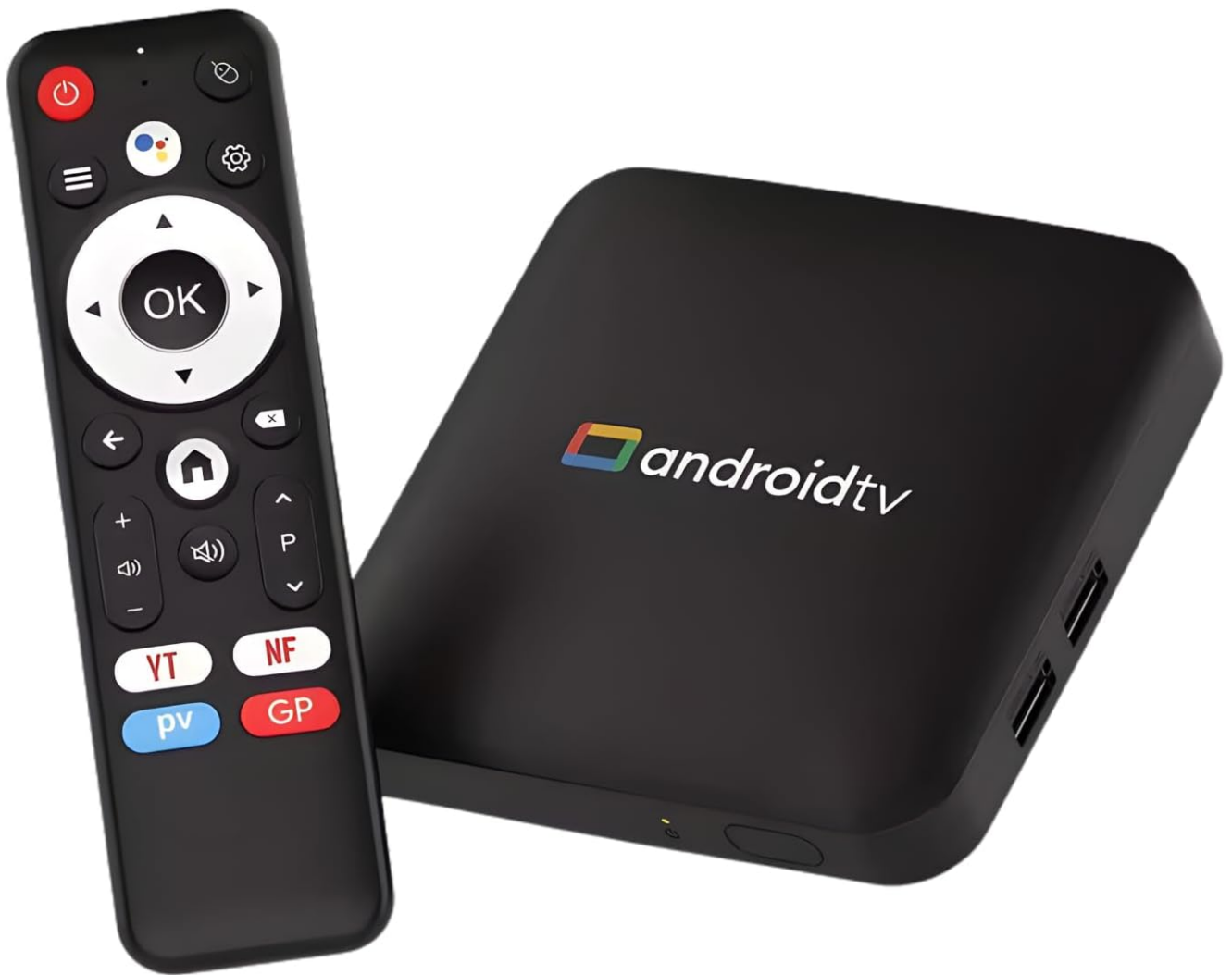
Image: The H96 MAX S905L3 Android 14.0 TV Box and its accompanying remote control, showcasing the device's compact form factor.