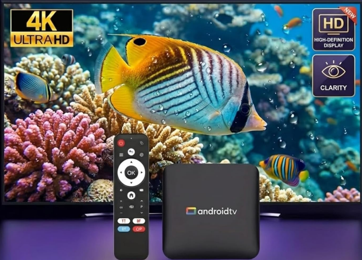
Image: A television screen showcasing vibrant 4K Ultra HD content, emphasizing high-definition clarity, with the H96 MAX TV box and remote control positioned below.

Dive into a world of crystal-clear 4K resolution, where every pixel is rendered with stunning clarity and realism.