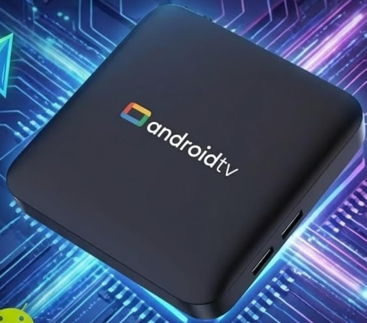
Image: Visual representation of the Android 14.0 operating system's superior performance, voice search capability, and content universe, with the TV box in the foreground.