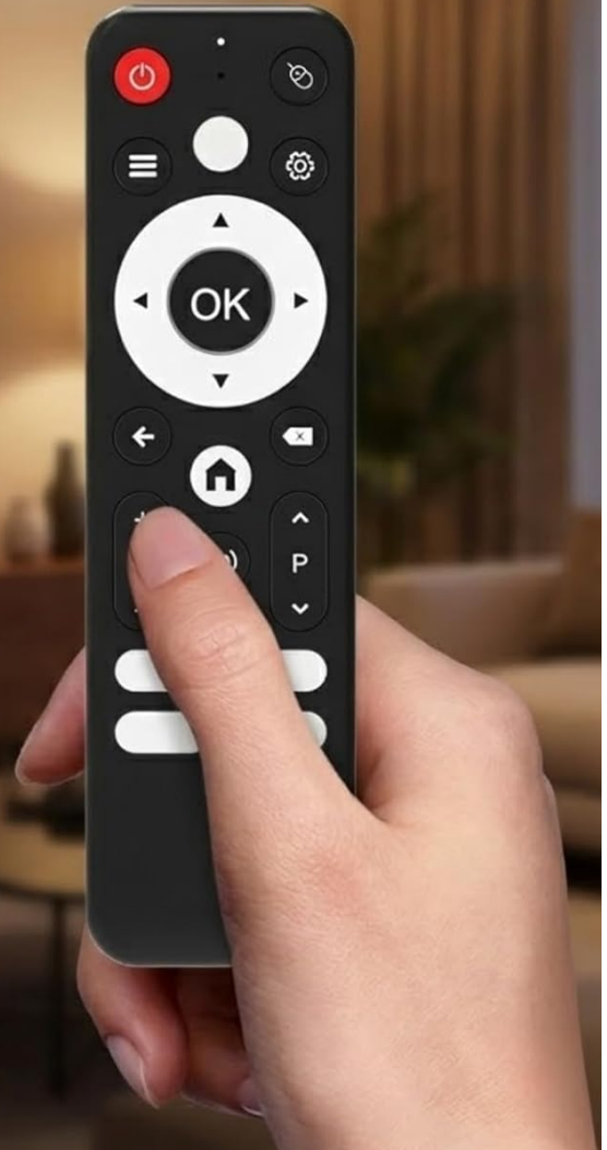
Image: A hand holding the remote control, demonstrating the smart voice control feature with a visual representation of sound waves on a television screen in the background.

Simply speak to search, play, and control your entertainment. Experience natural, hands-free interaction.