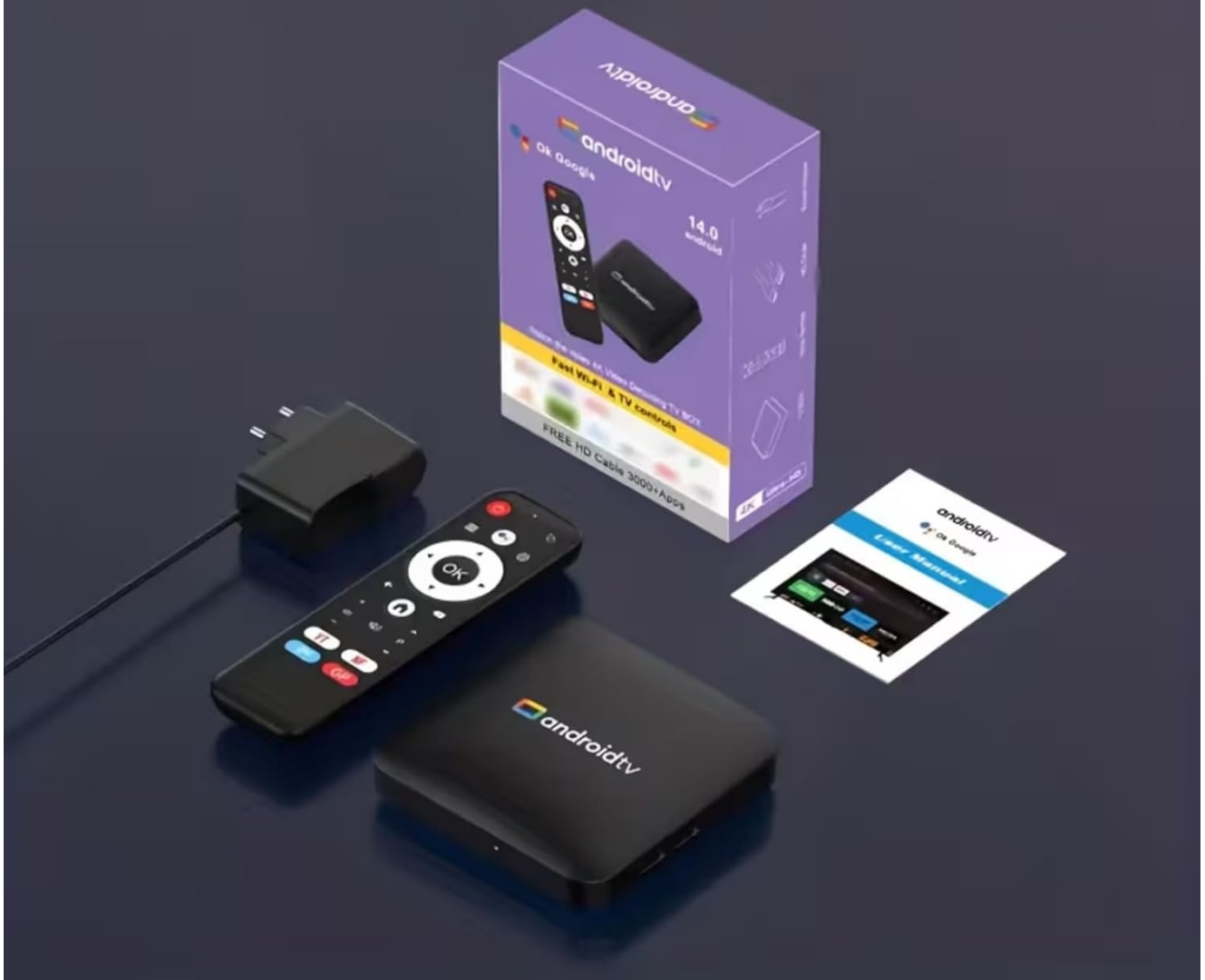
Image: The H96 MAX S905L3 Android 14.0 TV Box, remote control, power adapter, HDMI cable, and user manual as included in the package.