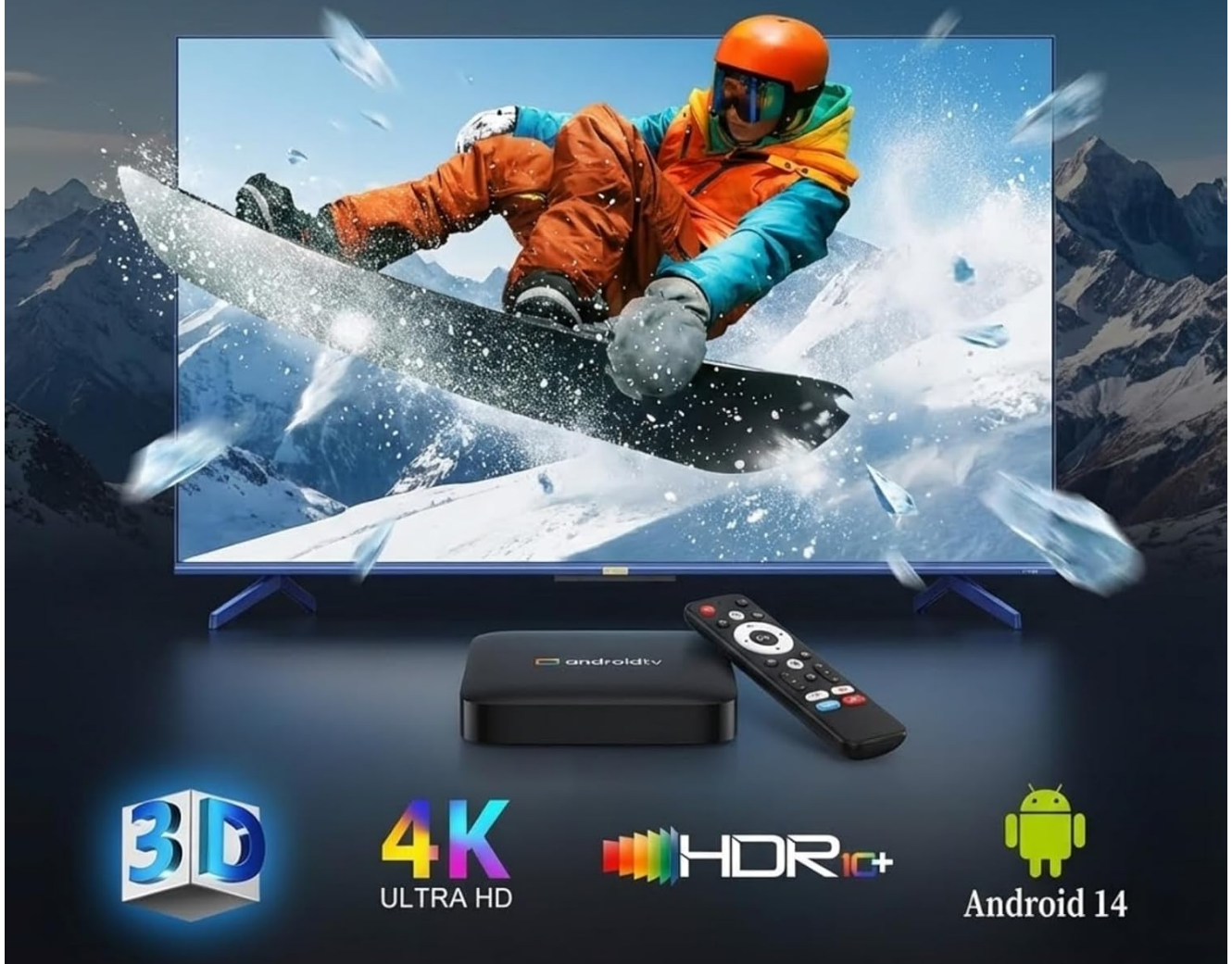
Image: A television screen displaying immersive 3D visuals, highlighting 4K Ultra HD and HDR10+ support, with the H96 MAX TV box and remote control in the foreground.