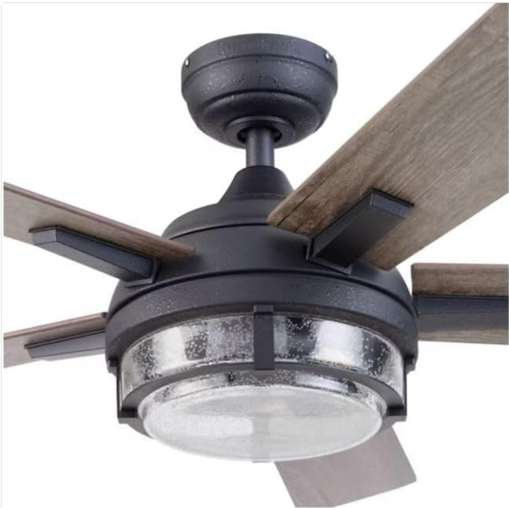
Figure 4.2: Detail of the light kit and blade attachment point.