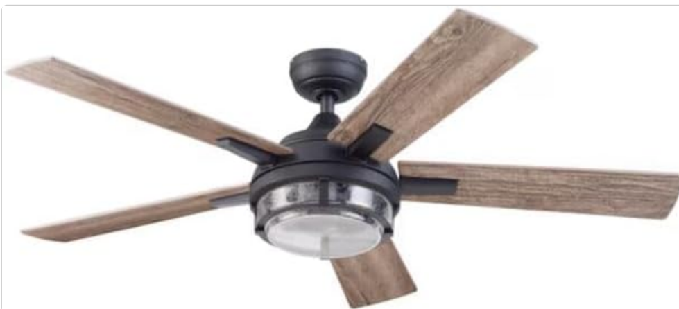
Figure 3.1: Main components of the ceiling fan, showing the textured black motor housing and one side of the reversible blades.