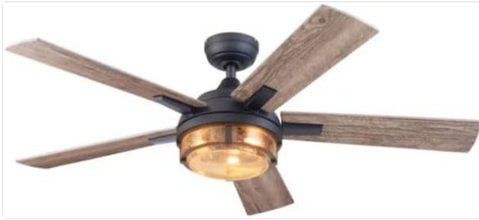
Figure 5.1: Ceiling fan with the integrated light illuminated.