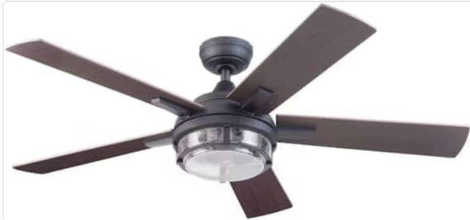
Figure 5.2: Fan showcasing the auburn finish of the reversible blades.