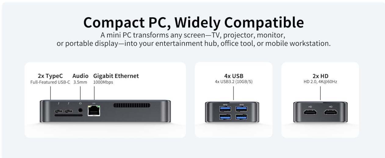
Figure 3.1: Key Features of DreamQuest Mini PC N95

This image highlights the core specifications and capabilities of the DreamQuest Mini PC N95, including its operating system, processor, memory, storage, and display support.