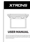
1 x User Manual