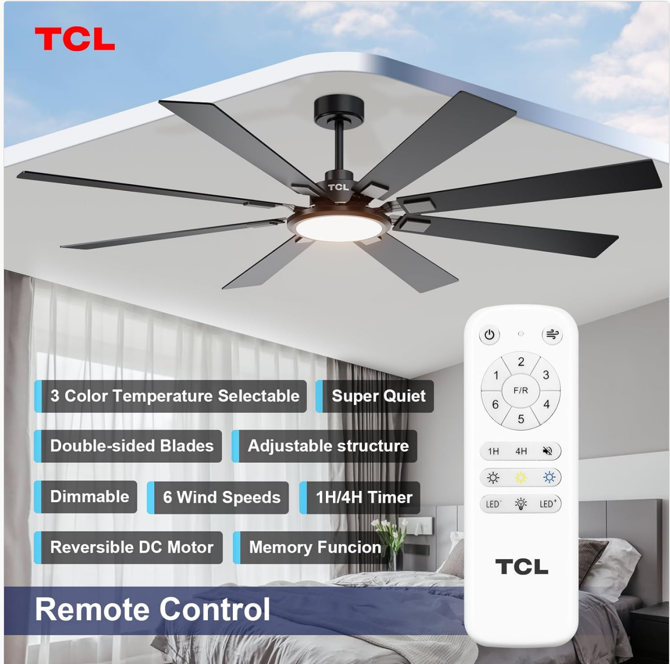
Figure 3: Remote Control Layout.