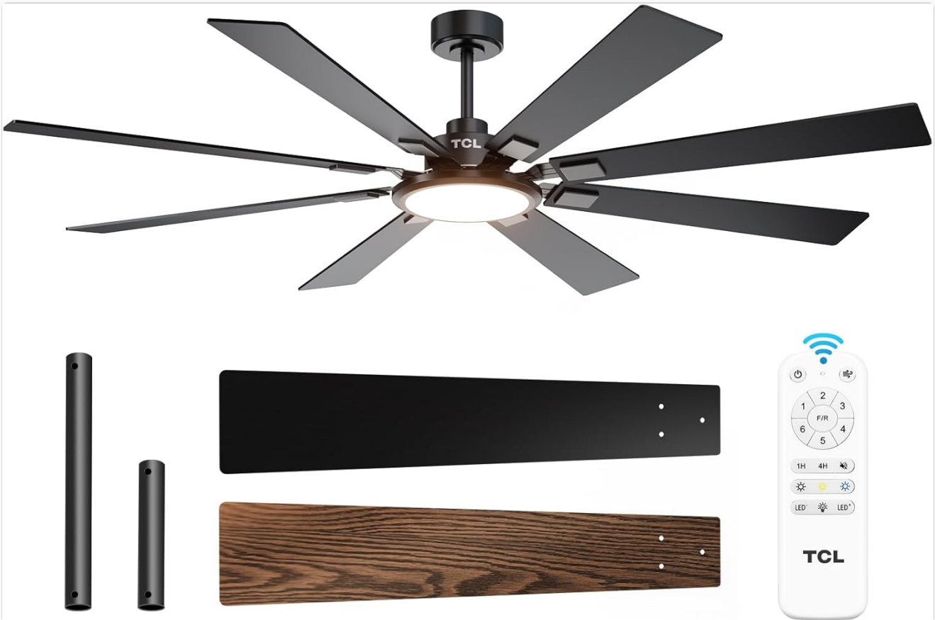
Figure 2: Included Components.