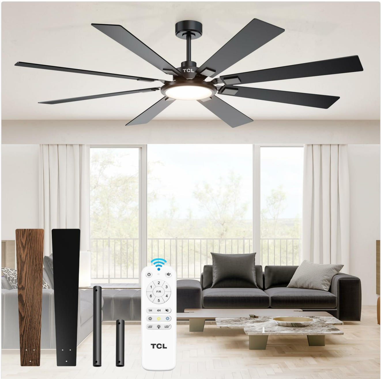
Figure 1: TCL 72-Inch 8-Blade Ceiling Fan with Light and Remote.