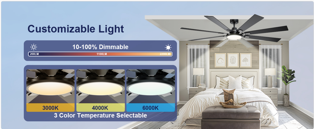
Figure 4: Customizable Light Settings.

Warm White, 4000K Natural White, 6500K Cool White).