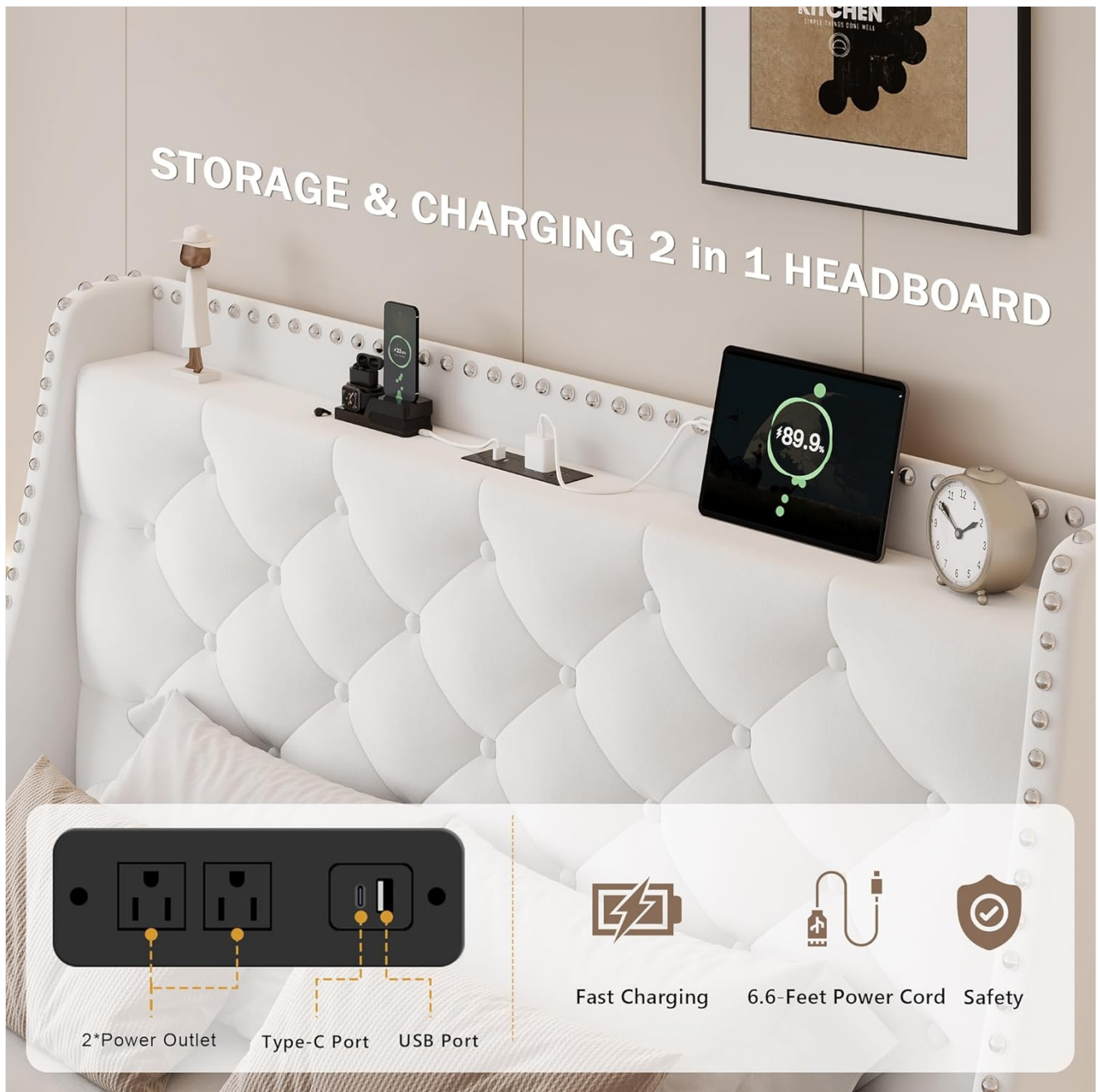
Image: A detailed view of the headboard's 4-inch wide storage shelf, showcasing the integrated power outlets, USB, and Type-C charging ports.