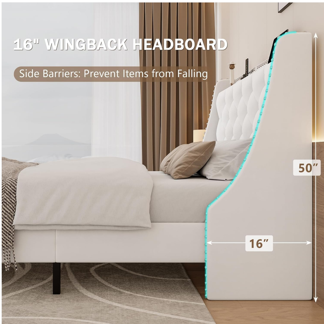
Image: A side profile of the bed, highlighting the 16-inch depth of the wingback headboard and its side barriers designed to prevent items from falling.

Side Barriers: Prevent Items from Falling