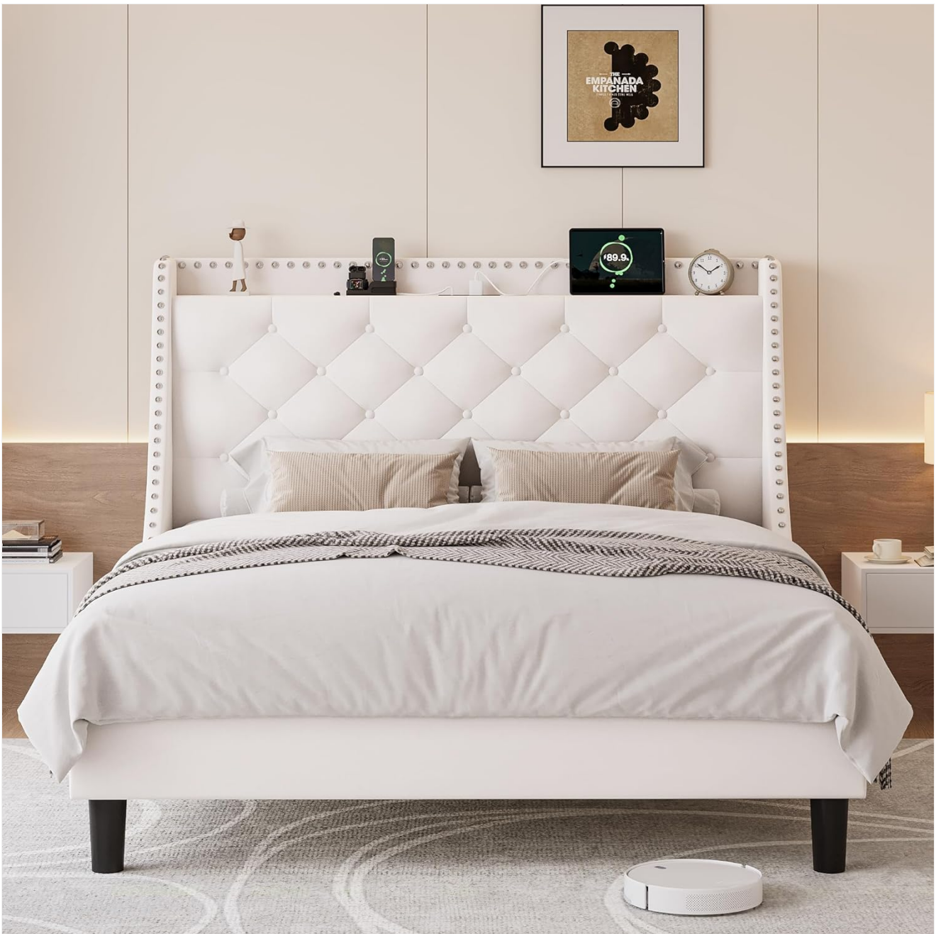
Image: The GalnFu Queen Bed Frame, fully assembled, featuring the wingback headboard with charging station and under-bed clearance.