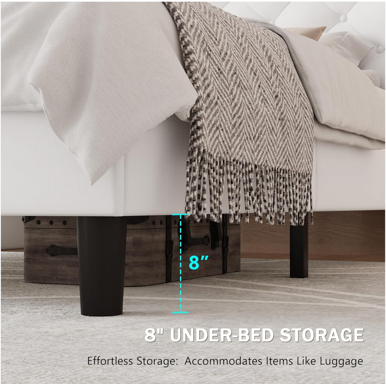
Image: An illustration of the 8-inch under-bed storage clearance, demonstrating how it can accommodate items like luggage or storage bins.