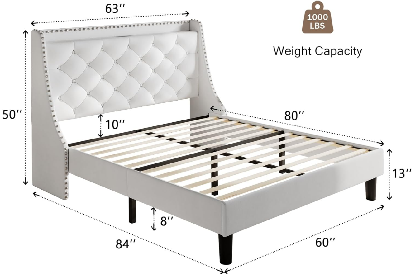
Image: An exploded diagram of the Queen bed frame, highlighting its dimensions and the placement of the headboard, frame, and slats.