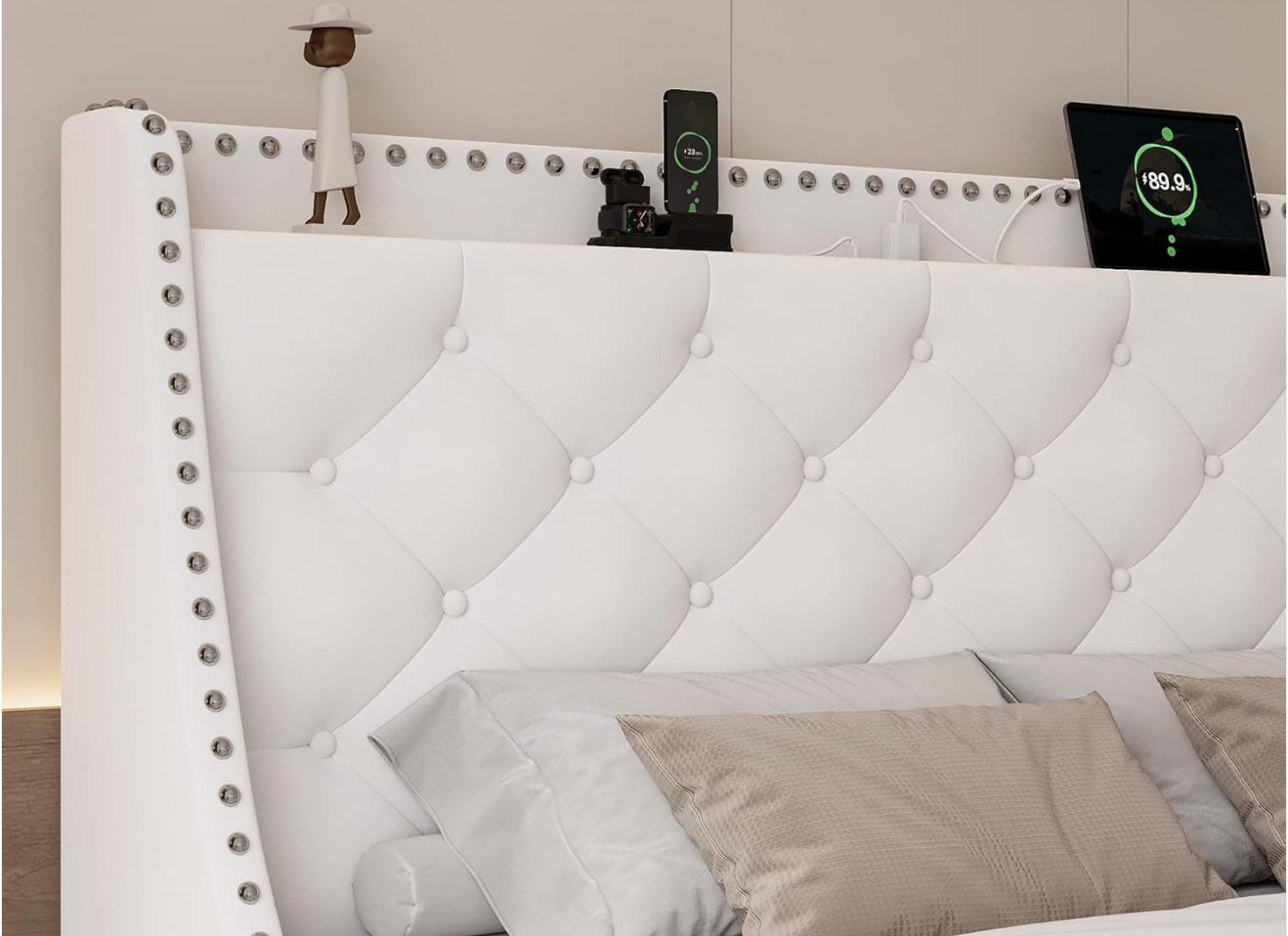
Image: A detailed view of the headboard's construction, emphasizing the use of top-quality linen, high resilience foam, and breathable fabric for comfort and durability.