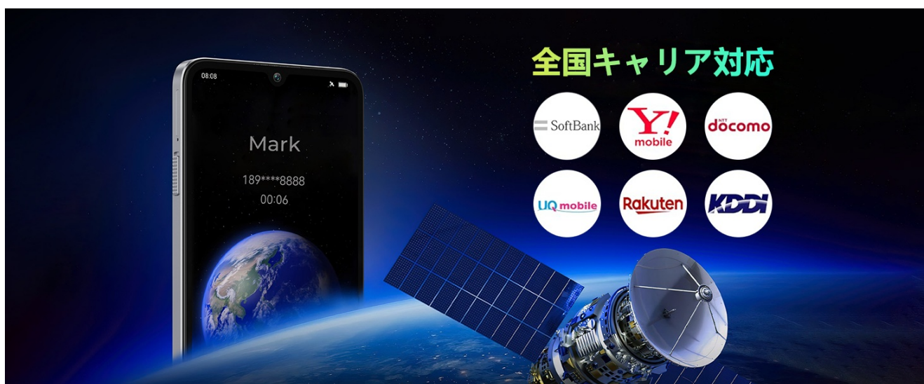
Overview of the OUKITEL C59's main features.

Thank you for choosing the OUKITEL C59 SIM-Free Smartphone. This manual provides essential information for setting up, operating, maintaining, and troubleshooting your device. Please read it carefully to ensure optimal performance and longevity of your smartphone.