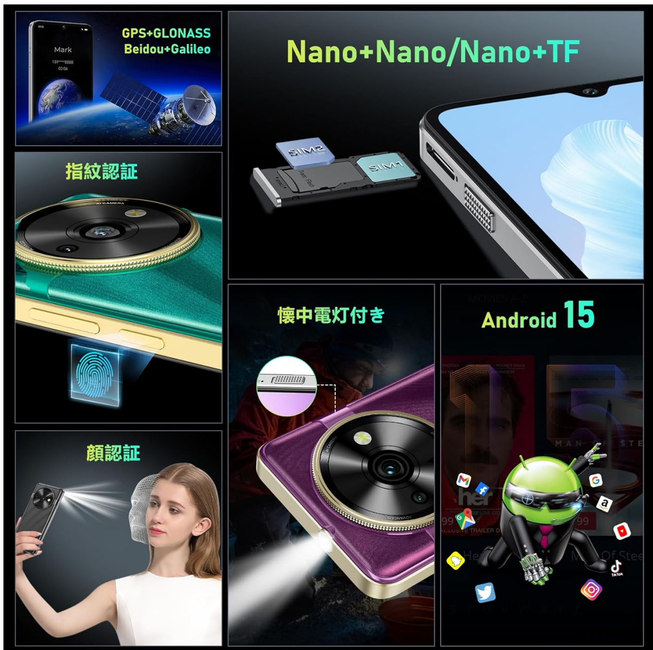
Illustration of SIM card insertion, GPS functionality, fingerprint sensor, and face unlock.