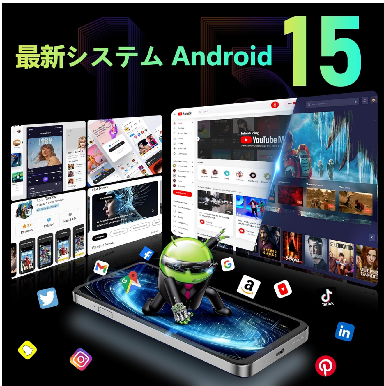
The OUKITEL C59 runs on the latest Android 15 operating system.