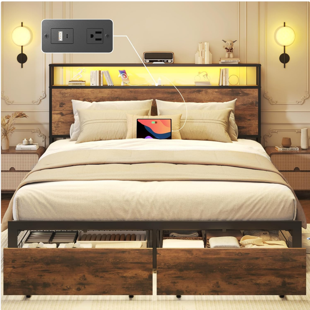
Figure 1.1: Overview of the Lifezone Queen Bed Frame.