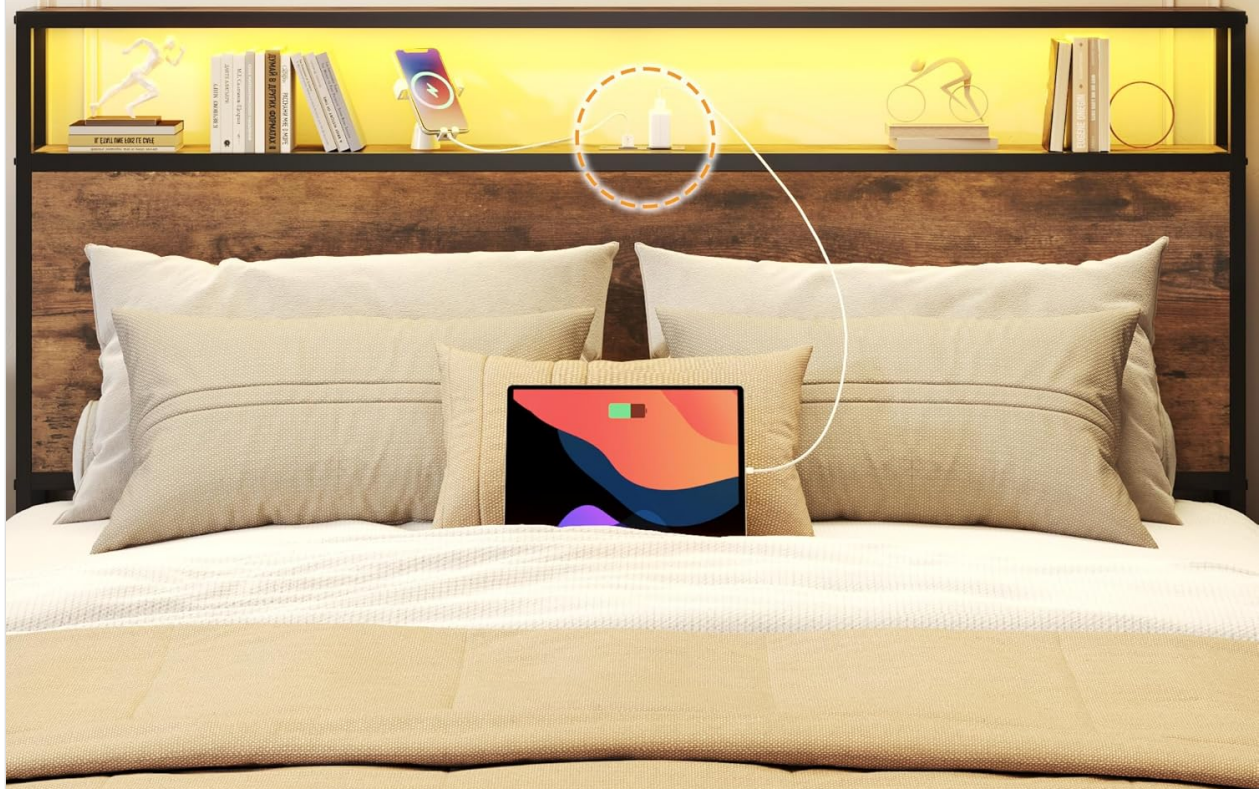
Figure 5.1: The integrated charging station provides easy access to power outlets and USB ports.