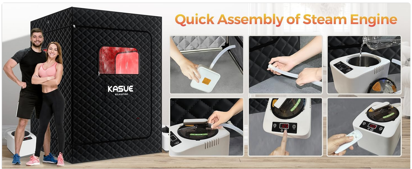
Image: Detailed steps for connecting the steam generators, filling them with water, and operating the control panel or remote control for the KASUE sauna.