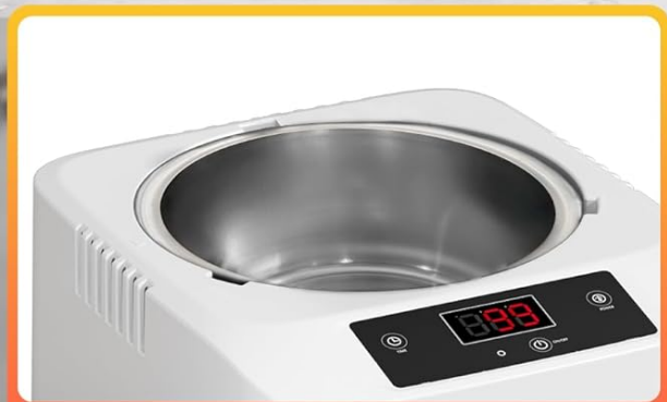
Stainless Steel Material

Image: KASUE Multifunctional Steam Engine, showing dual steam generators, remote control, and the stainless steel interior. It also illustrates various natural additives that can be used with the steam.