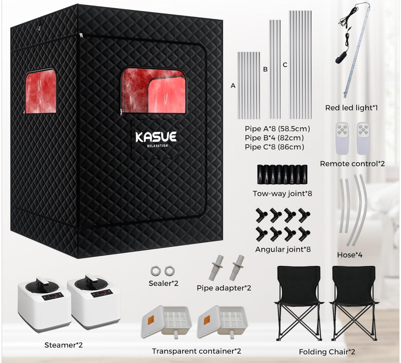
Image: All components included with the KASUE Portable Steam Sauna Box, laid out for inspection. This includes the sauna tent, various pipes for the frame, a red LED light strip, two remote controls, several types of connectors (tow-way and angular joints), hoses, two sealers, two pipe adapters, two transparent containers, and two folding chairs.