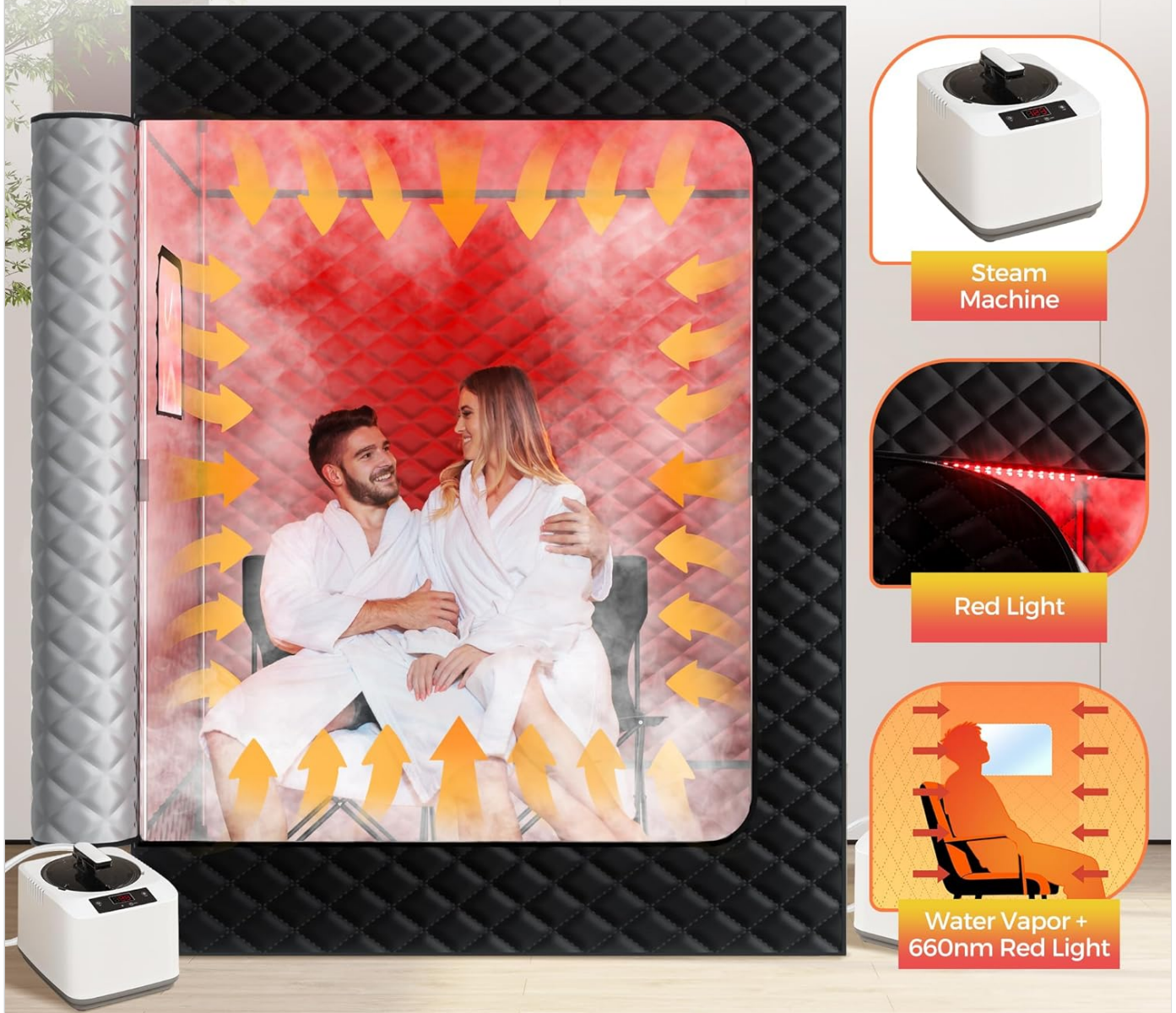
Image: The KASUE sauna box in use, demonstrating its rapid heating and ability to maintain warmth with both steam and red light for a relaxing experience.

Steam + Red Light, Let You Enjoy Every Minute