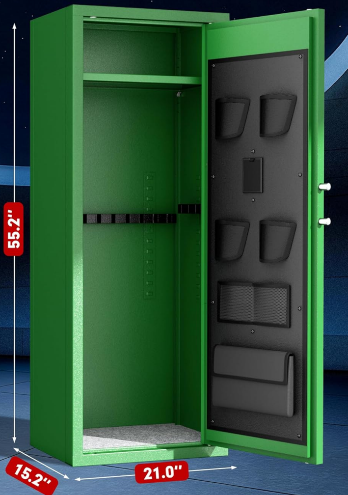
Image: Superday 10-15 Gun Safe dimensions and included accessories. This image illustrates the external dimensions of the safe (55.2"H x 21.0"W x 15.2"D) and highlights included components such as 1x Gray Carpet, 4x Anchor Bolts, and 2x Emergency Keys.

Video: This video provides detailed instructions for the assembly of the Superday 10-15 Gun Safe, including step-by-step guidance for putting together the main components.