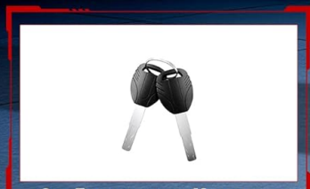
2 x Emergency Keys