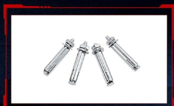
4 x Anchor Bolts