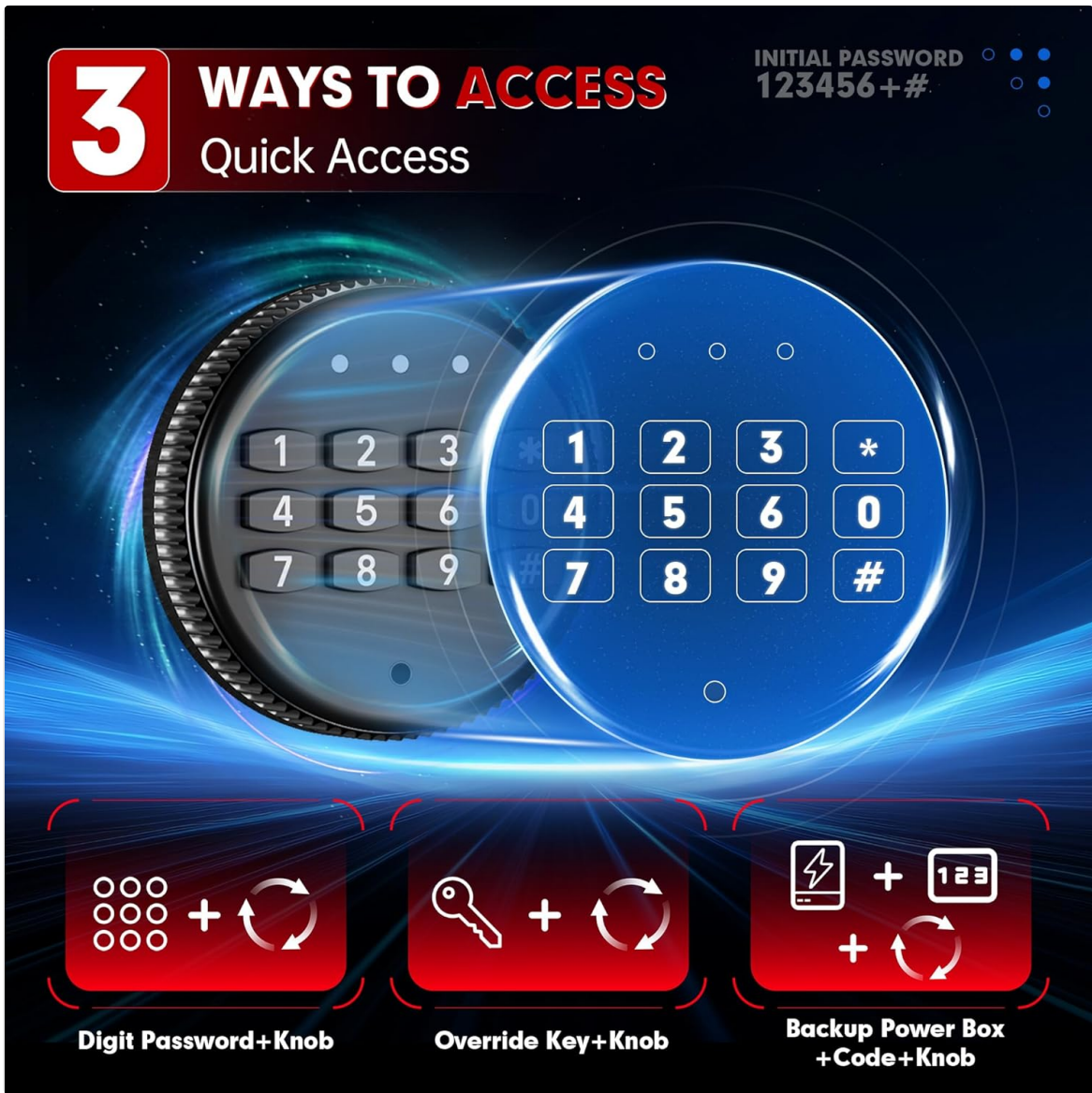
Image: Three ways to access the Superday 10-15 Gun Safe: digital password, override key, and backup power box with code. This graphic illustrates the keypad for digital password entry, the keyhole for manual override, and the external battery port for emergency power.

Video: This video demonstrates the process of setting and changing the digital password for your Superday 10-15 Gun Safe's electronic lock.