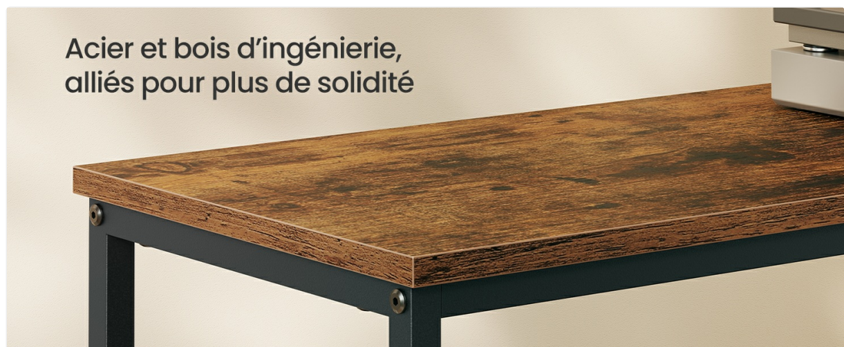
Figure 9: Material Combination. The dresser is constructed from durable steel and engineered wood.