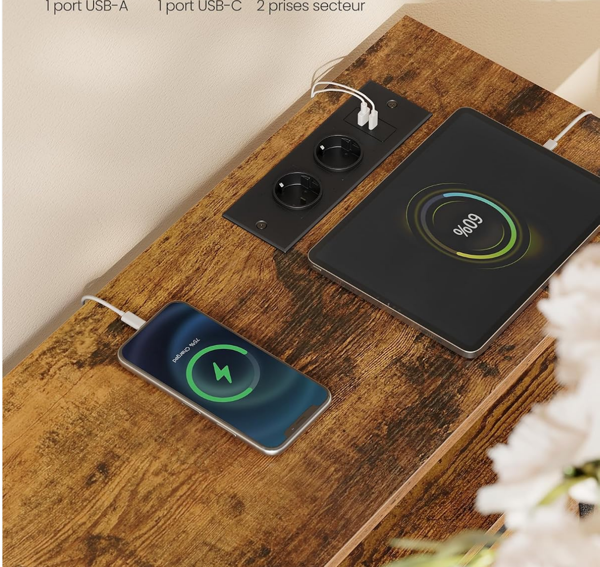
Figure 5: Integrated Power Strip. Conveniently charge and power devices with 2 AC outlets, 1 USB-A, and 1 USB-C port.