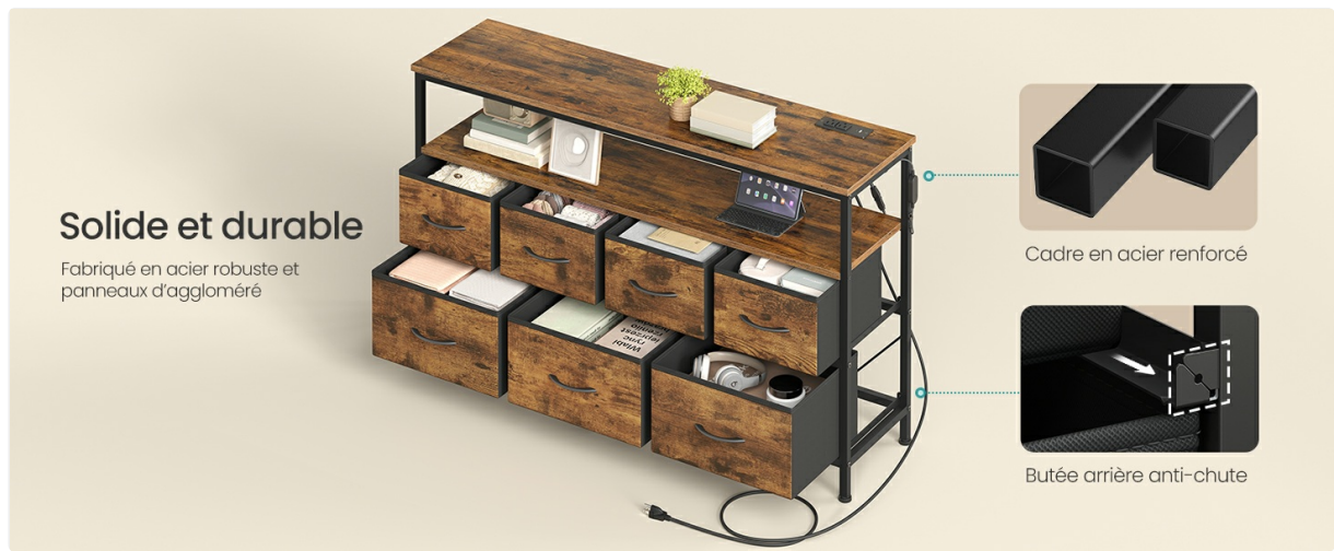
Figure 2: Stability Features. The dresser features a reinforced steel frame and an anti-tipping device for secure installation.