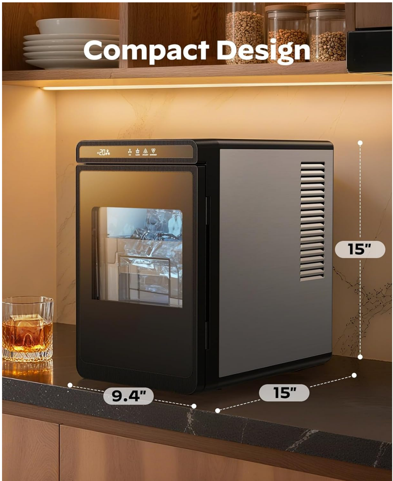
Image: The compact design of the Silonn ice maker, showing its dimensions (15"D x 9.4"W x 15"H).