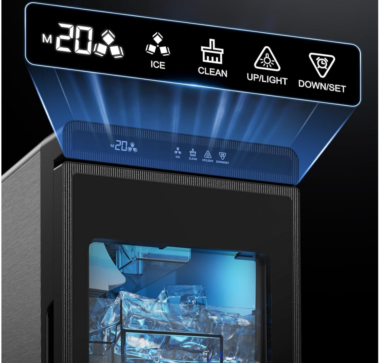
Image: The LED touch control panel for easy operation and monitoring.