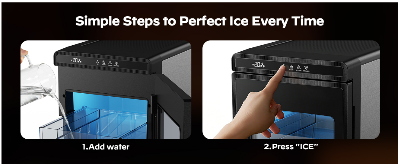
Image: Simple steps to add water to the ice maker before operation.