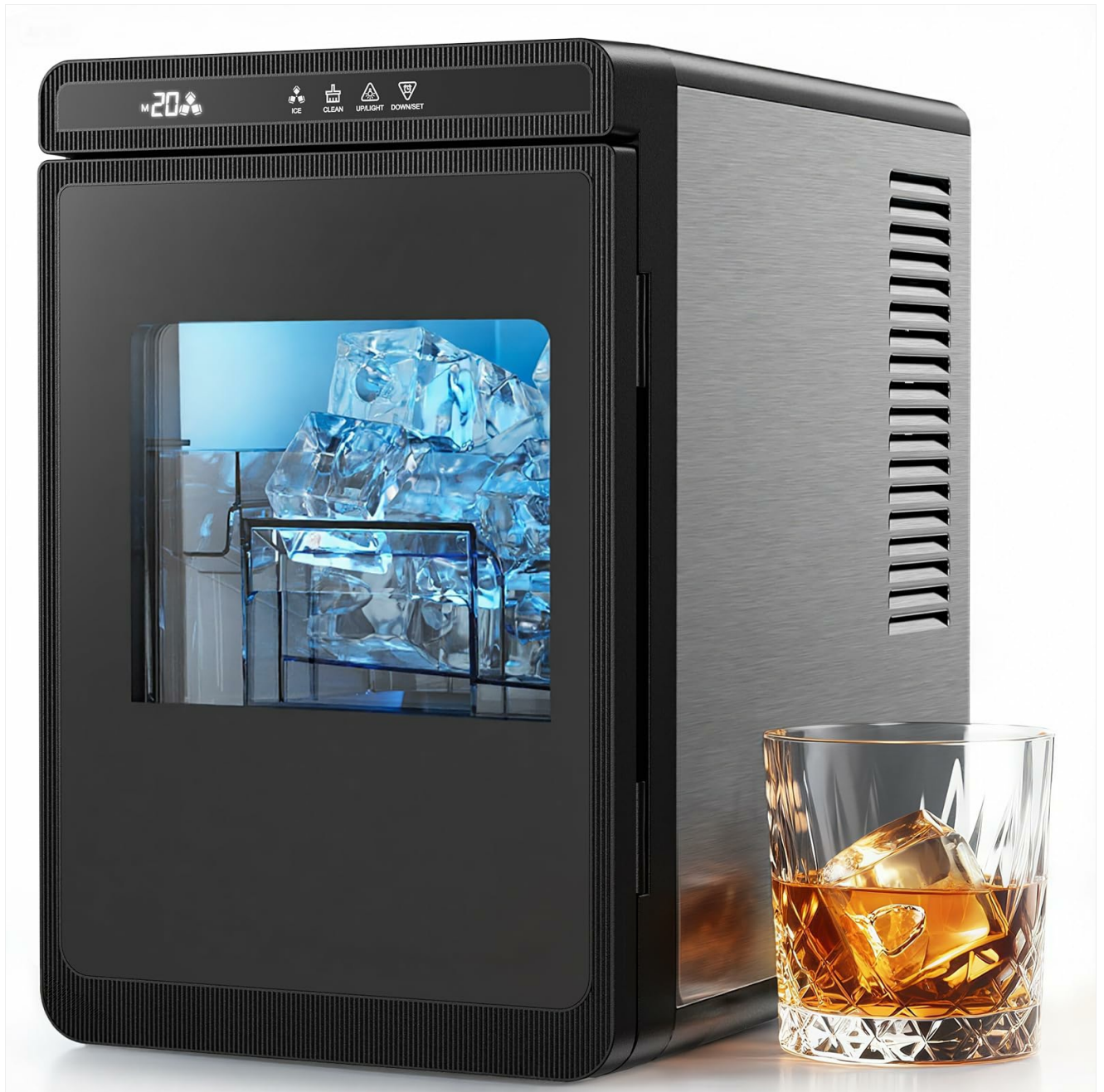
Image: The Silonn Clear Ice Cube Maker Countertop, showcasing its sleek design.