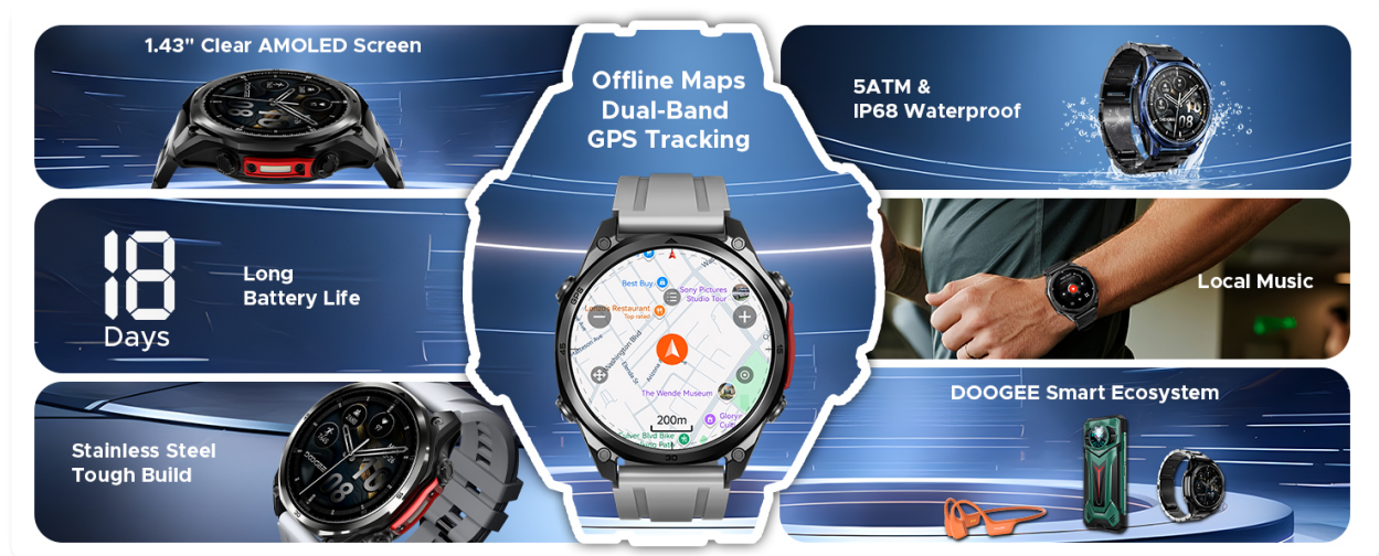
Figure 3: The vibrant 1.43" AMOLED display.

The DOOGEE Anywise W1 Pro features a 1.43-inch AMOLED high-definition touch screen for clear visibility. Navigate through menus by swiping left, right, up, or down. The physical buttons on the side provide quick access to functions and can be used for navigation, especially when wearing gloves.