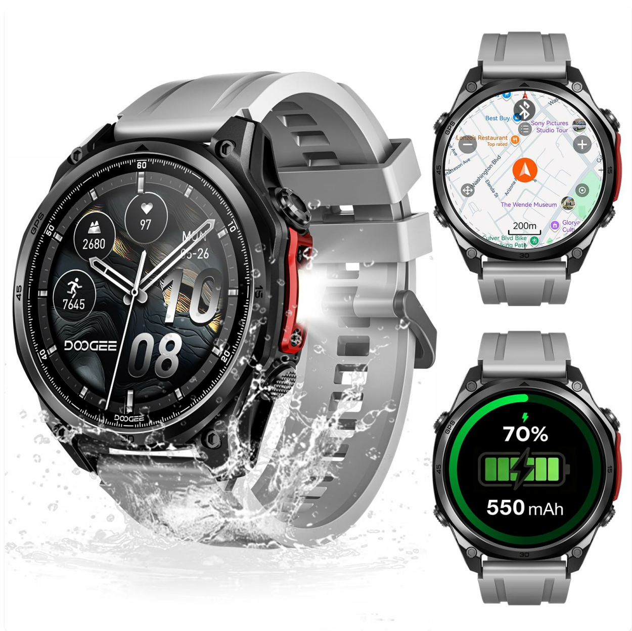
Figure 1: DOOGEE Anywise W1 Pro Smart Watch overview.