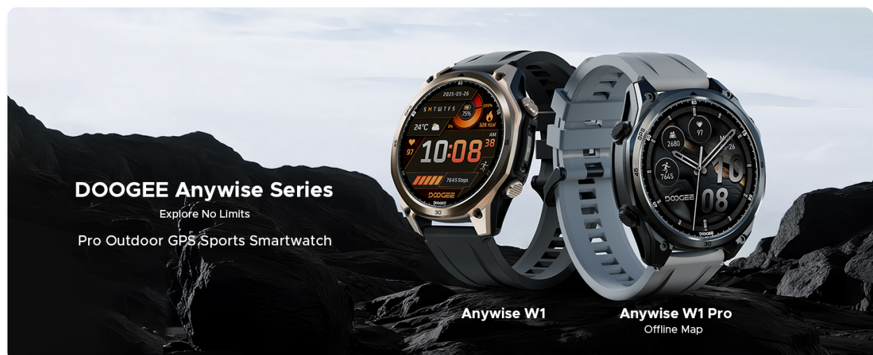
Figure 4: Dual-Band GPS and Offline Map functionality.

The smartwatch is equipped with built-in Dual-Band GPS (L1+L5) and supports six satellite systems (GPS, GLONASS, Beidou, Galileo, QZSS, AGPS) for fast and accurate location tracking. It also supports pre-loaded offline maps, ensuring you stay on track even without network connectivity. A built-in compass, altimeter, and barometer provide real-time environmental data.