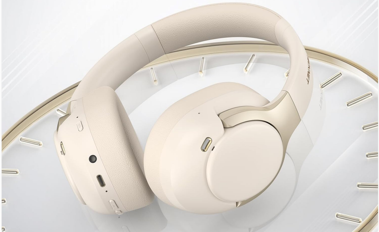
Image: Hybrid Active Noise Cancellation in action.