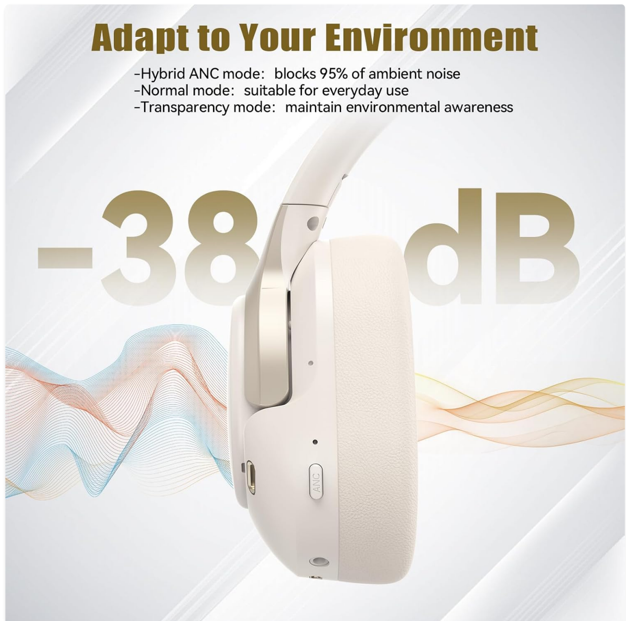
Image: Side view of the headphones highlighting control buttons and ports.

Familiarize yourself with the various components and controls of your TECKNET TK-HS049 headphones.