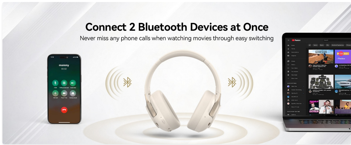
Image: Dual device connection setup.