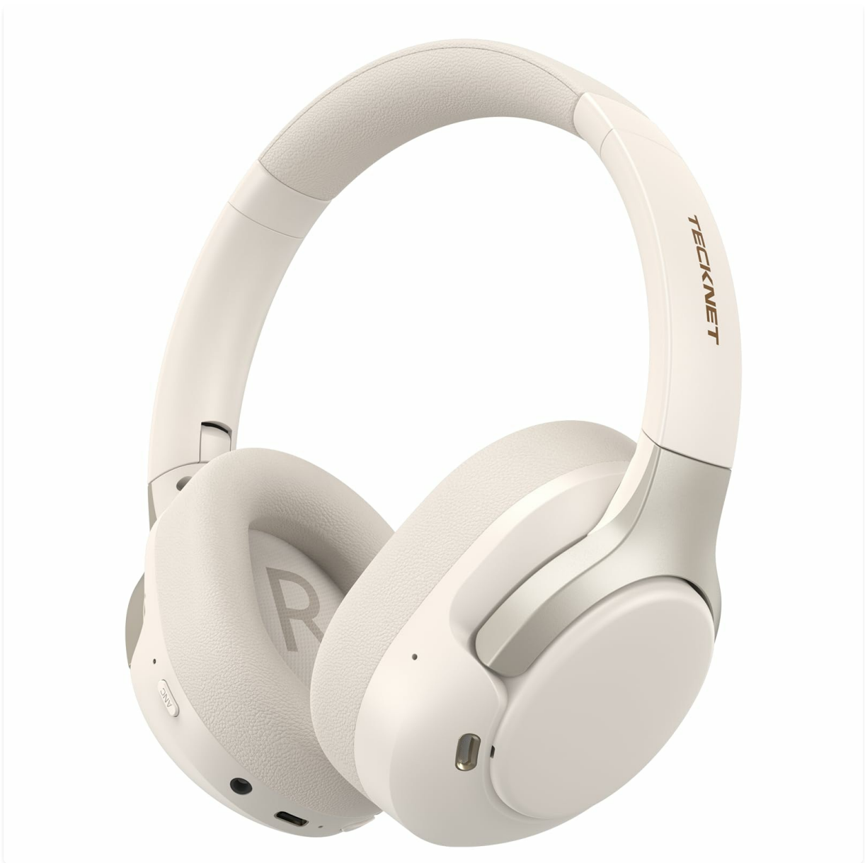
Image: TECKNET TK-HS049 Hybrid Active Noise Cancelling Headphones.