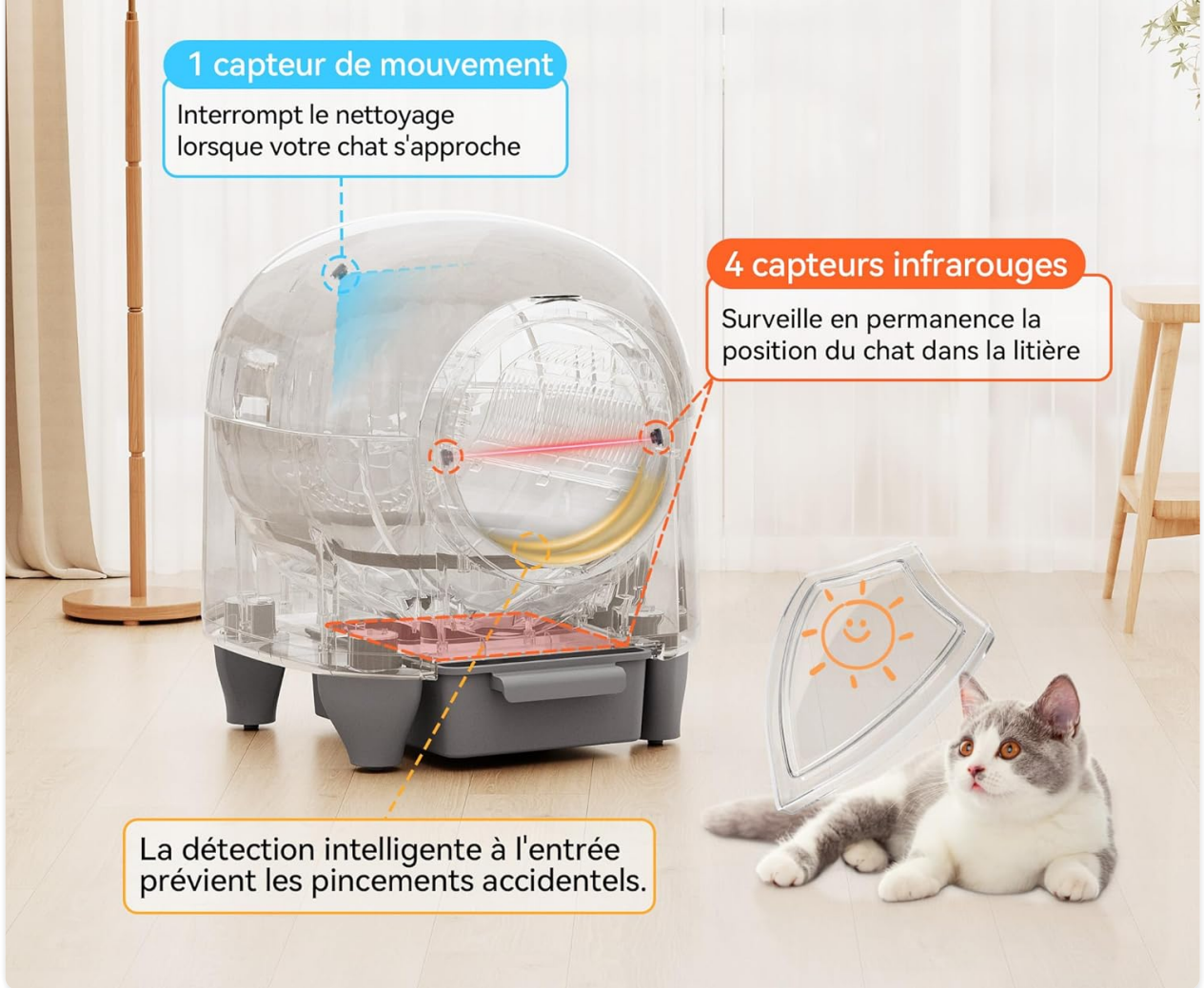
Image: A diagram illustrating the placement and function of the 9 intelligent sensors for enhanced safety.

Sécurité optimale pour votre chat - arrêt automatique pendant utilisation, aucun risque de coincement