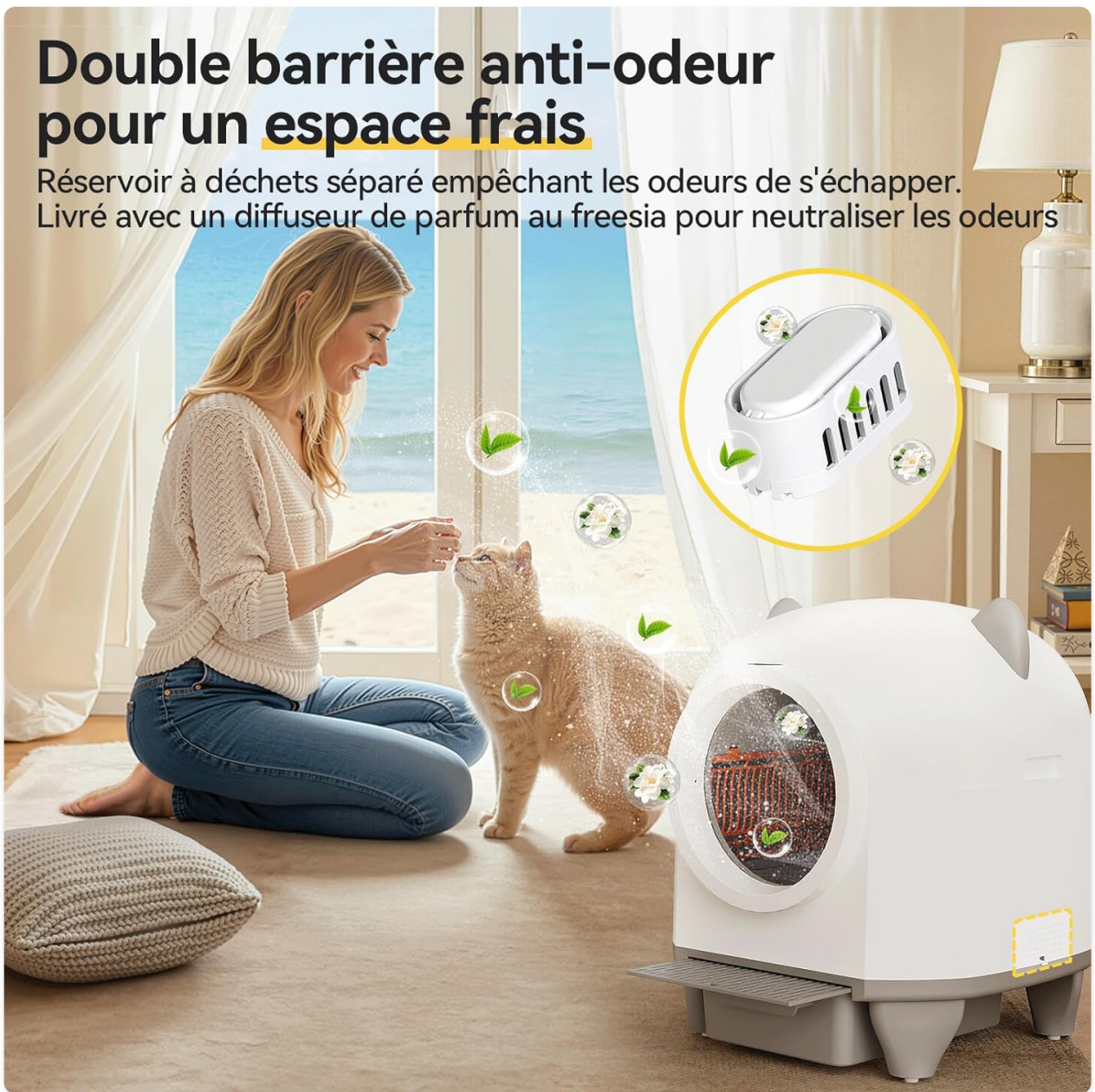
Image: Visual representation of the odor control system, highlighting the sealed waste bin and scent filter.

Réservoir à déchets séparé empêchant les odeurs de s'échapper. Livré avec un diffuseur de parfum au freesia pour neutraliser les odeurs