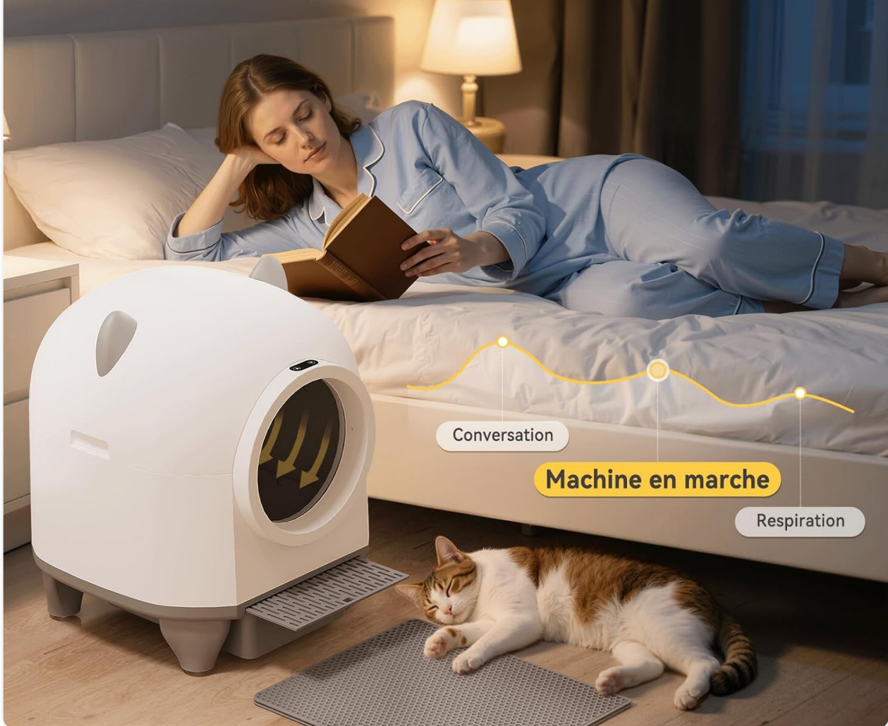
Image: A cat sleeping peacefully next to the litter box, illustrating its ultra-silent operation.

Gardien de bons rêves pour vous et votre chat