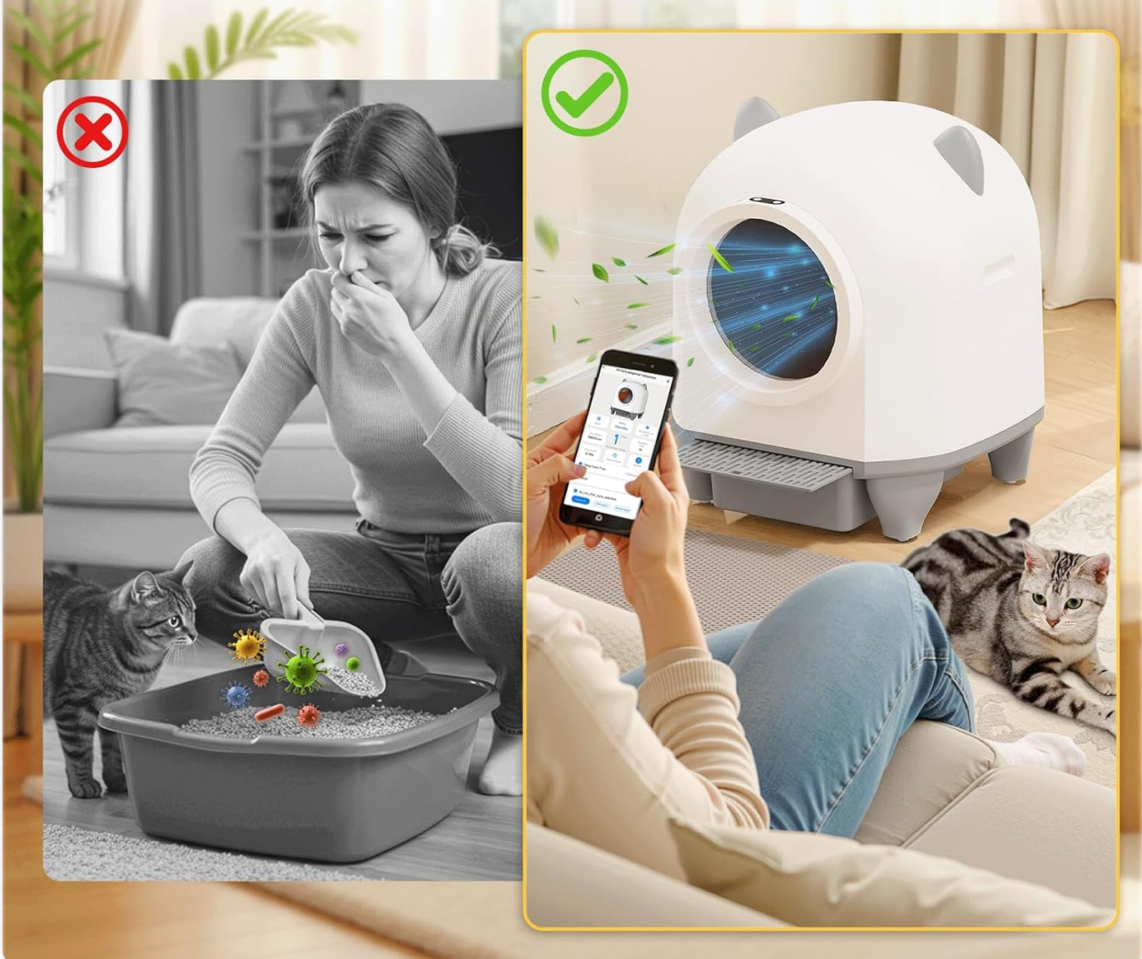
Image: The automatic cleaning mechanism sifting litter, ensuring a clean surface after each use.

Le ramassage des déchets s'effectue d'un simple geste sur l'écran tactile ou depuis votre téléphone