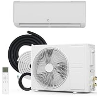
Image: All components included with the GarveeTech Mini Split AC/Heating System.