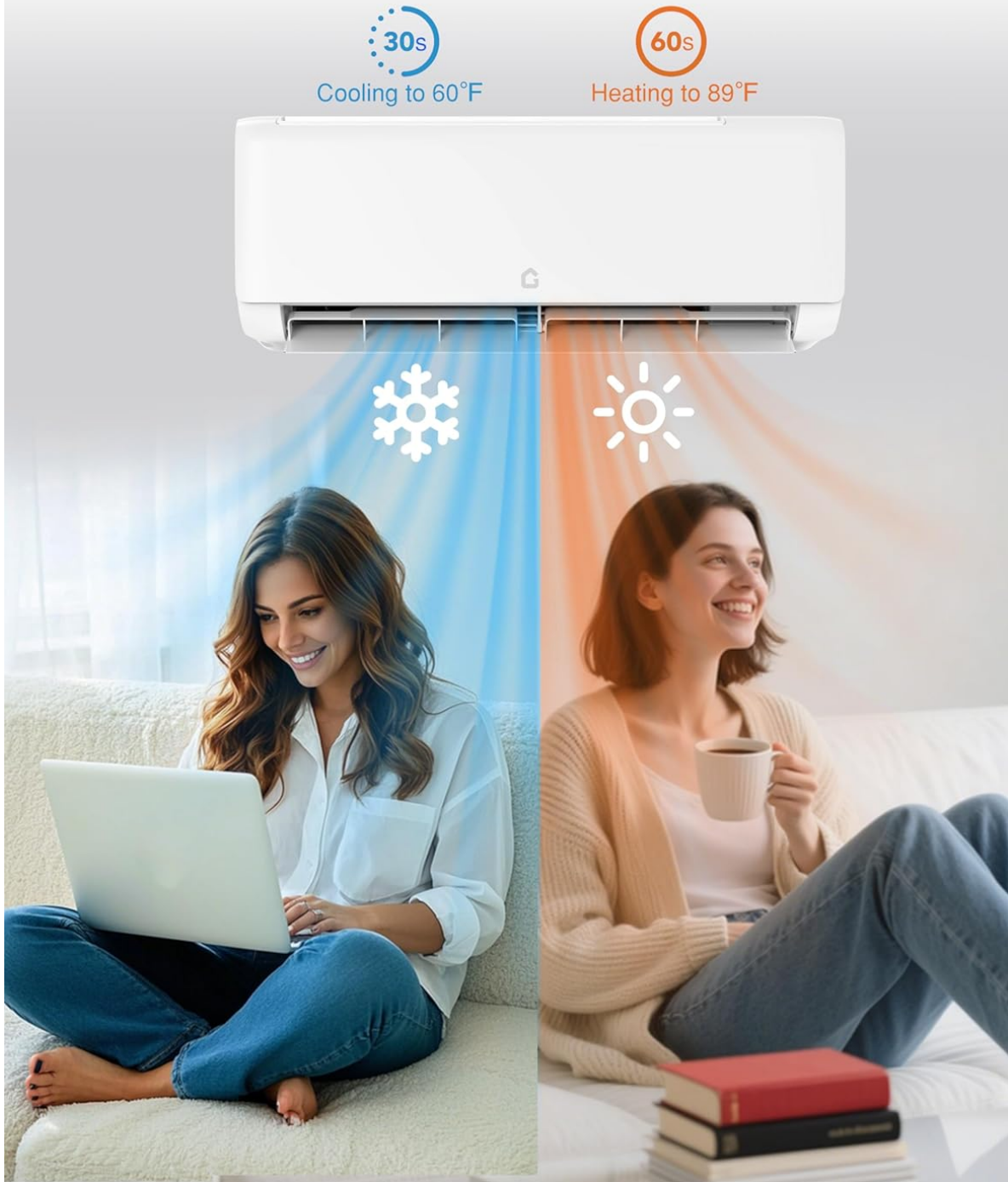
Image: The indoor unit demonstrating rapid cooling and heating functions.