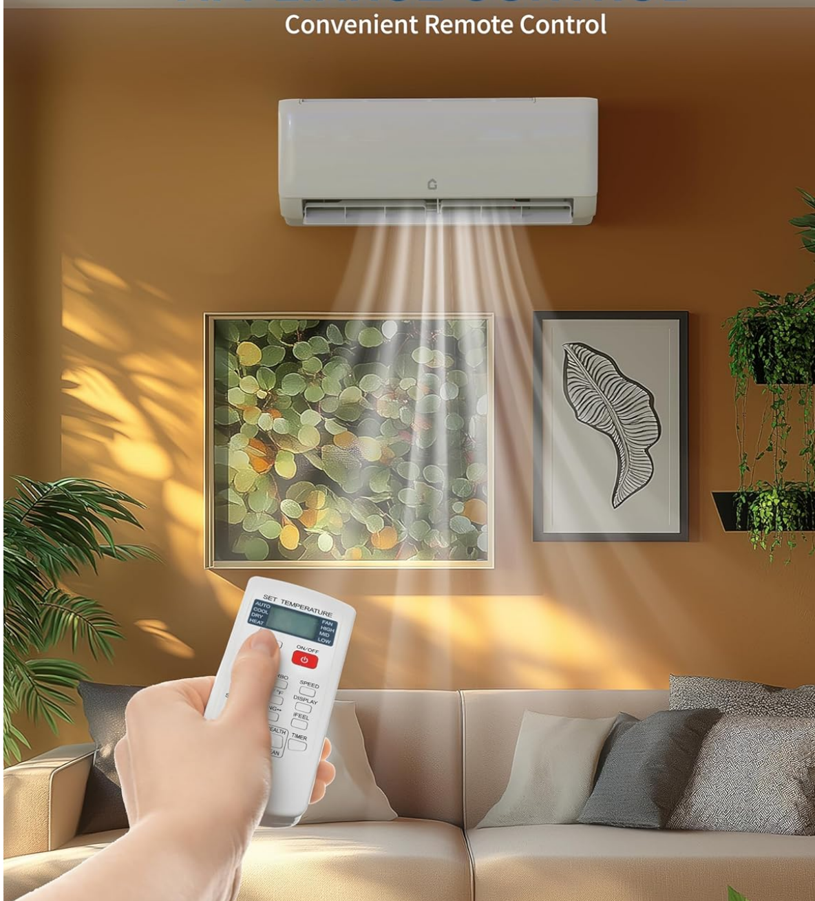
Image: The remote control for the GarveeTech Mini Split AC/Heating System.