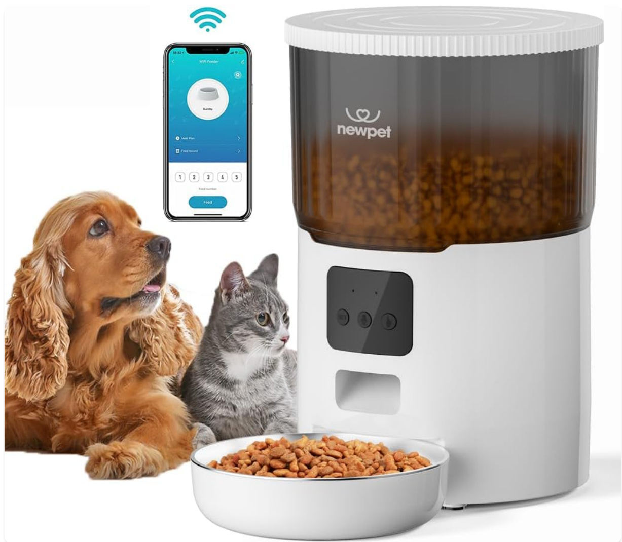
Image 1.1: The NEWPET Automatic Pet Feeder, demonstrating its use with a dog and a cat, alongside a smartphone displaying the control app.