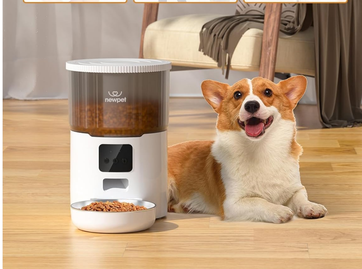
Image 4.1: The feeder provides convenience, allowing owners to manage pet feeding while engaged in other activities.