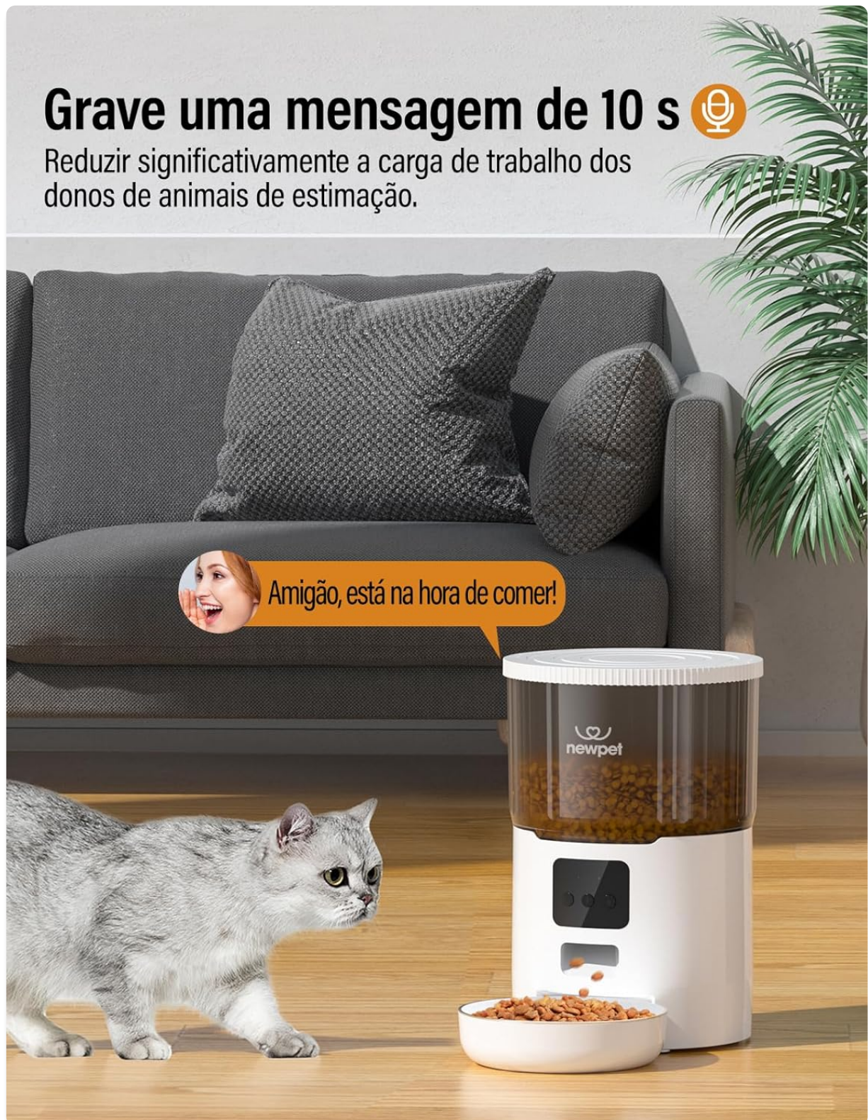
Image 4.2: The 10-second voice recording feature allows owners to call their pets for meals.