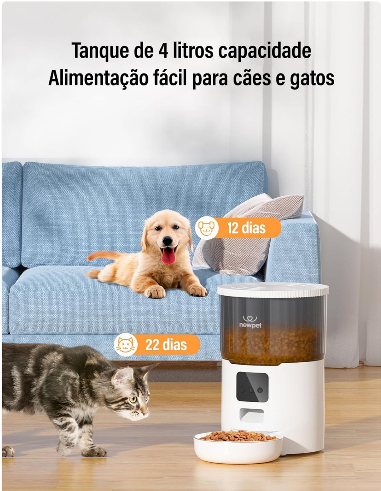
Image 3.1: The 4-liter food tank capacity, showing estimated feeding durations for a puppy (12 days) and a cat (22 days).