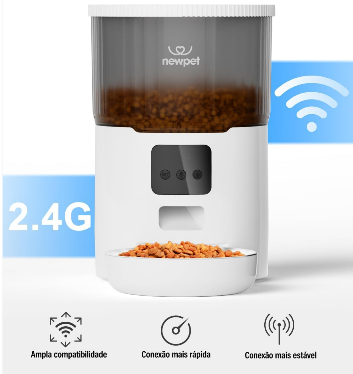
Image 3.3: The feeder supports 2.4 GHz Wi-Fi for broad compatibility, faster, and more stable connections.