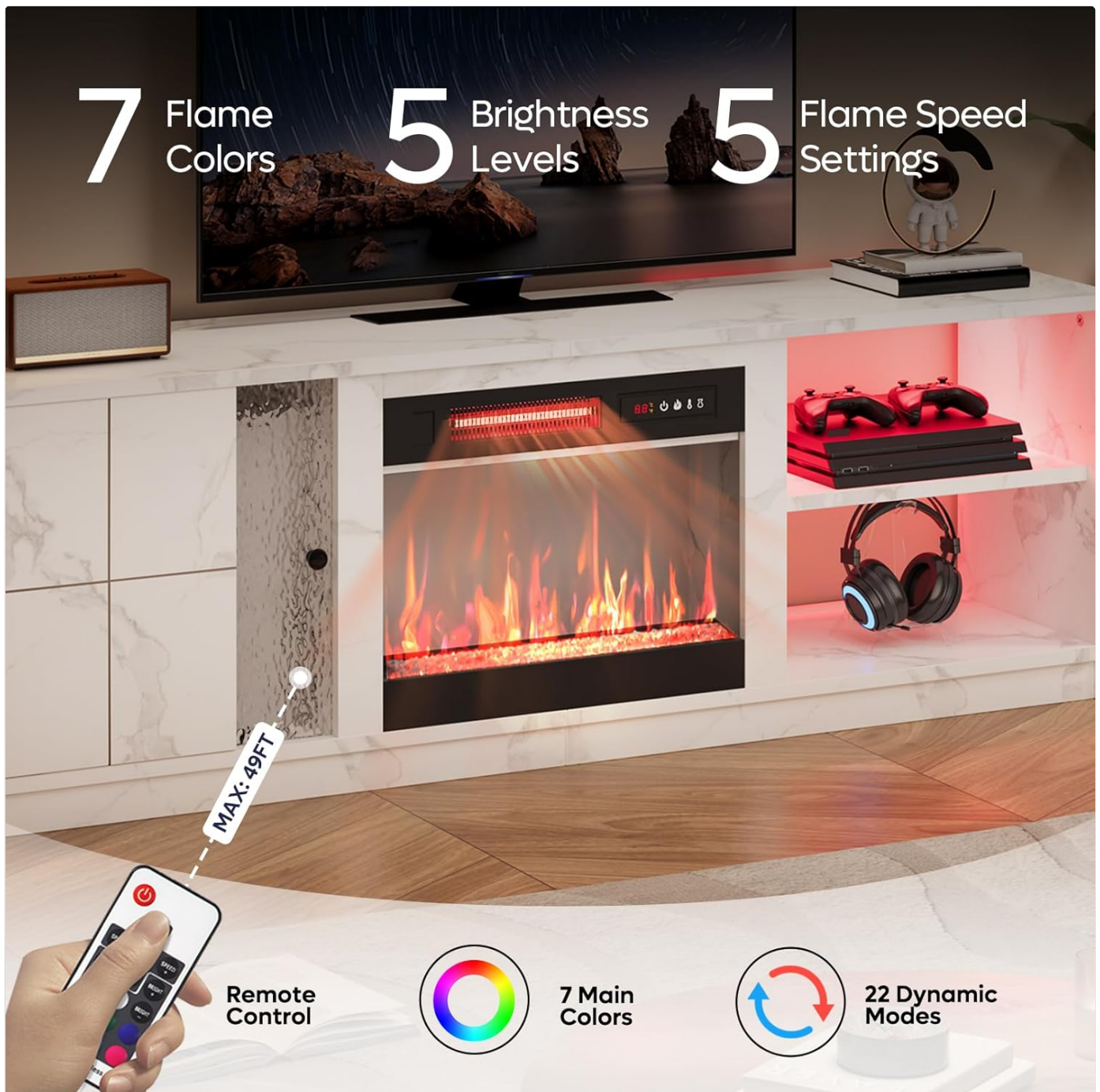
Figure 3: Remote Control and Flame Customization. This image displays the remote control used to operate the electric fireplace, highlighting its capabilities for adjusting 7 flame colors, 5 brightness levels, and 5 flame speed settings. It also shows the LED lighting options with 7 main colors and 22 dynamic modes.