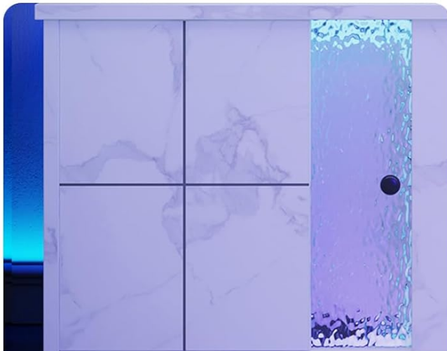
Splice Panel Design for a Sleek Visual Touch