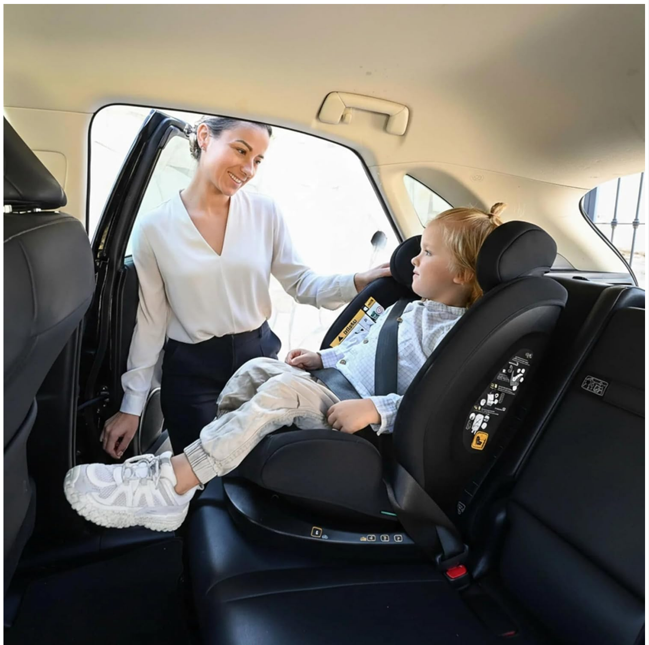
Image: A parent ensuring a child is properly secured in the Deryan Clyde car seat.