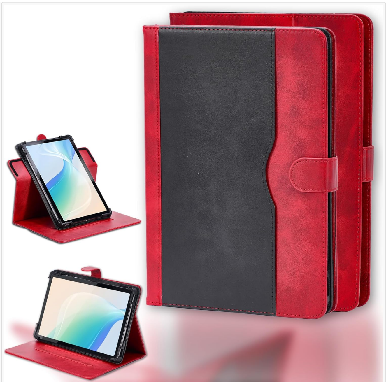
Image 1.1: The Wpawa HT10-PRO Tablet Case, showcasing its design and stand functionality.