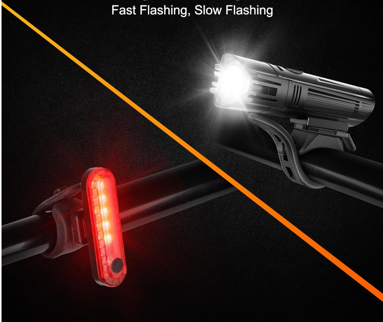
Image 5: Illustration of the four distinct light mode options for both the headlight and taillight, enhancing safety in various conditions.

Full Brightness, Half Brightness, Fast Flashing, Slow Flashing