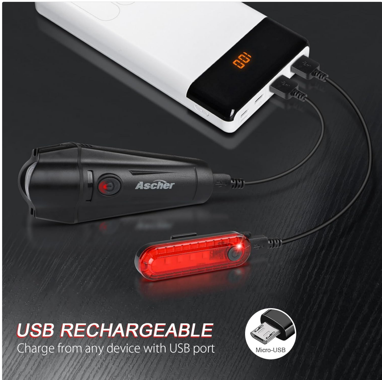
Image 7: Both the headlight and taillight are shown connected via USB cables to a power bank for convenient recharging.