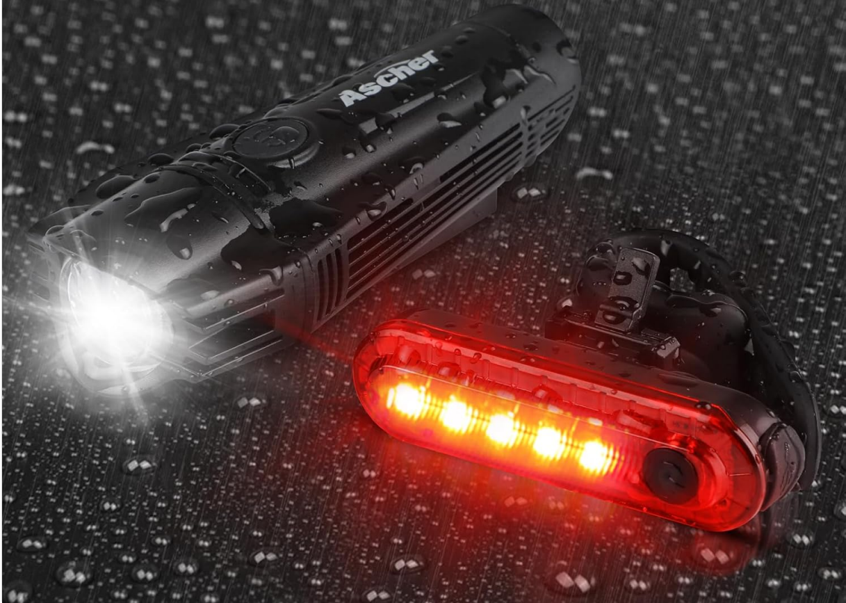
Image 9: The headlight and taillight are shown with water droplets, illustrating their IPX4 waterproof rating for use in various weather conditions.