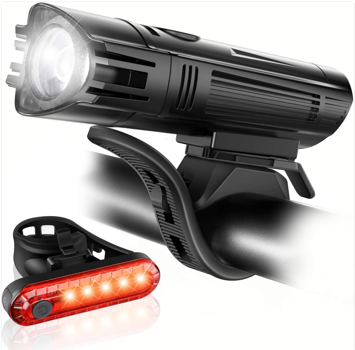
Image 1: Ascher Ultra Bright USB Rechargeable Bike Light Set, showing the front headlight and rear taillight.