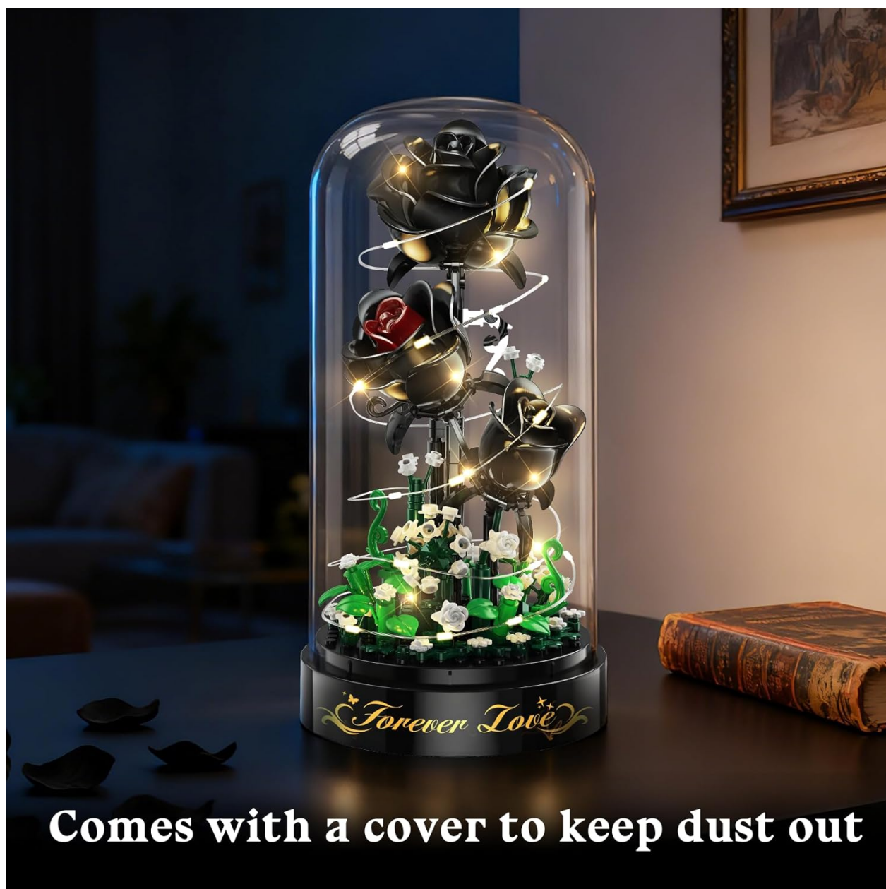
Image: The completed black rose bouquet with its protective dust cover.