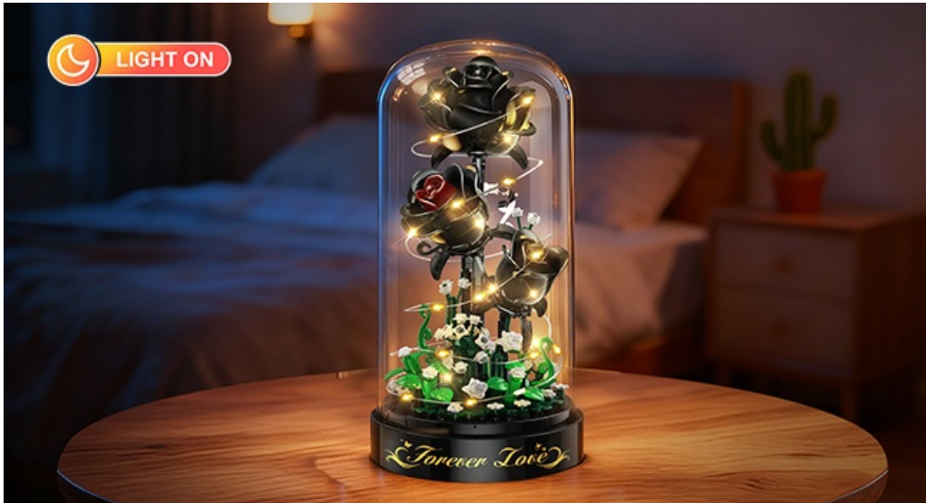
Image: The black rose bouquet illuminated by its LED lights.