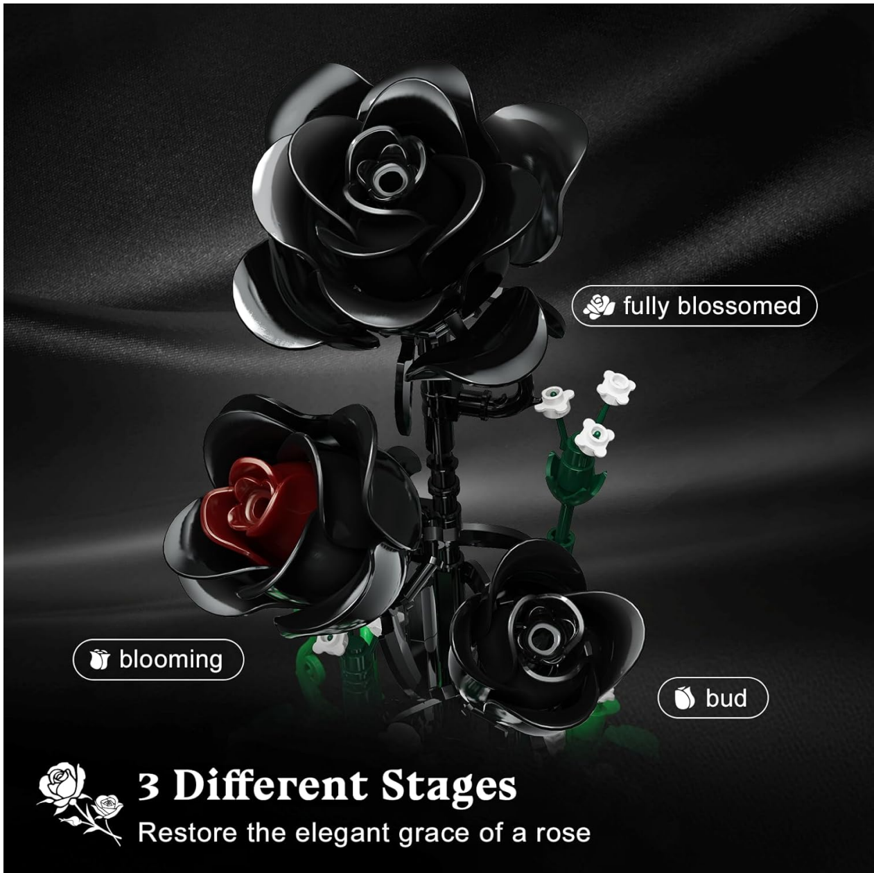
Image: Visual guide for assembling roses in different bloom stages.

Begin by constructing the individual black roses. The set includes pieces to create three roses, allowing for adjustable petals to represent bud, half-bloomed, or fully blossomed stages. Connect the petals to the central core and then attach the green leaf pieces and stem sections.