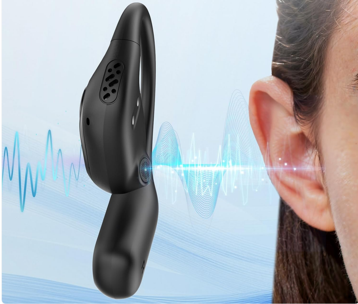
Figure 3.1: Open-ear design for secure fit and all-day comfort. This design allows users to remain aware of their surroundings while listening to audio.

Secure, pain-free fit for music, calls & staying aware of your surroundings.