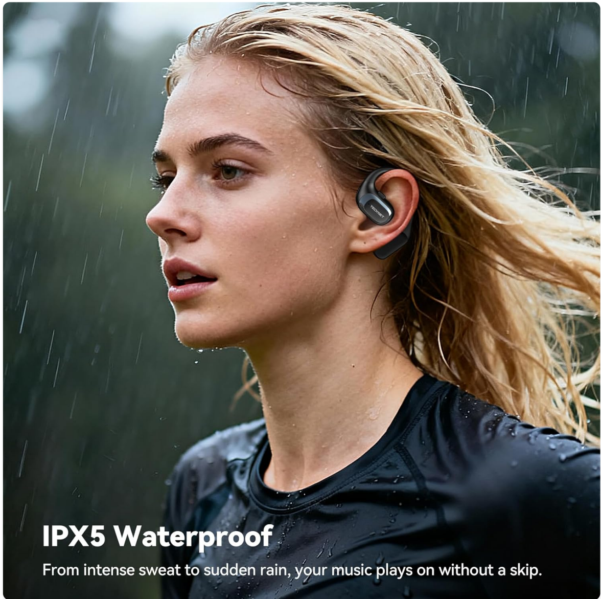
Figure 6.1: IPX5 Waterproof feature. The headphones are designed to withstand sweat and light rain, making them suitable for sports and outdoor activities.