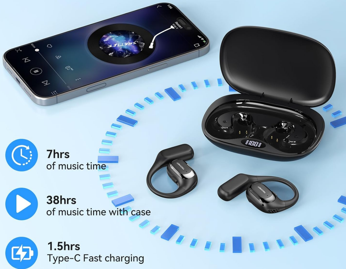
Figure 3.2: Headphones and charging case. The display on the case shows battery status. The image also indicates 7 hours of music time per charge, 38 hours total with the case, and 1.5 hours for Type-C fast charging.