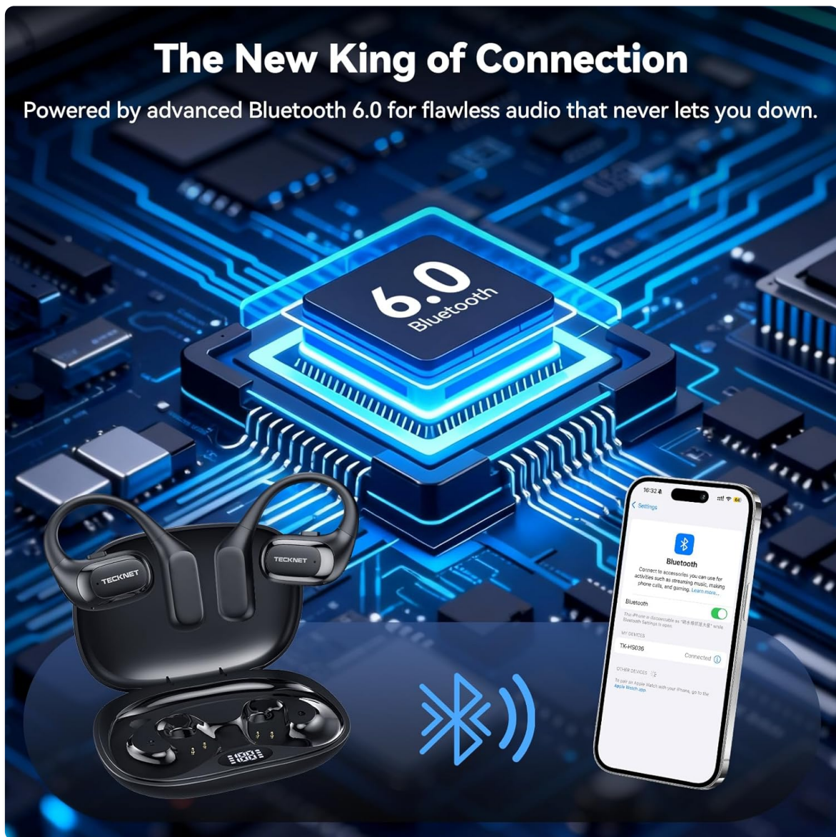
Figure 4.1: Bluetooth 6.0 connection process. The image shows a phone's Bluetooth settings with the TK-HS036 headphones successfully connected.