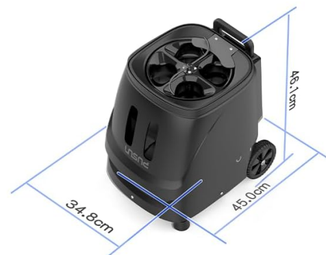
Image: Diagrams showing the machine's dimensions and its compact storage configuration.