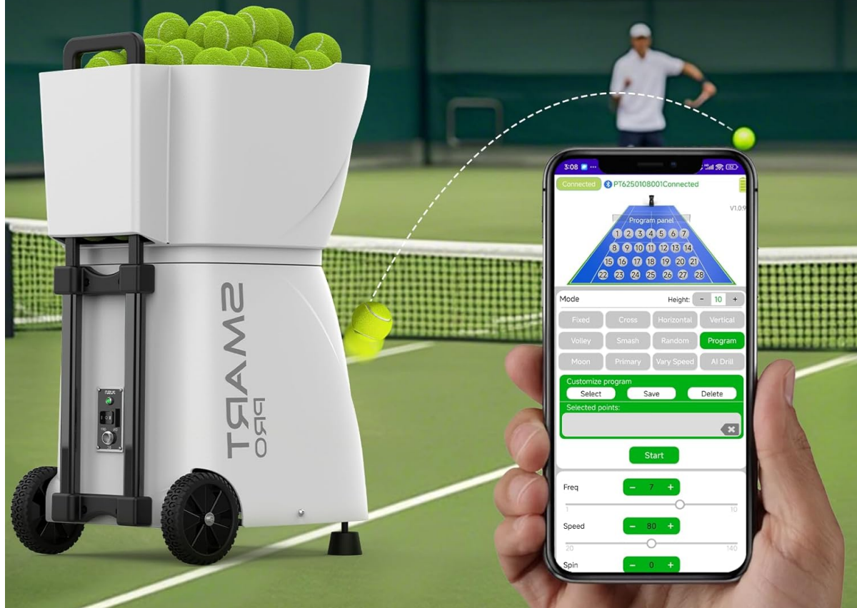
Image: The smartphone app interface showing various training modes and court landing points.

Full court coverage-Offer 28 landing points for select freely!