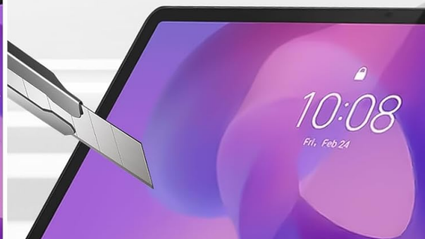
Image 5: Demonstrates the screen protector's robust properties, including shock resistance, liquid resistance, and scratch resistance.