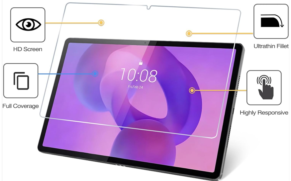
Image 2: Visual representation of the screen protector's high-quality features, including HD clarity, full coverage, high responsiveness, and an ultrathin design.