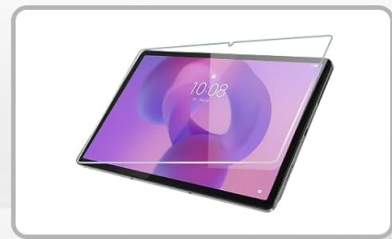
Easy to install