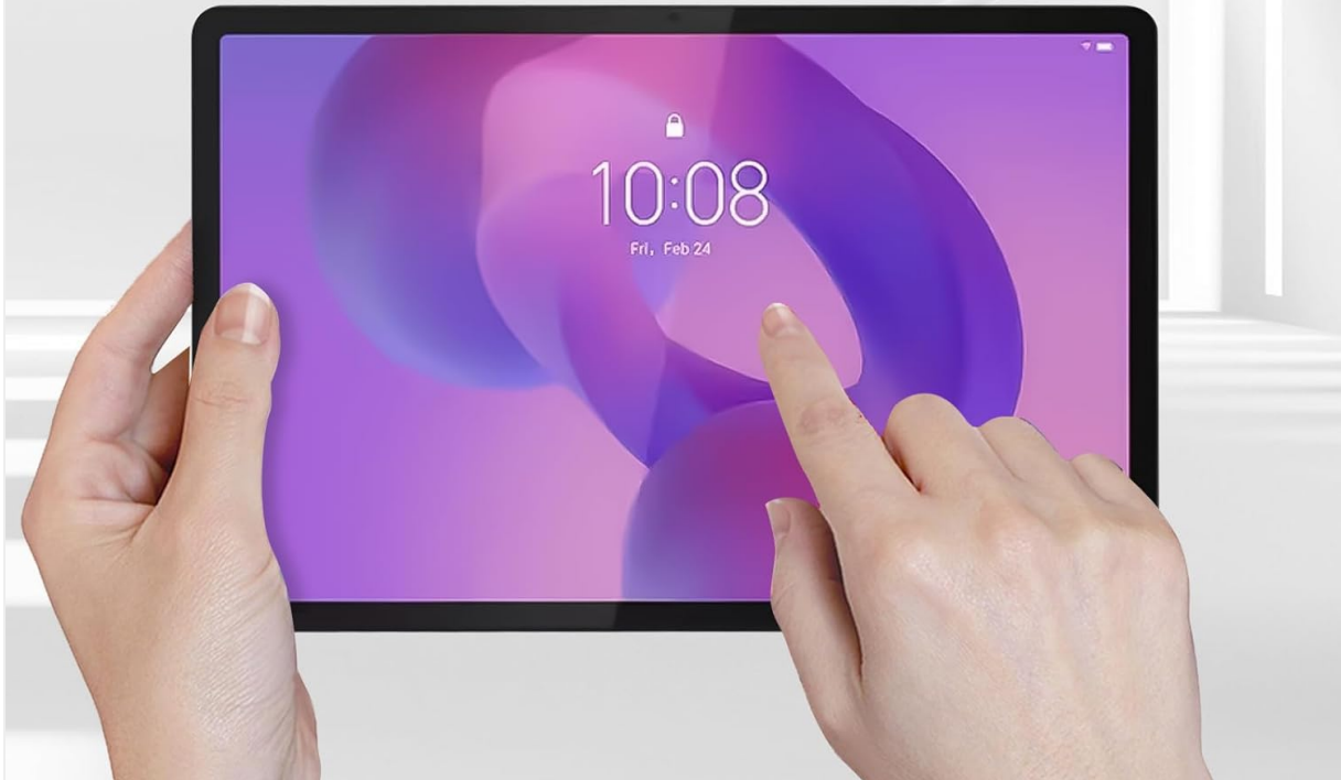
Image 3: Demonstrates the ultra-thin profile, bubble-free installation process, and overall ease of application for the screen protector.