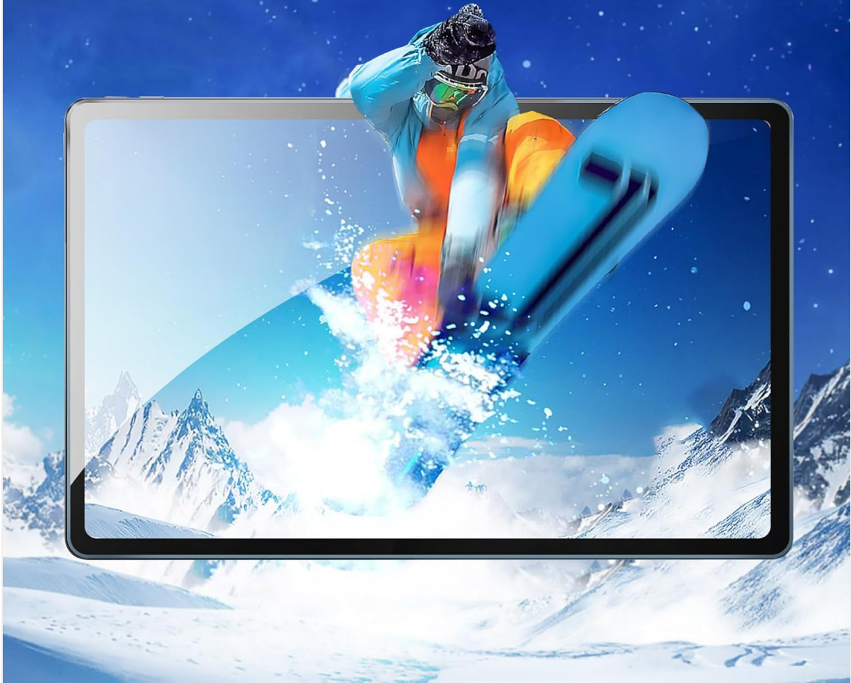
Image 4: Illustrates the high-definition clarity of the screen protector, preserving the original viewing quality and experience.

keeps original and stunning viewing quality & experience