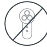
Image: Safety Information - This adapter is not a voltage converter. Always check your device's voltage compatibility.