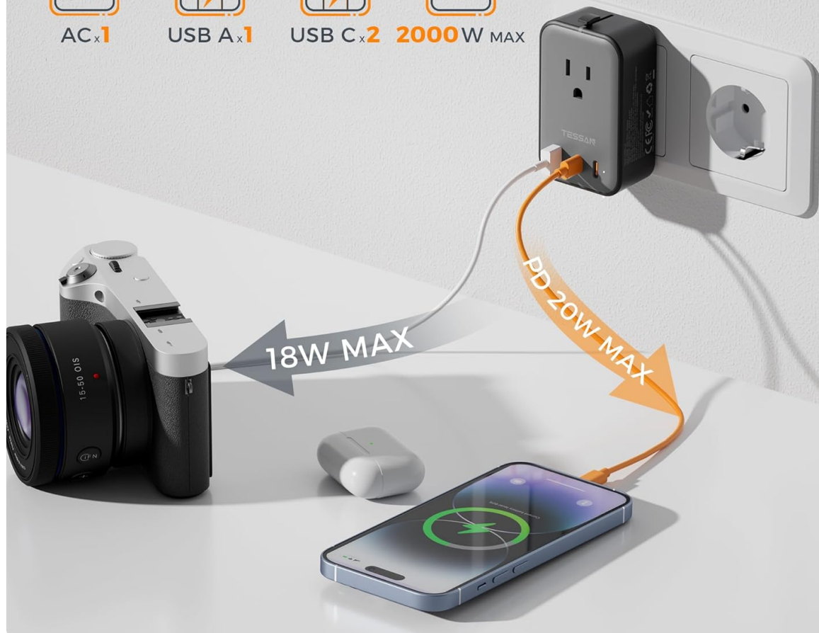
Image: The 4-in-1 design allows charging multiple devices simultaneously.