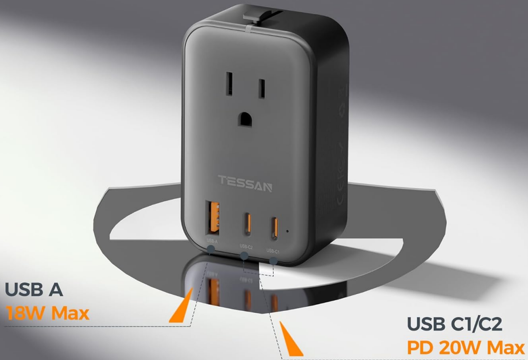
Image: USB-C ports offer Power Delivery (PD) 20W for rapid charging.

Quickly charge devices to reduce waiting time