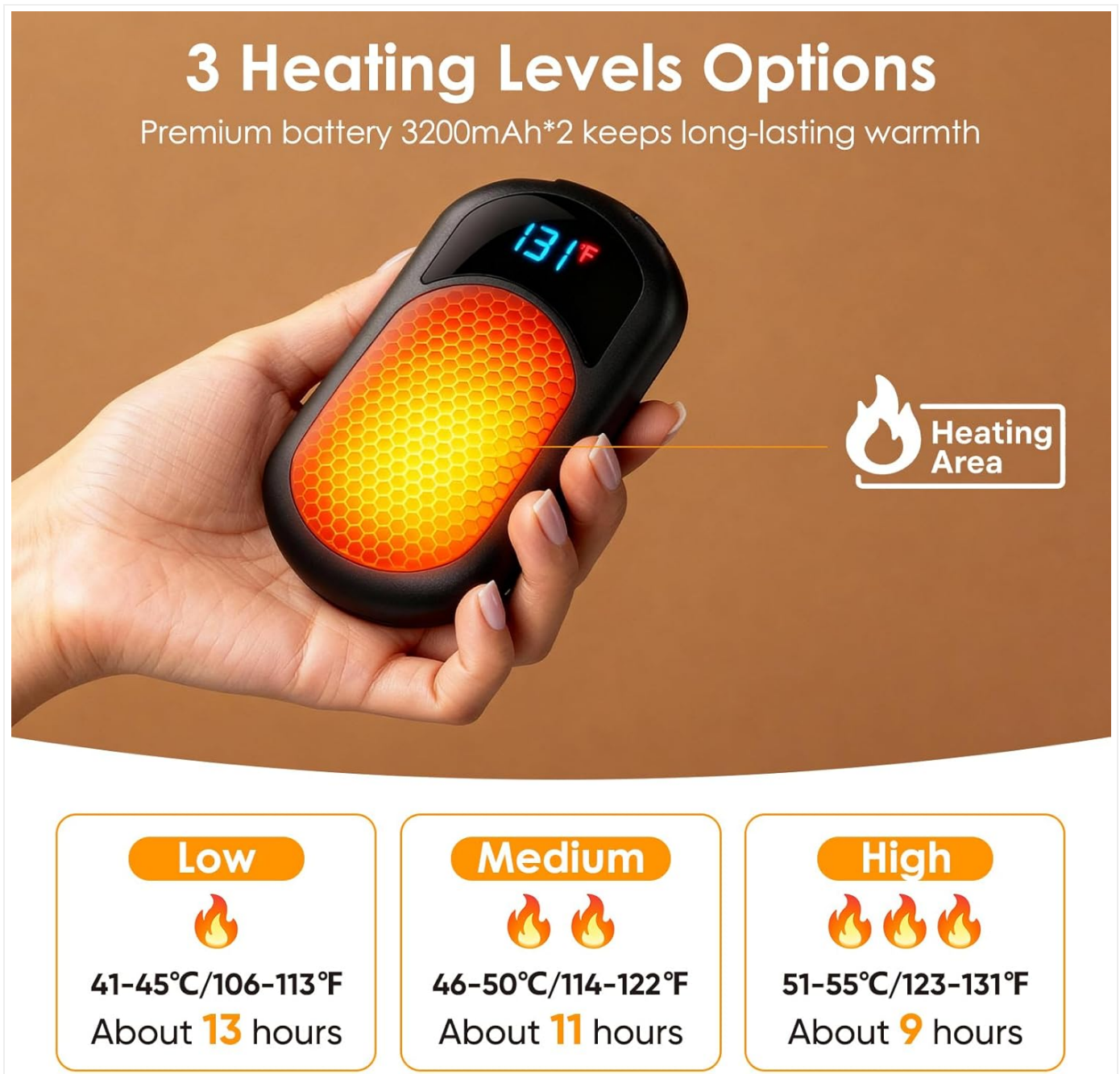
Image: Three Heat Level Options