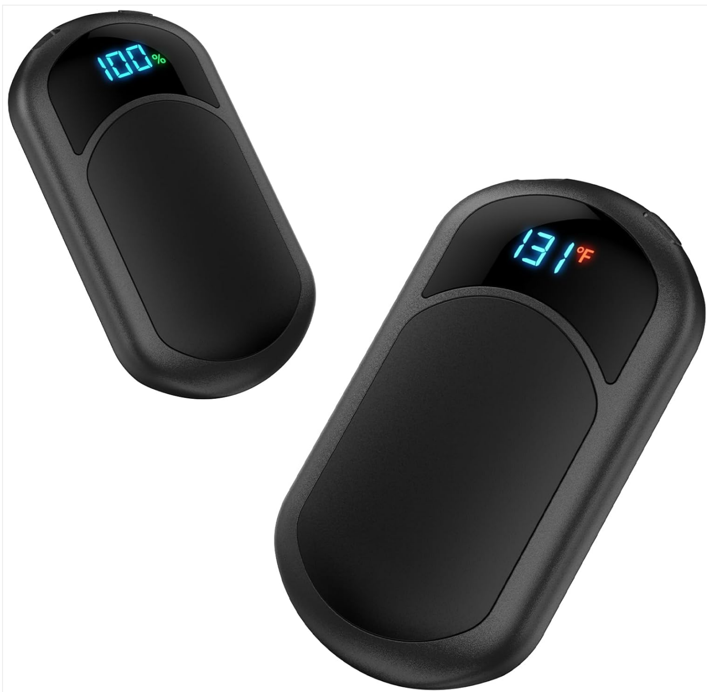
Image: ropelux HW-06 Rechargeable Hand Warmers