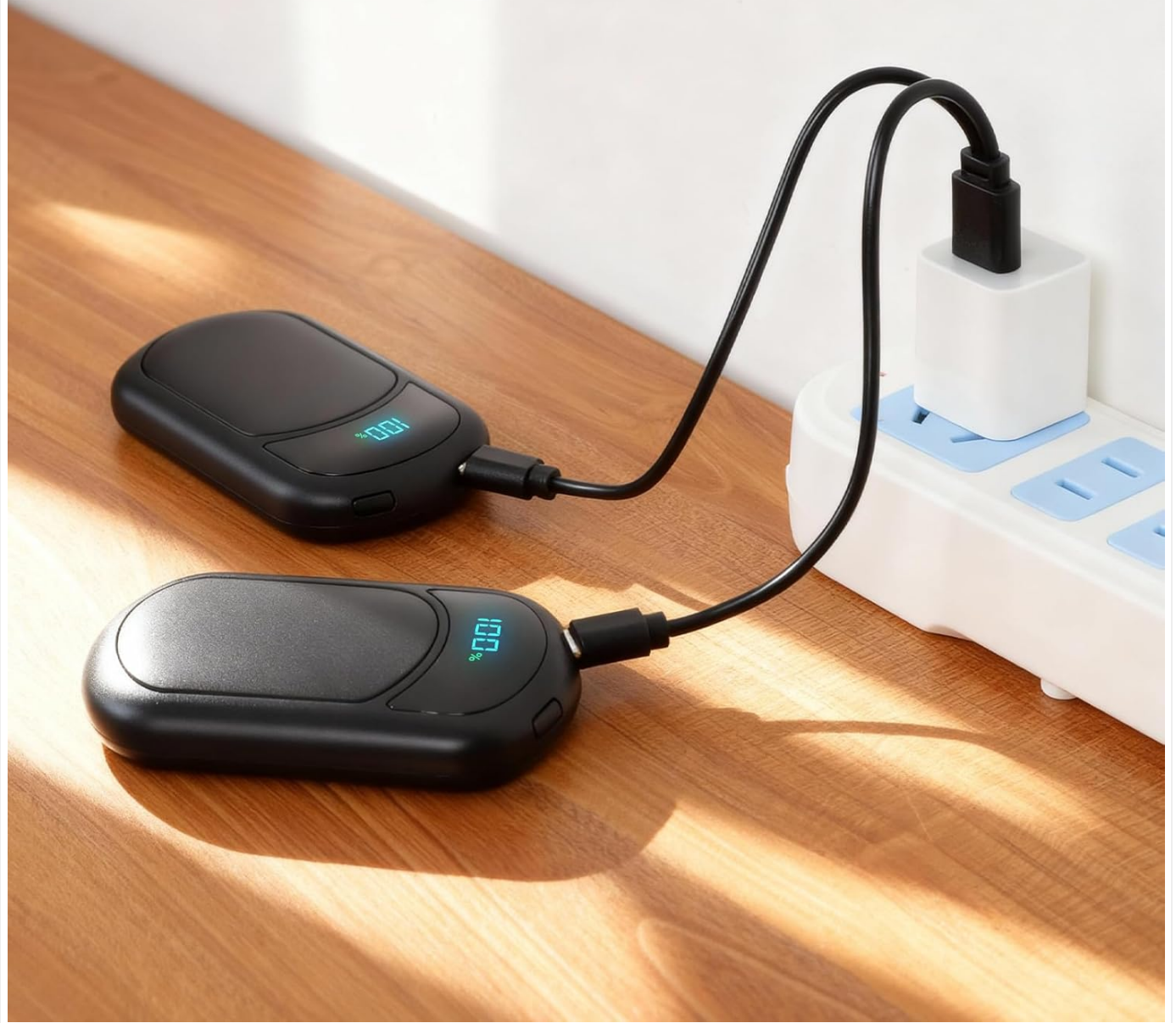
Image: Charging the Hand Warmers

Charging Time: 4-4.5H, Input: 5V, Output: 3.7V