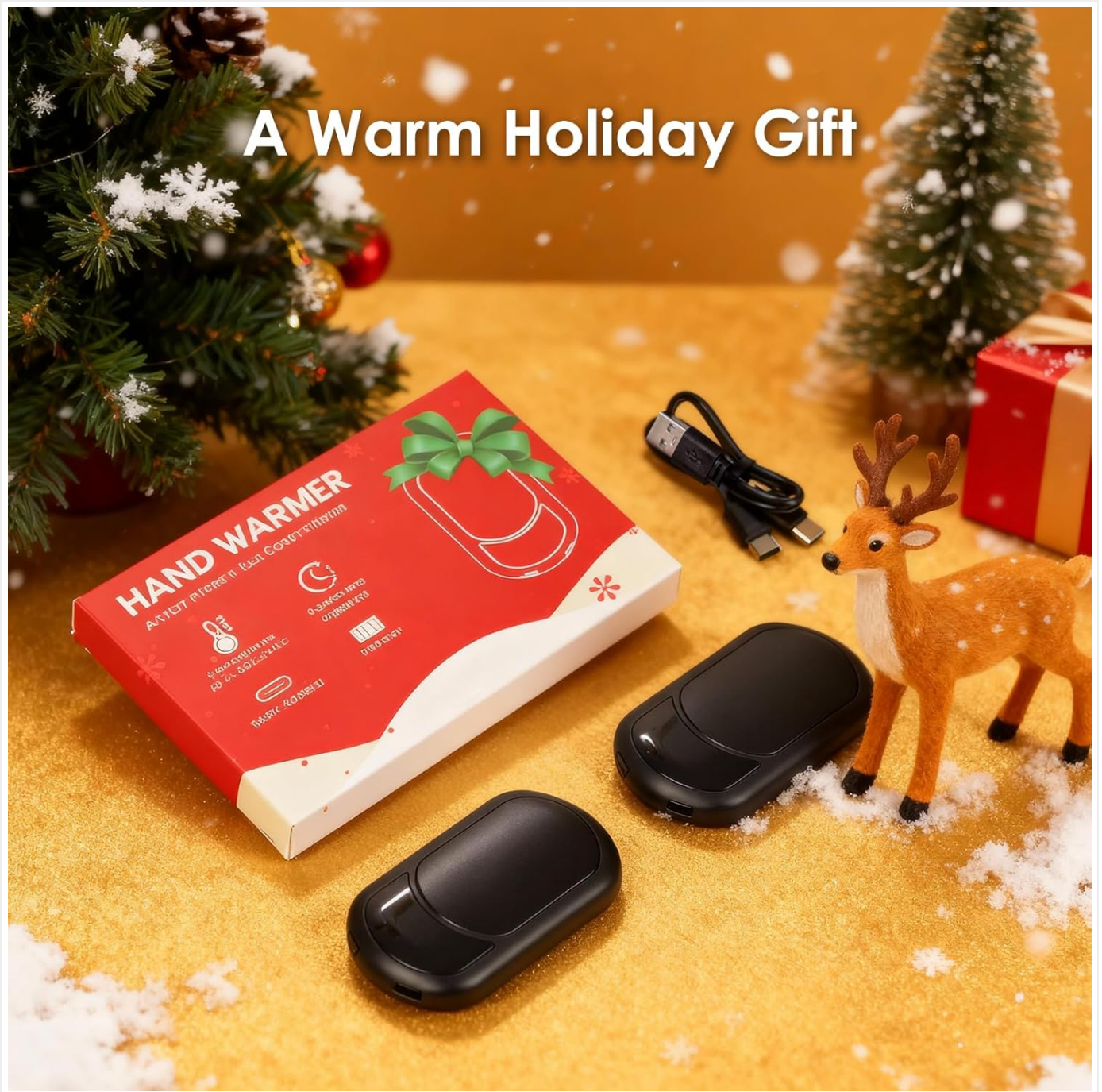
Image: Connected Hand Warmers for Storage