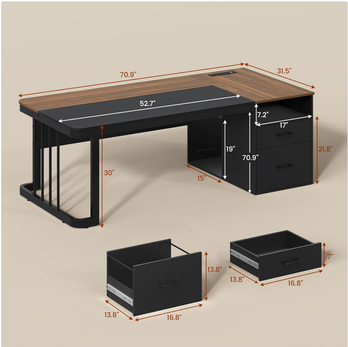
Figure 2: Detailed measurements of the desk's various sections, including the desktop, storage unit, and drawers.