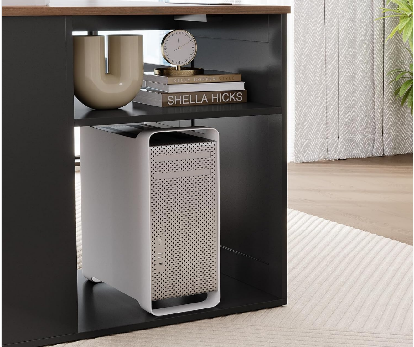
Figure 6: The two-tier open shelves, suitable for a CPU tower or other office items.

Suitable for storing cpu stands and office supplies