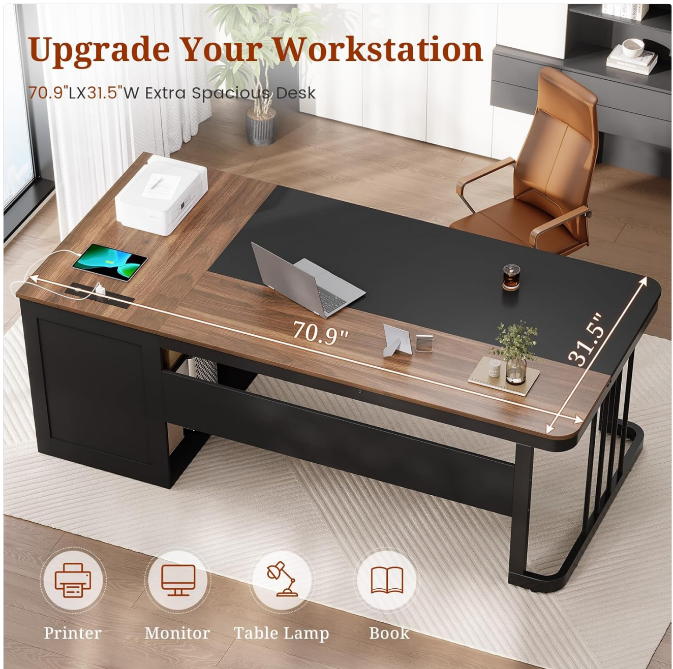
Figure 3: An example of a fully assembled desk, illustrating the final setup.