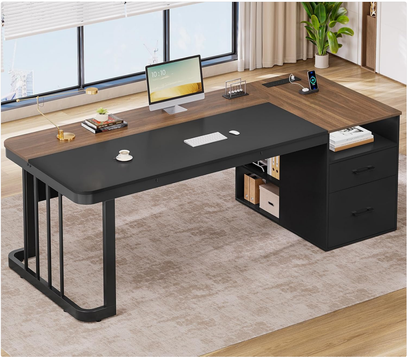
Figure 1: Overall dimensions of the UPOSOJA Executive Desk, showing its spacious design.