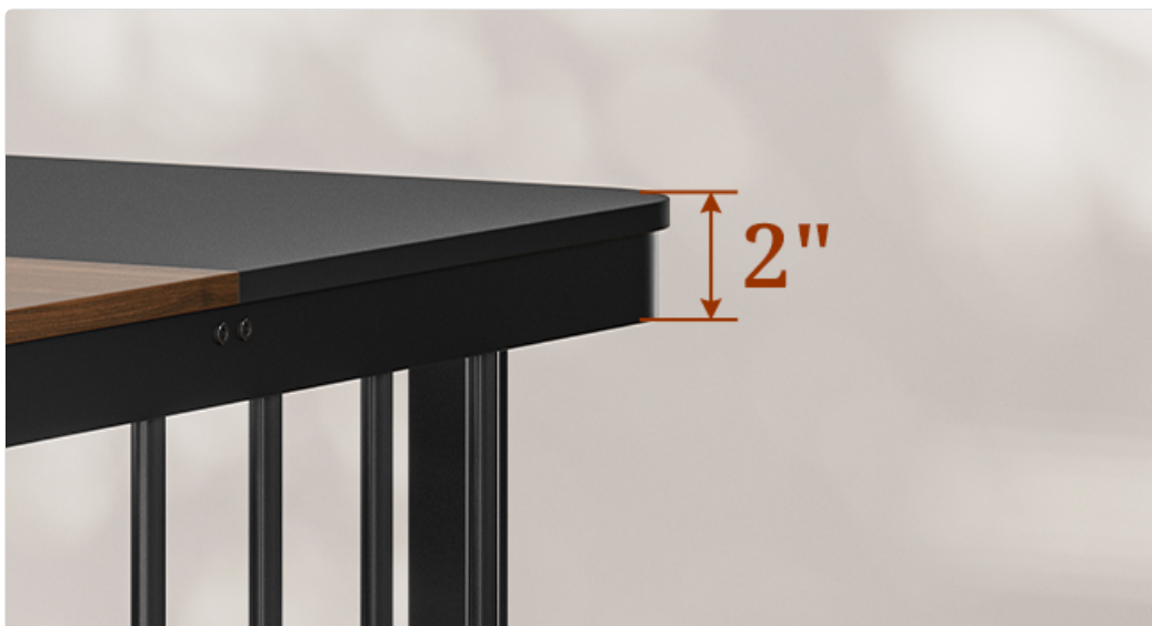
Figure 8: The durable 2-inch thick tabletop, designed for longevity and easy cleaning.