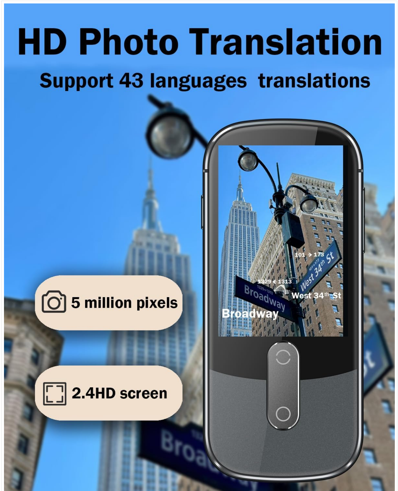
Image: The Wooask W09 device being used to translate a street sign in a city environment, showcasing its HD photo translation capability with a 5-megapixel camera and 2.4-inch HD screen.