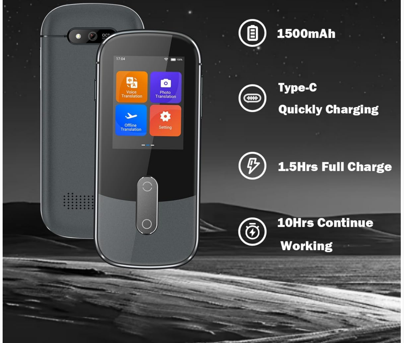
Image: The Wooask W09 device screen showing battery level and charging information, highlighting its long-lasting battery and quick charging capability.