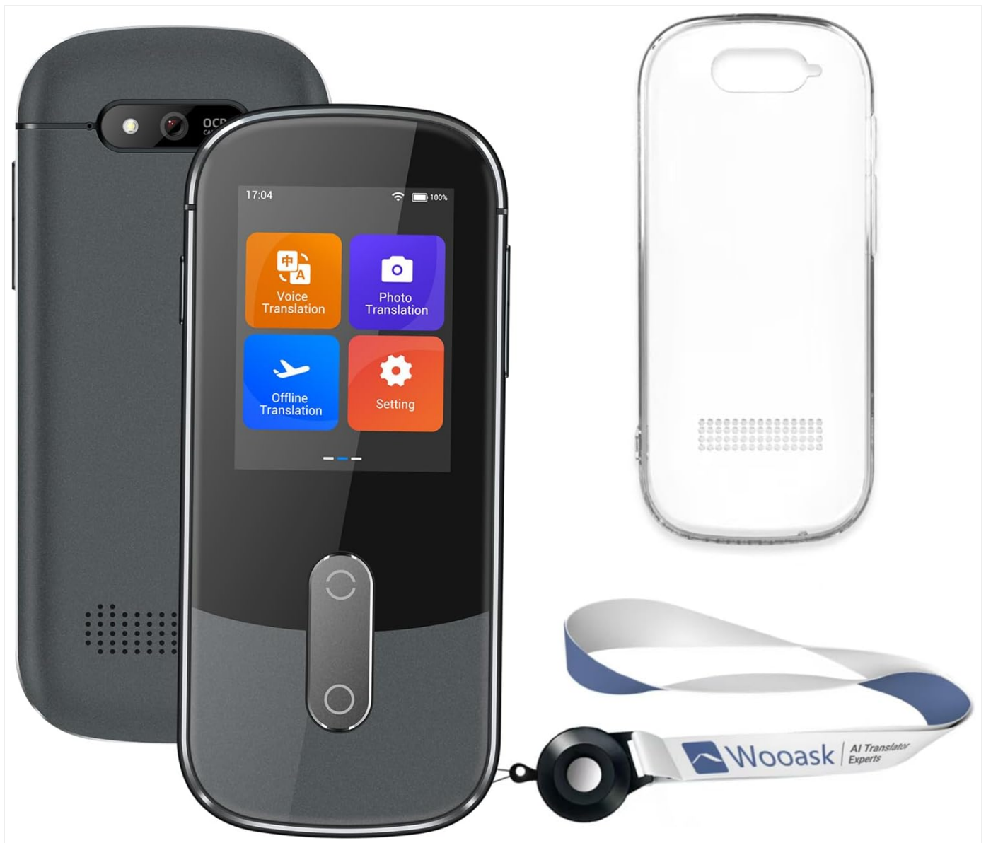
Image: The Wooask W09 translator device showing its front screen with the main menu icons for Voice Translation, Photo Translation, Offline Translation, and Settings. The back of the device with its camera is also visible.

The Wooask W09 features a 2.4-inch HD touchscreen for navigation and interaction. It also includes physical buttons for quick access to translation functions. The main screen displays options for Voice Translation, Offline Translation, Photo Translation, Recording, and Settings.