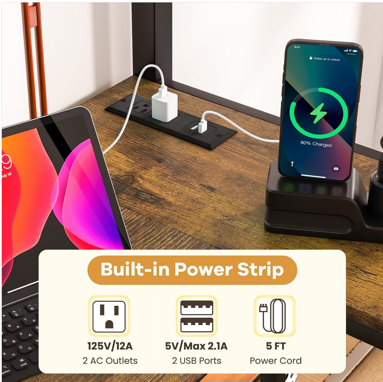
Image: Detail of the built-in power strip with AC outlets and USB ports.