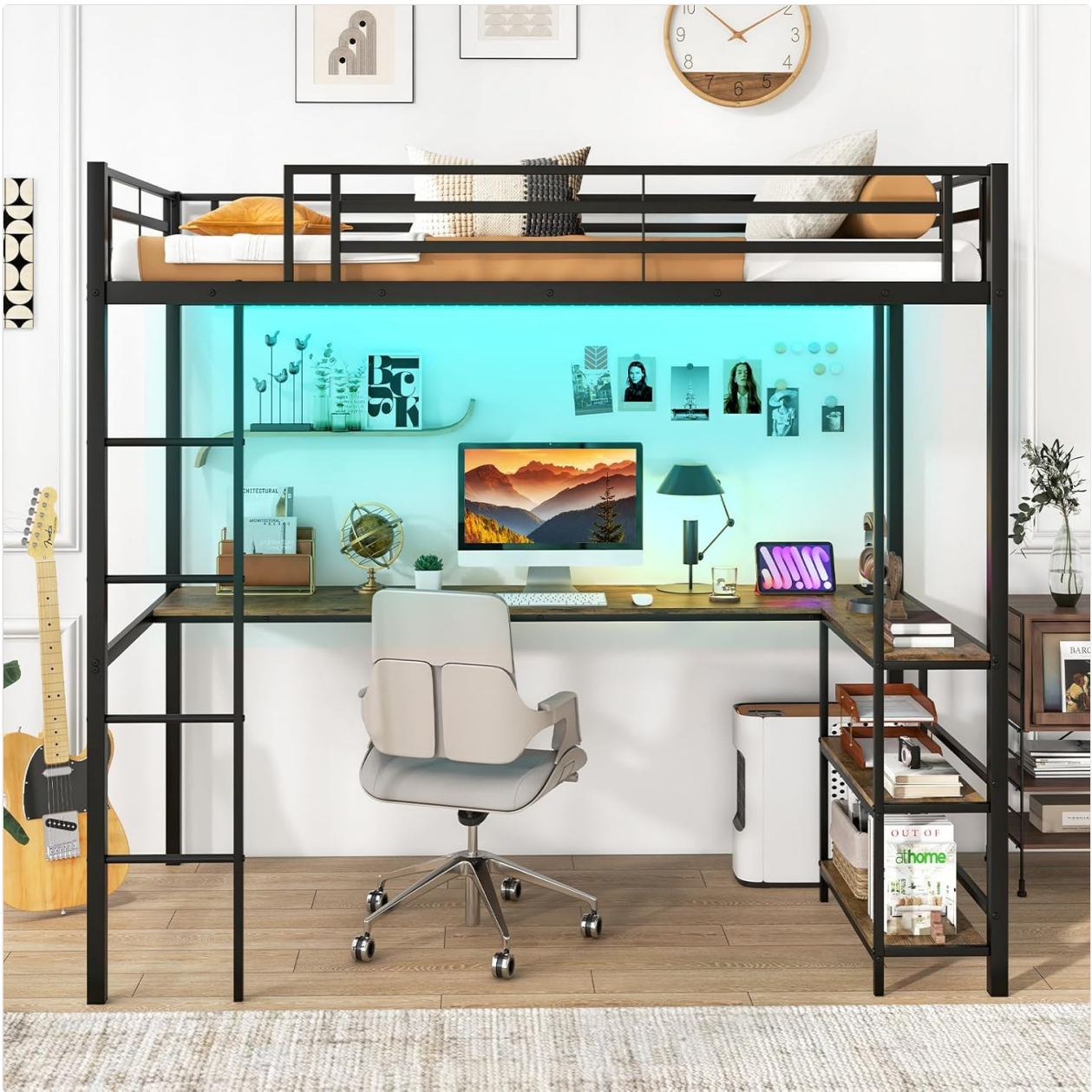
Image: Overall view of the KOTEK Twin Loft Bed, highlighting the bed, desk, and storage components.