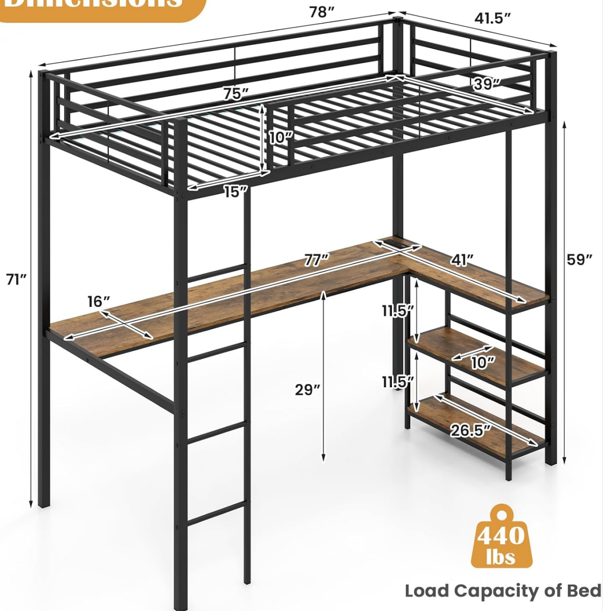
Image: Dimensional diagram of the loft bed, providing measurements for assembly planning.