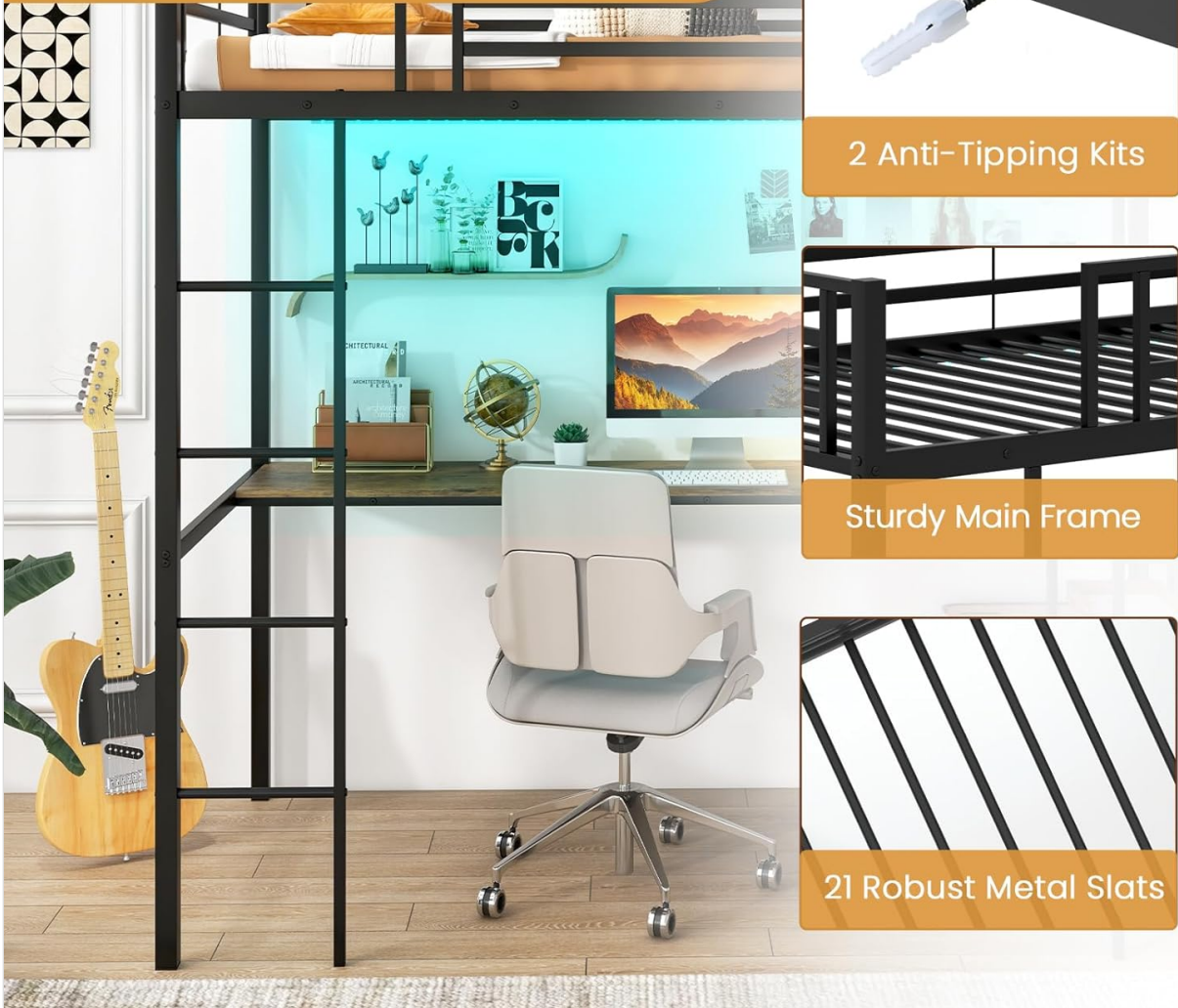
Image: Components illustrating the stable metal structure, including anti-tipping kits and robust slats.

A climbing ladder for easy access to get on and off the bed