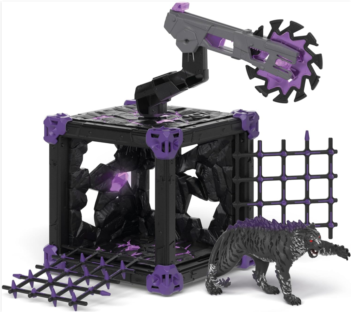
Image: The complete BattleCave Shadow Tiger playset, featuring the black and purple cave structure, a movable saw arm, a removable gate, and the Shadow Tiger figure.