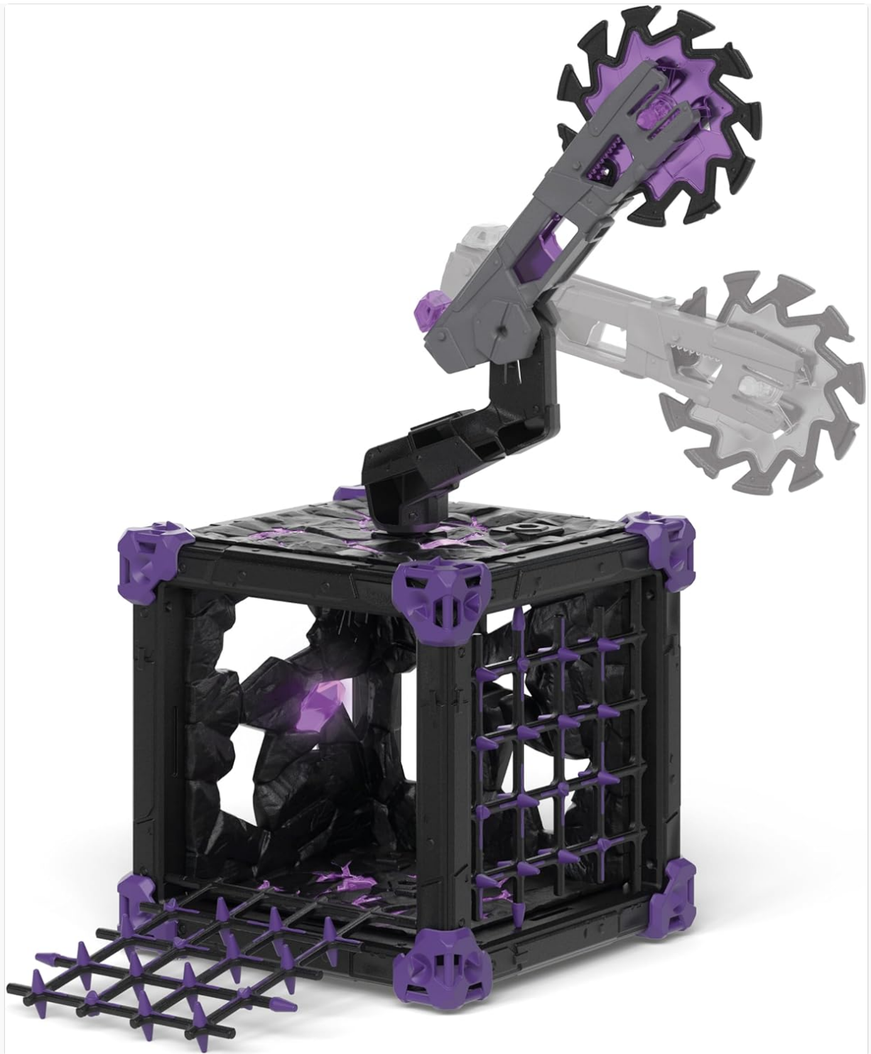
Image: The BattleCave with the saw arm positioned above, showing the saw blade in a blurred motion, indicating its dynamic movement.