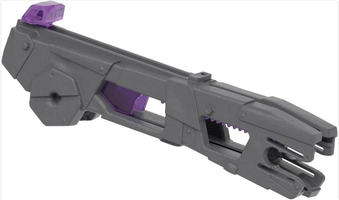
Image: A detailed view of the gray and purple saw arm mechanism, showing its connection points and design.