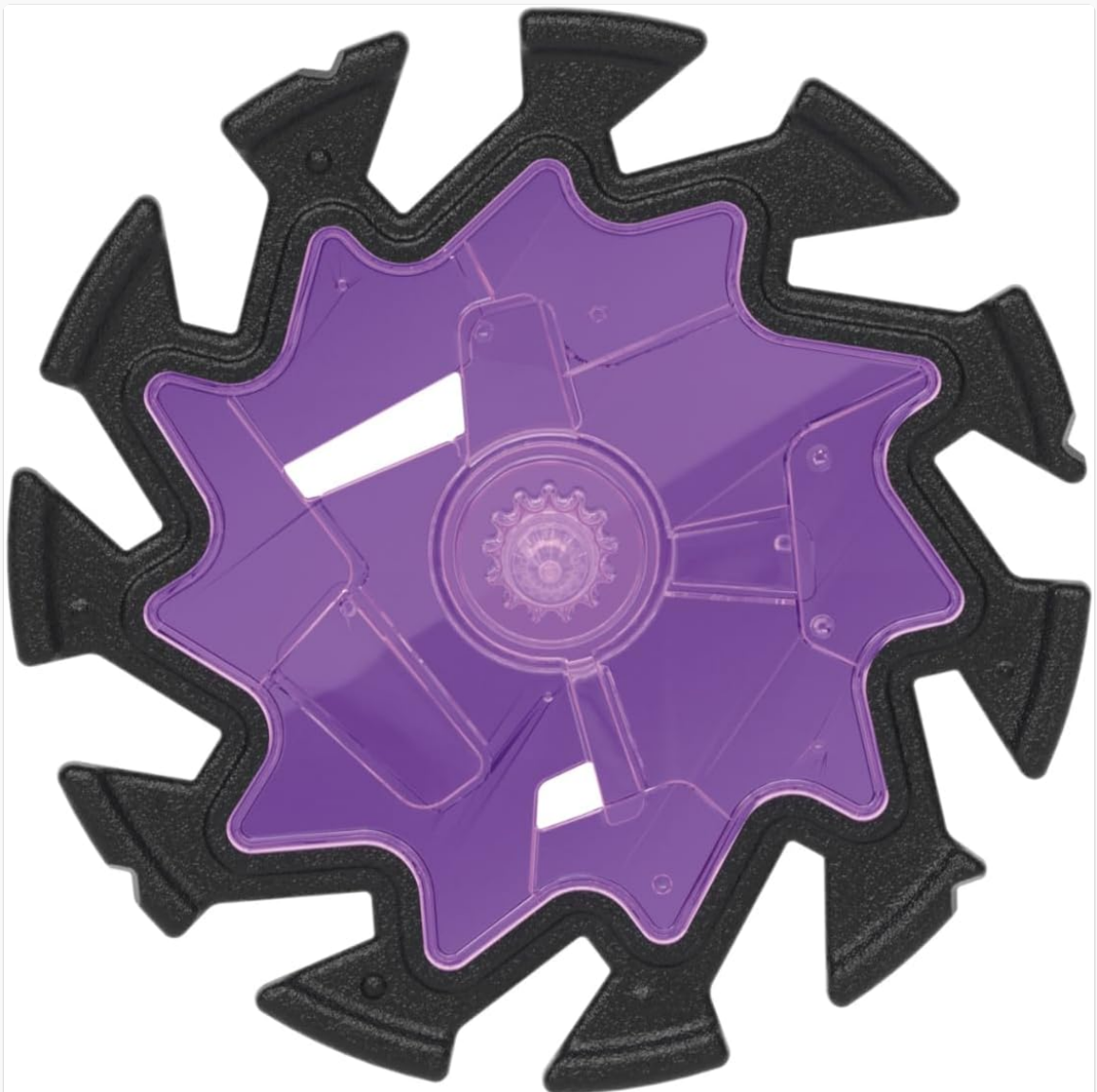
Image: A close-up of the purple and black circular saw blade, highlighting its jagged edges and central attachment