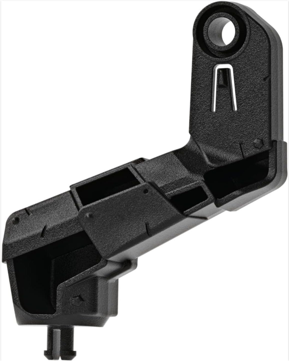
Image: A close-up view of a black plastic connecting piece, typical for assembling the BattleCave structure.