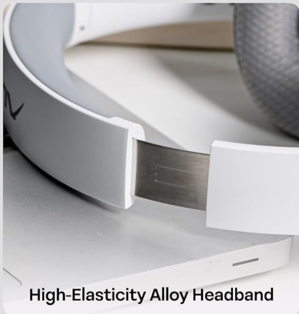
High-Elasticity Alloy Headband