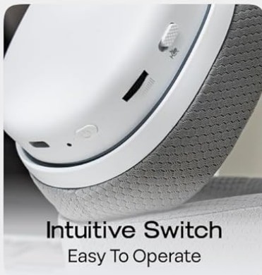
Intuitive Switch Easy To Operate