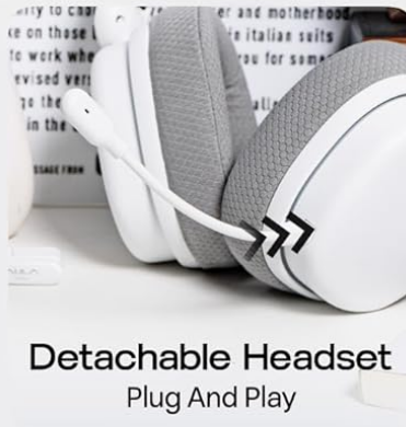
Detachable Headset Plug And Play