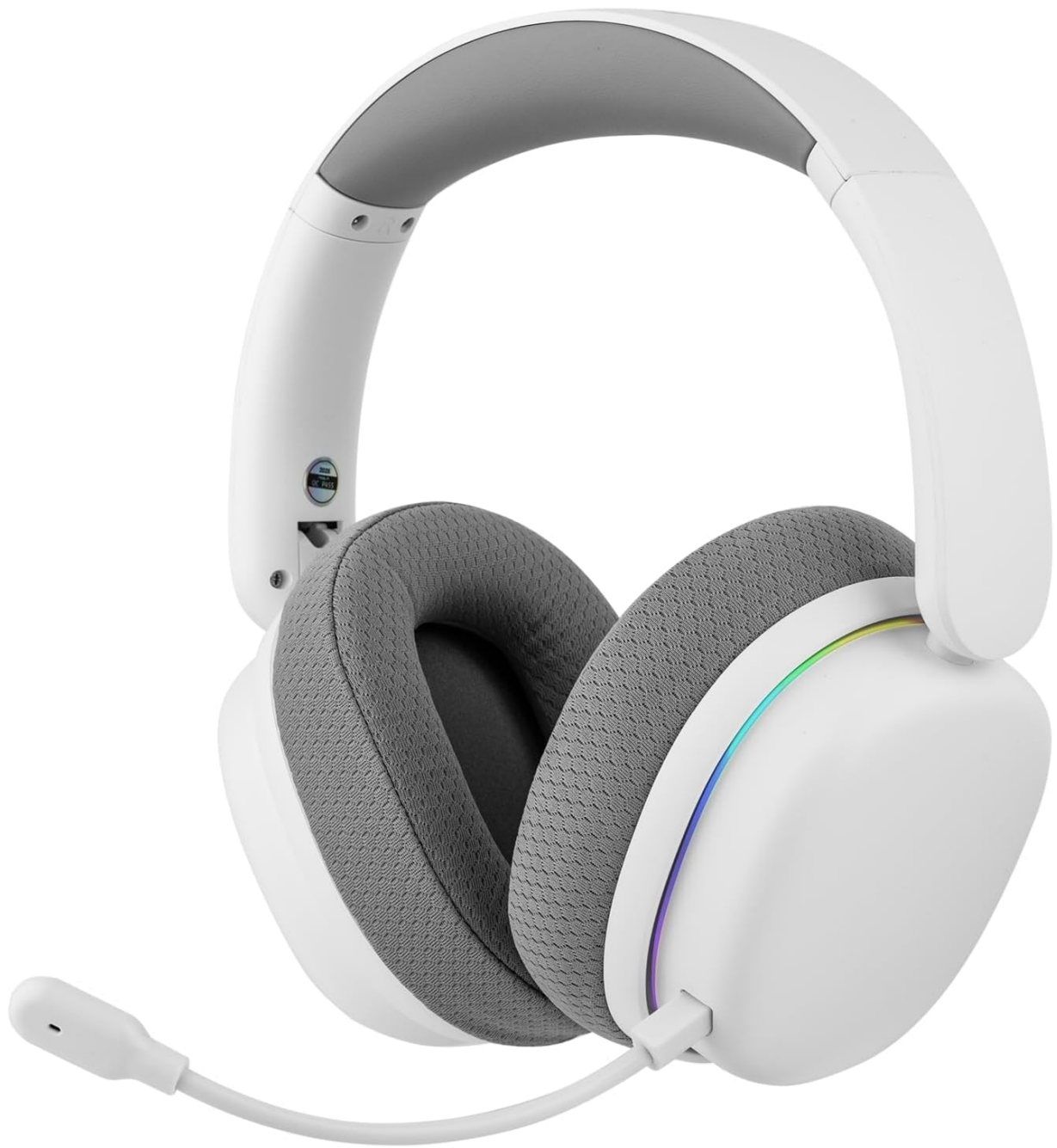
The EPOMAKER X Aula G7 Pro Wireless Gaming Headset in its white color variant, showcasing its sleek design and detachable microphone.