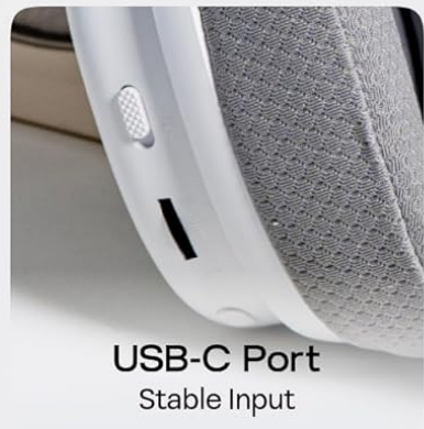
USB-C Port Stable Input

Highlights the headset's user-friendly operation with an intuitive switch for modes, a detachable microphone for versatility, and a stable USB-C port for charging and wired connection.