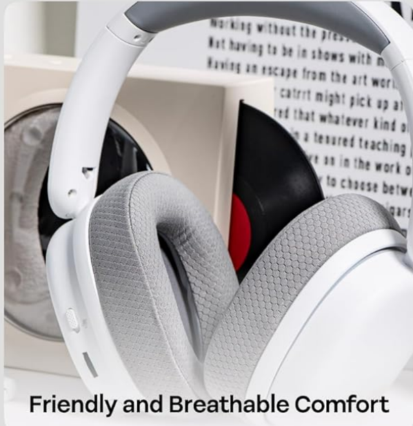
Friendly and Breathable Comfort