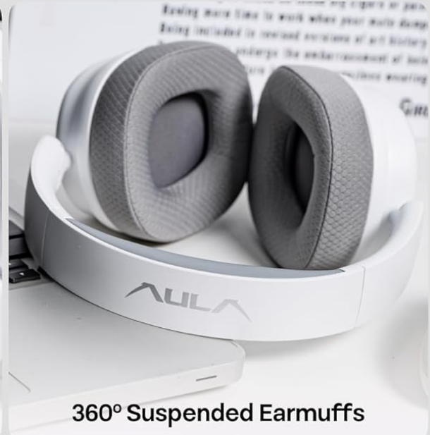
360° Suspended Earmuffs