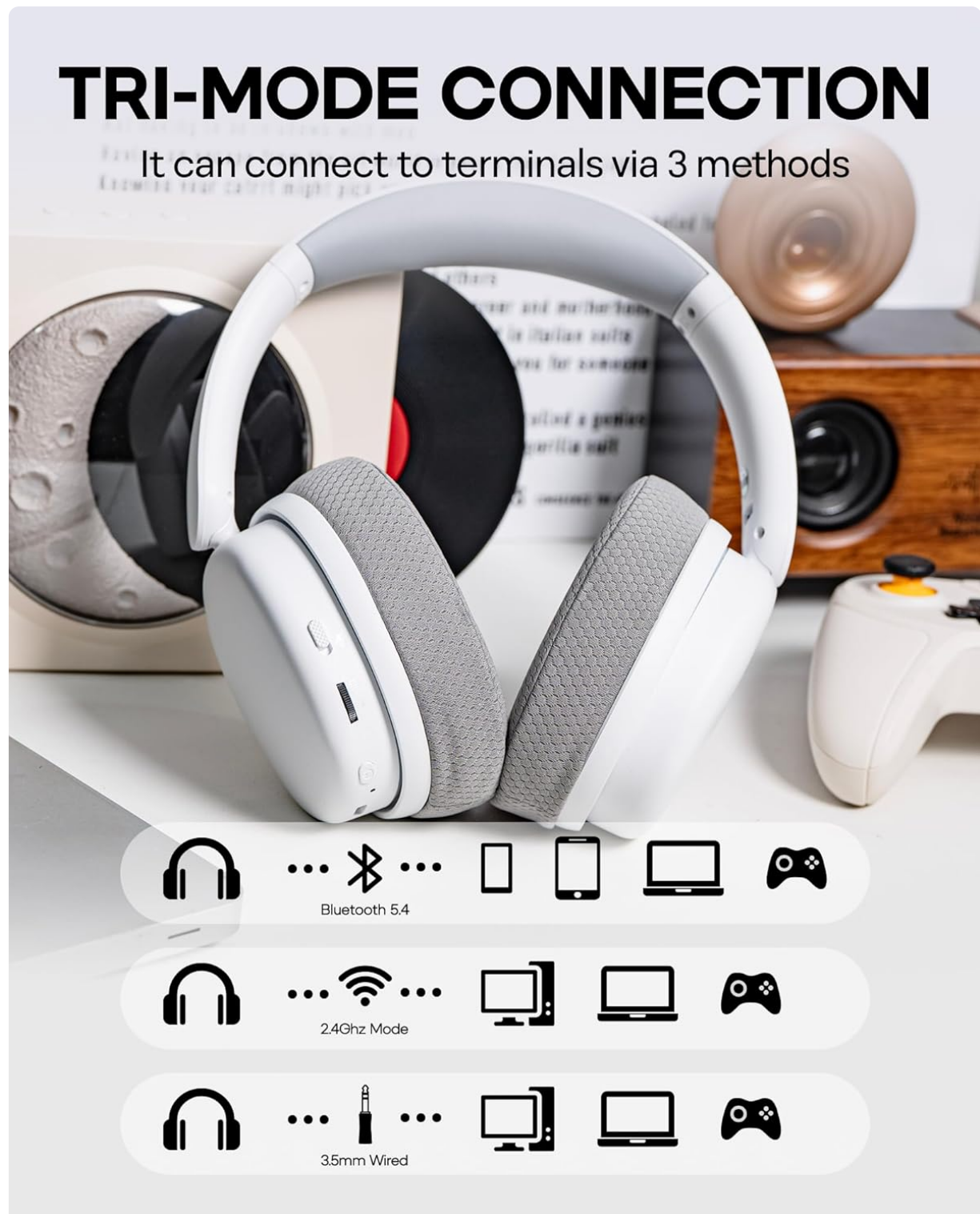
Diagram illustrating the headset's tri-mode seamless connection options: 2.4G wireless mode, Bluetooth 5.4, and 3.5mm wired connection, compatible with various devices including PCs, PlayStations, and Nintendo Switch.