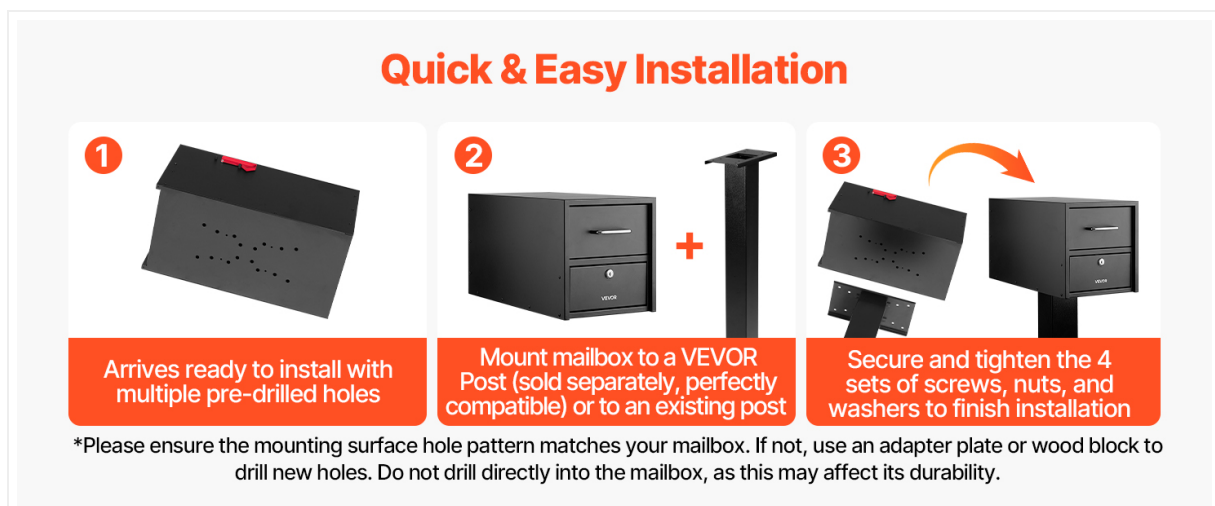
Image 4.1: Visual guide for quick and easy installation, illustrating the pre-drilled holes, mounting process, and securing steps.