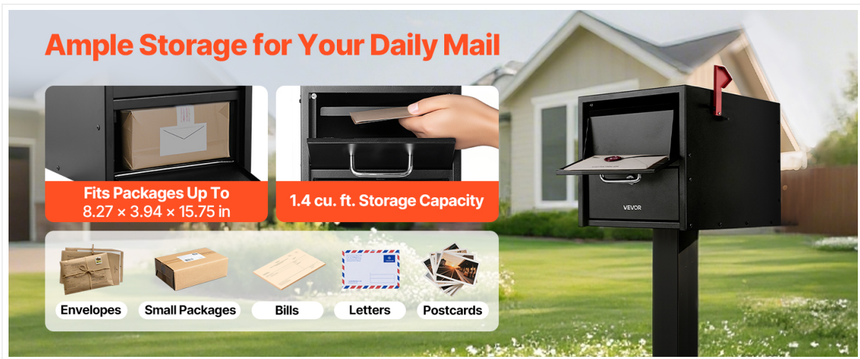
Image 5.1: The mailbox offers ample storage capacity for various mail items, including small packages.