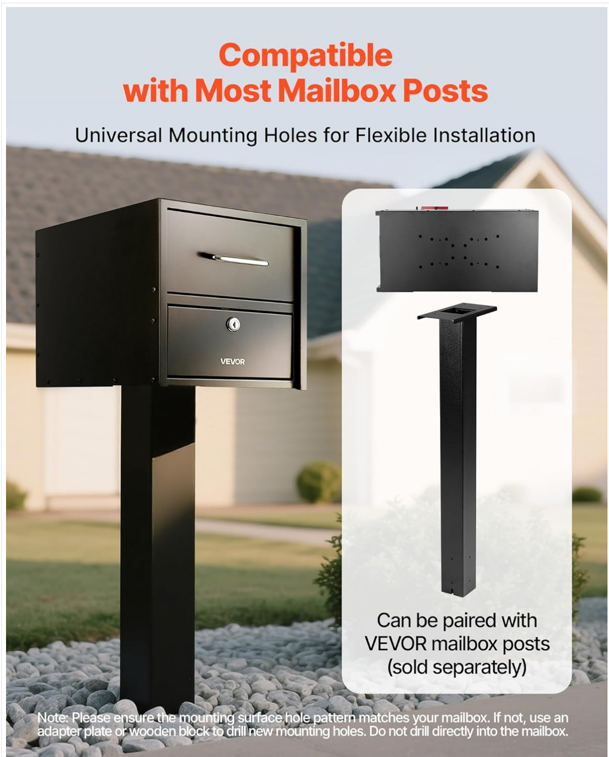
Image 4.2: The mailbox features universal mounting holes for flexible installation, compatible with most standard posts, including VEVOR posts (sold separately).