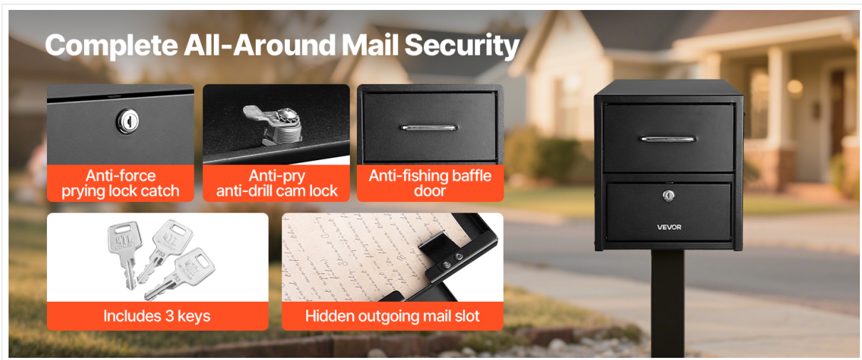
Image 3.2: Detailed view of the mailbox's comprehensive security features, including the lock, baffle, and outgoing mail slot.