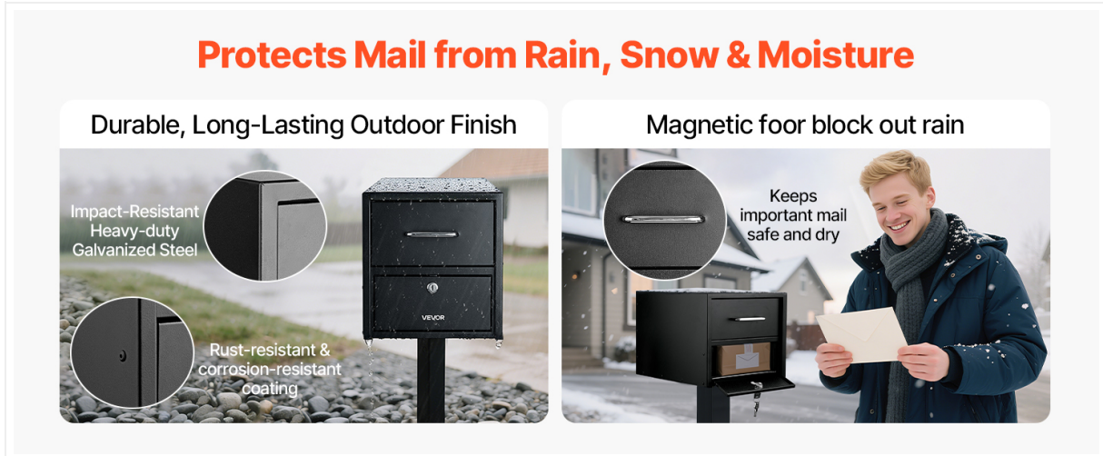
Image 6.1: The mailbox is constructed from impact-resistant, heavy-duty galvanized steel with a rust-resistant coating and features a magnetic door to protect mail from moisture.