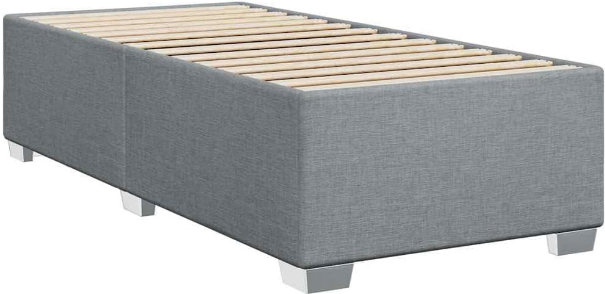
Image 3.1: Overview of the bed frame components, including the upholstered sections and wooden slats.