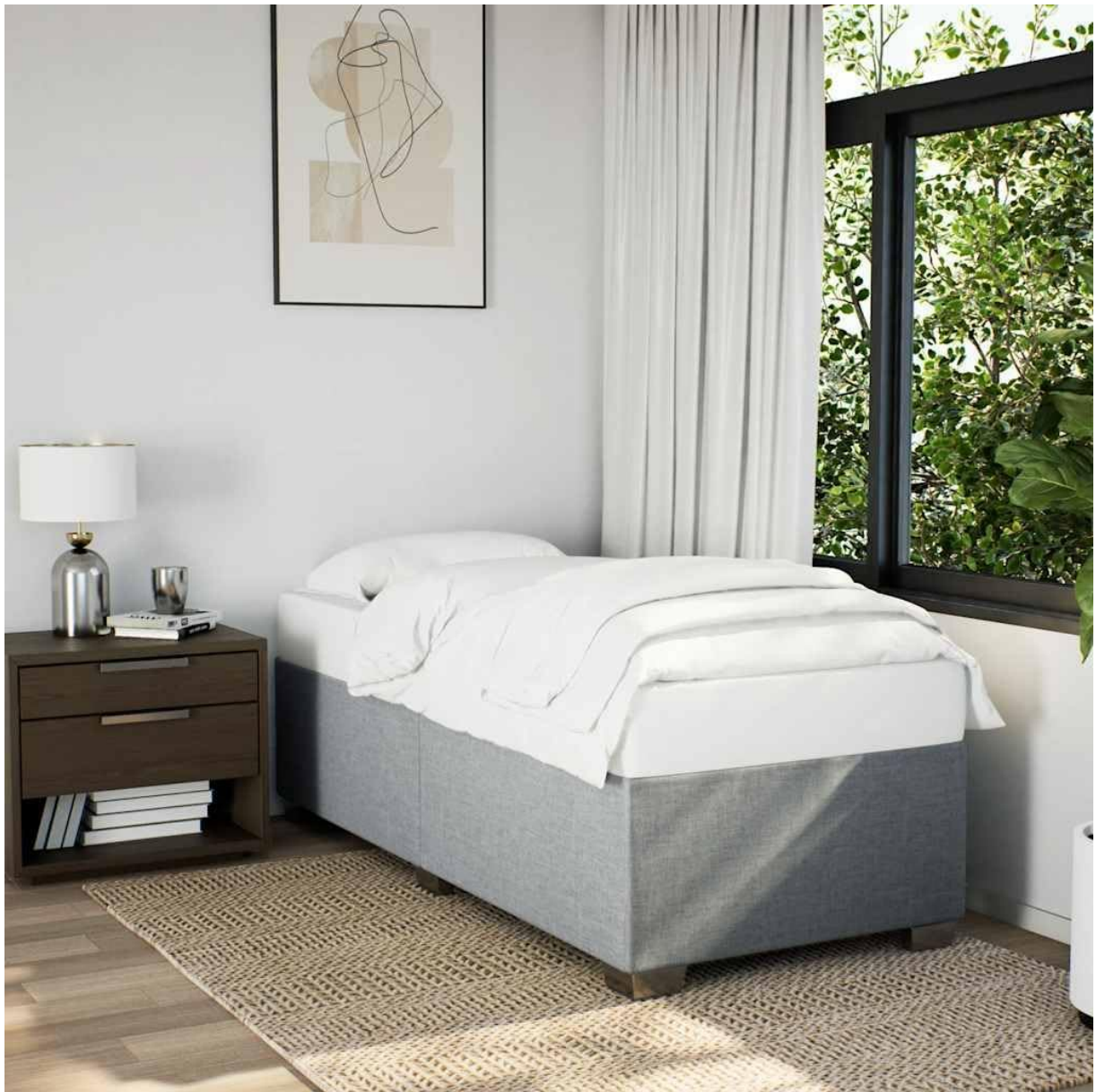
Image 1.1: The vidaXL Twin Fabric Bed Frame in a bedroom environment.