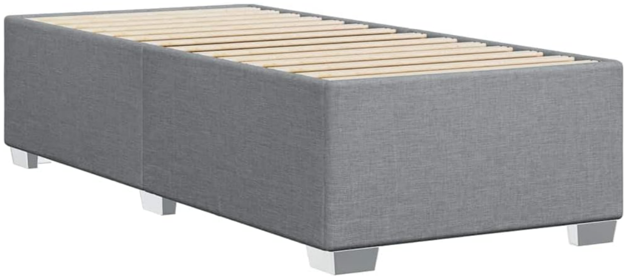
Image 4.2: Detail of the wooden slats and their placement within the frame.