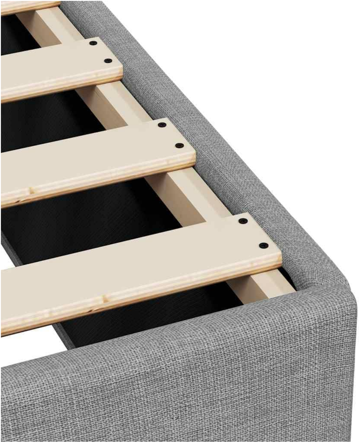
Image 4.1: Angled view of the assembled bed frame, showing the overall structure.